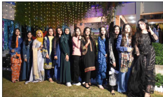
ISLAMABAD: Students pose for group photo during the Alumni Evening of Model College for Girls G10/4.

Moreover, officers stationed at security checkpoints were instructed to improve security, maintain a strict watch on suspicious vehicles and individuals, and ensure the use of all safety gadgets, including bulletproof jackets and helmets.