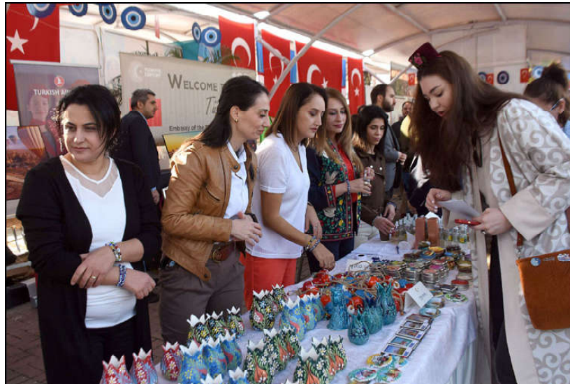
ISLAMABAD: Visitors are visiting on Turkey stall during Pakistan Foreign Office Women's Association (PFOWA) charity bazaar 2024 at Ministry of Foreign Affairs, in the Federal Capital.

WFP brings decades of experience in school meal programmes, implemented in over 100 countries. These initiatives are effective in increasing school attendance, retention, and learning outcomes. The impact goes beyond education, as better health and nutrition are directly linked to a child's ability to focus and succeed academically. She said by integrating school meals with broader health and hygiene efforts, WFP ensures a comprehensive approach to child development.