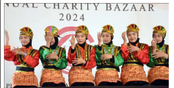
ISLAMABAD: Indonesian artists performing during Pakistan Foreign Office Women's Association (PFOWA) charity bazaar 2024 at Ministry of Foreign Affairs, in the Federal Capital.

HSA integrated advanced technologies like Optical Mark Recognition (OMR) systems for efficient and precise results grading while maintaining quota-based categorization. Public sector institutions, including the police, Secretariat Training Institutes,