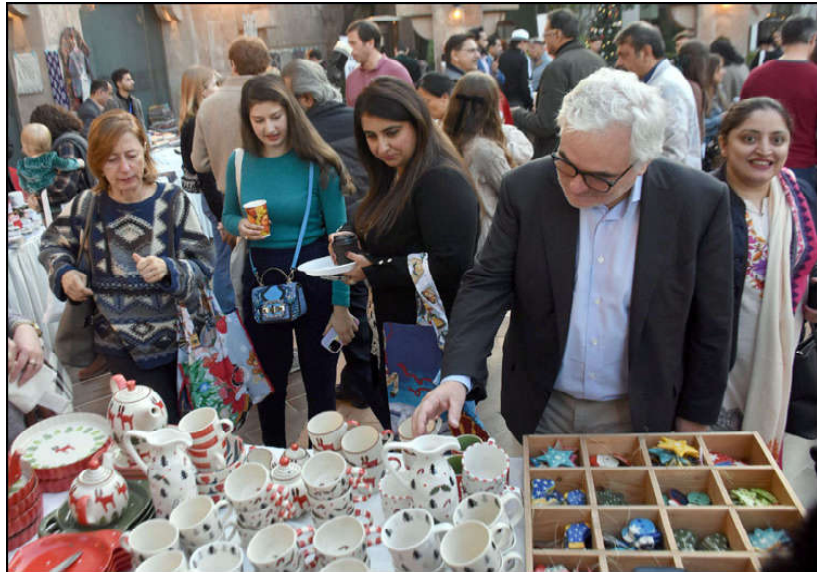
ISLAMABAD: German Ambassador to Pakistan Alfred Grannas participate in Annual Christmas Market under the auspices of the German embassy in Islamabad at a local hotel in the Federal Capital.

acknowledged that challenges exist, but assured that the government is diligently working to address them. She emphasized that every citizen has the right to express their opinions and while digital platforms provide ample opportunities for self-expression, their temporary unavailability does not stifle citizens' freedom of speech. Responding to another query, the minister stated that the government is currently upgrading its web management system, with a focus on enhancing cybersecurity measures to effectively counter and control cyber attacks and terrorist activities. The minister also announced that the government plans to expand 4G and 5G internet services across Pakistan by April.