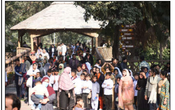
LAHORE: Citizens visiting parks on holiday in the provincial capital.

She highlighted, "AIDS patients deserve sympathy, not hatred." Madam Chief Minister said, "Inequality in access to AIDS prevention, testing and treatment must be eliminated." She added, "Services of communities active in the eradication and treatment of AIDS."