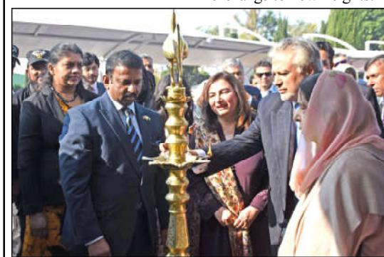
ISLAMABAD: Deputy Prime Minister of Pakistan and Foreign Minister Senator Mohammad Ishaq Dar is lighting traditional oil lamp at Sri Lanka stall during Pakistan Foreign Office Women's Association (PFOWA) charity bazaar 2024 at Ministry of Foreign Affairs, in the Federal Capital.

Barrister Amjad Malik thanked Prime Minister Shehbaz Sharif and assured him that OPC Punjab and OPF would collaborate to resolve the issues of overseas Pakistanis. He also congratulated the economy and boosting the stock exchange to new heights.