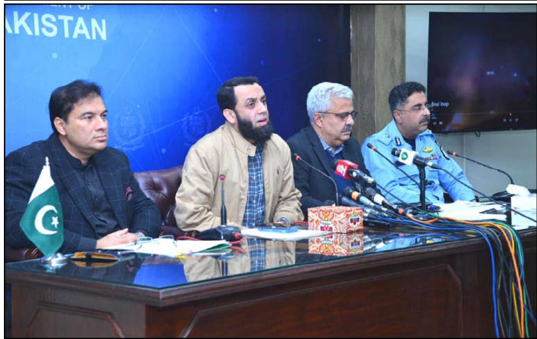
Mr. Attaullah Tarar Federal Minister for Information, Broadcasting and National Heritage, addressed a press conference in Islamabad.

Ph: 284-1470/284-1473 REG: No. BC-116 B/ID-445 Vt XXVINo 102, Jamaadi ul Awwal 29, 1446 AH Monday December 02, 2024 Pages 08, Price Rs.15