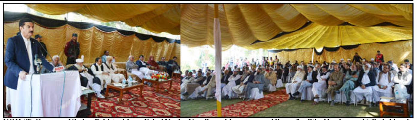
KOHAT: Governor Khyber Pakhtunkhwa, Faisal Karim Kundi speaking at a grand jirga of political leaders and tribal elders in Kohat.