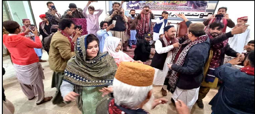
QUETTA: People are wearing traditional clothes as they are holding celebration on the occasion of Sindhi Cultural Day, at Quetta press club.

The faculty members and students on the occasion termed their visit to FC Headquarters as very useful. They said that they got very useful information during the visit. They said that Army and FC is taking certain measures for security of the province. They said that a lot of wrong information was being spread on the social media, but they got right picture through visit.