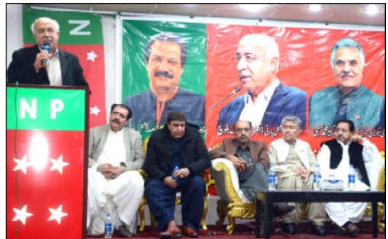
QUETTA: President National Party former chief minister Dr Abdul Malik addressing during a ceremony hosted by member Central Committee National Party Ramzan Hazara.