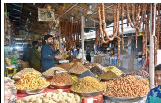
ISLAMABAD: Vendors displaying dry fruit to attract the customers at Sunday Bazaar, Peshawar Morr.