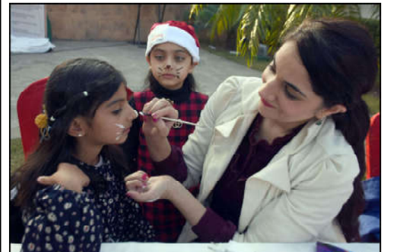
ISLAMABAD: People making drawing on the check during their visit to different stalls in Annual Christmas Market under the auspices of the German Embassy in Islamabad at a local hotel.

"Naran and Kaghan are truly heaven on earth, the snowfall has made them even more beautiful," said a tourist from abroad.