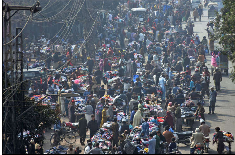
LAHORE: Citizens are buying second-hand warm jackets and warm clothes in Kotwali Chowk of the provincial capital on holidays.

additional tax revenues," he stated. He cited examples from countries like India and Indonesia, where public-private partnerships with foreign collaborators have enhanced local production of high-yielding seeds. These partnerships circumvent the lengthy process of developing new cultivars while ensuring affordable access to high-yield seeds, ultimately boosting crop productivity and farm incomes. Highlighting the scope of corporate farming, he noted the need for capital investment in land acquisition, agricultural machinery, and irrigation systems. "Corporate farming can also expand the cultivated area, increasing oilseed production and saving substantial foreign exchange," he said.