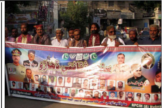
HYDERABAD: Members of National Peace Committee for Interfaith Harmony are wearing Sindh traditional dresses as they holding celebration rally on the occasion of Sindh Culture Day, at Hyderabad press club.