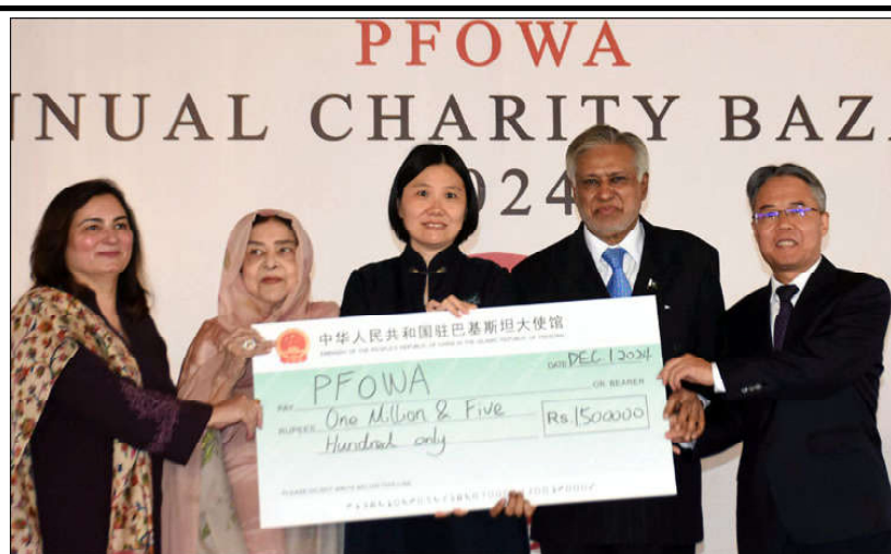
ISLAMABAD: Ambassador of China to Pakistan Jiang Zaidong giving a donation check to Deputy Prime Minister and Foreign Minister Senator Mohammad Ishaq Dar during Pakistan Foreign Office Women's Association (PFOWA) charity bazaar 2024 at Ministry of Foreign Affairs, in the Federal Capital.

As women comprise half of our population,