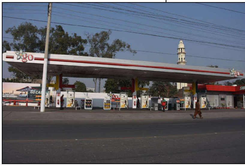
LAHORE: A view of deserted petrol pump due to increase in petrol prices.

SARGODHA (APP): Farmers have been advised to remove weeds from gram crop to get bumper yield. A spokesman for the Agriculture (Extension) Department said on Sunday that weeds were very dangerous for gram crop; therefore, farmers should remove all types of weeds from their crops. He said that growers should prefer hoeing [God] with rotary-weeder instead of using spray for weed removal.