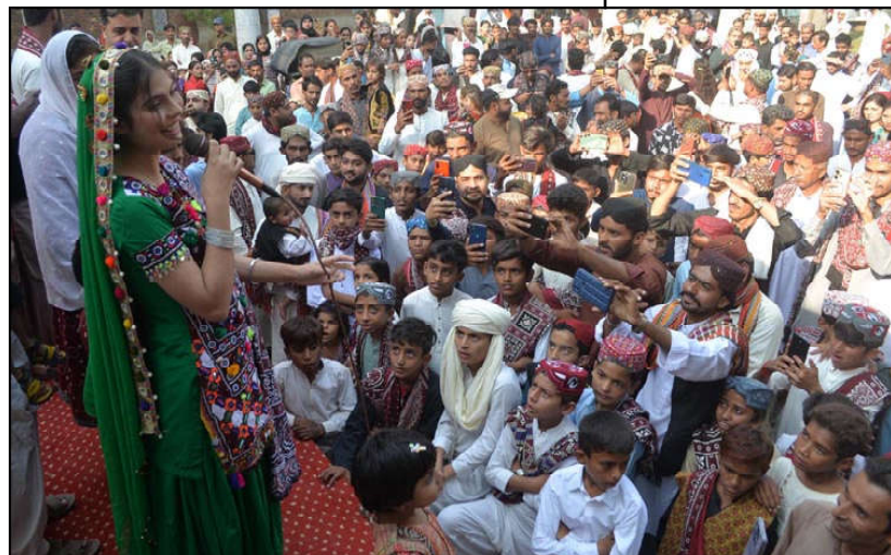
HYDERABAD: Large number of people enjoying the performance of folksinger during the Sindh Cultural Day celebrations at Sindh Museum.