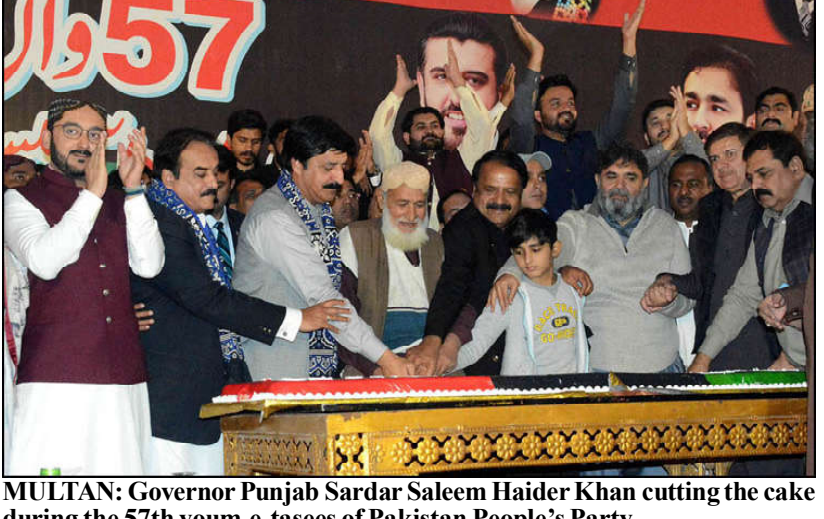
during the 57th youm-e-tasees of Pakistan People's Party.

He stressed plans to visit Kohat with importance of eradicating terrorism and unrest in the District, education, emphasizing that the engagement, and women's