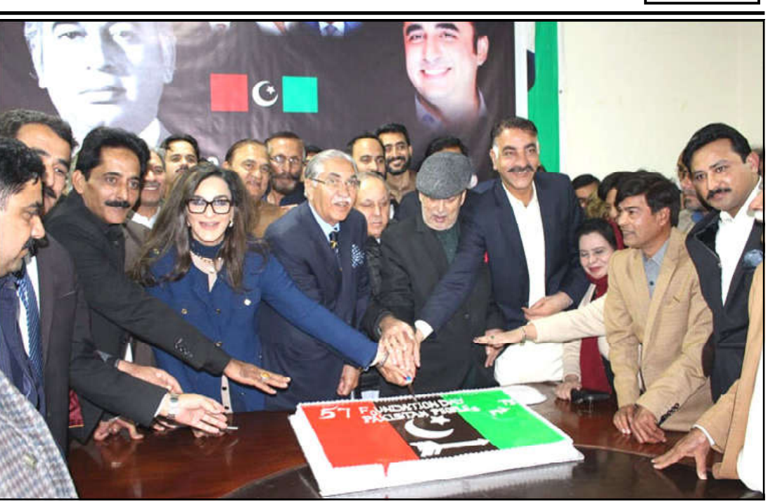
ISLAMABAD: PPP Leaders cutting the cake on the occasion of 57th Foundation Day ceremony of Pakistan Peoples Party at Federal Capital.