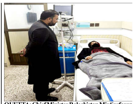
QUETTA: Chief Minister Balochistan Mir Sarfaraz Ahmed Bugti enquiring about health of a lady party worker who becomes unconscious during 57th founding day ceremony of Pakistan Peoples Party.

The winners were selected by a distinguished jury consisting of six experts from the corporate, banking and financial sectors. As always a neutral, transparent and impartial evaluation process was adopted to determine the in 2016. These awards are best performers for these