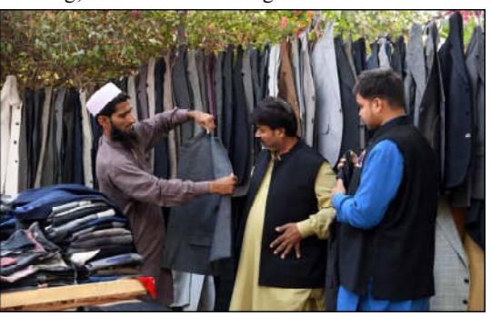
LARKANA: People purchasing used coats from roadside vendor.