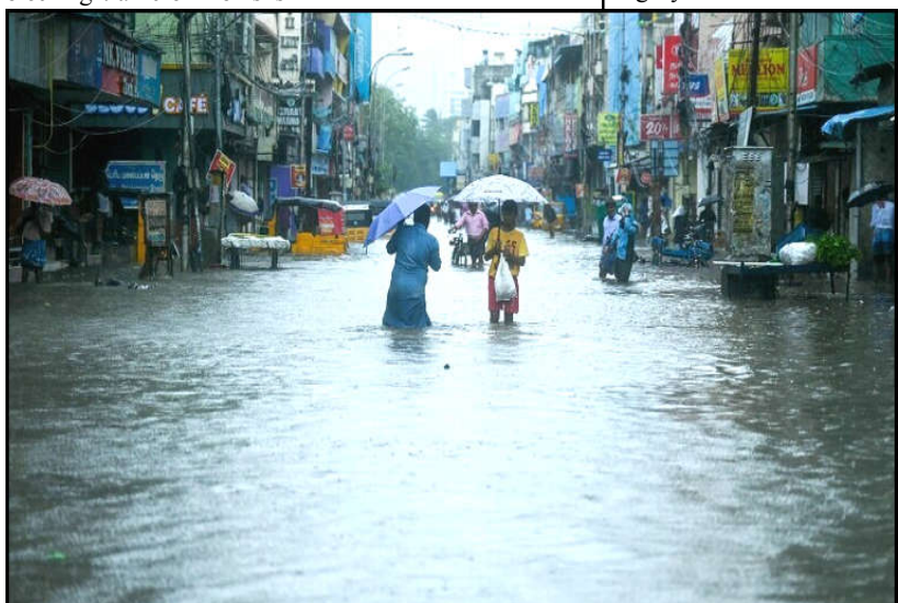
People wade through a flooded street as it rains ahead of a cyclonic storm in

Democratically governed Taiwan rejects China's claims of sovereignty.