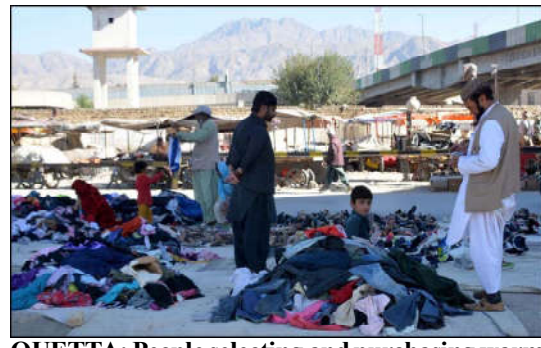
QUETTA: People selecting and purchasing warm cloth from roadside vendor stall.

The meeting also highlighted collaborative efforts of Pakistan, Azerbaijan, and