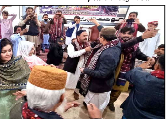
QUETTA: People are wearing traditional clothes as they are holding celebration on the occasion of Sindhi Cultural Day, at Quetta press club.

Later, the members of delegation were briefed about the border management, security as well as the anti-smuggling and narcotics initiatives of FC besides