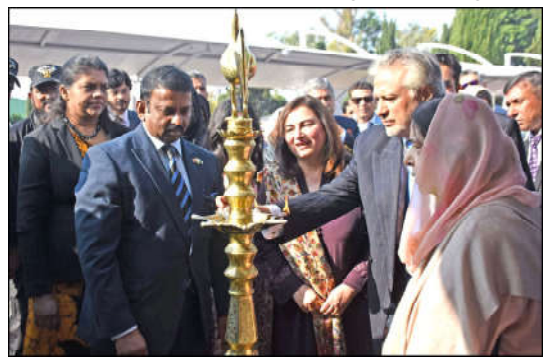
ISLAMABAD: Deputy Prime Minister of Pakistan and Foreign Minister Senator Mohammad Ishaq Dar is lighting traditional oil lamp at Sri Lanka stall during Pakistan Foreign Office Women's Association (PFOWA) charity bazaar 2024 at Ministry of Foreign Affairs, in the Federal Capital.

Barrister Amjad Malik thanked Prime Minister Shehbaz Sharif and assured him that OPC Punjab and OPF would collaborate to resolve the issues of overseas Pakistanis. He also congratulated the government for stimulating the economy and boosting the stock exchange to new heights.