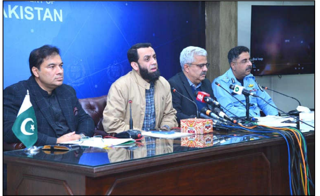
Mr. Attaullah Tarar Federal Minister for Information, Broadcasting and National Heritage, addressed a press conference in Islamabad.

"Likewise, we are calling them out for their fake propaganda and communicating the fact to the people through different channels," he added.