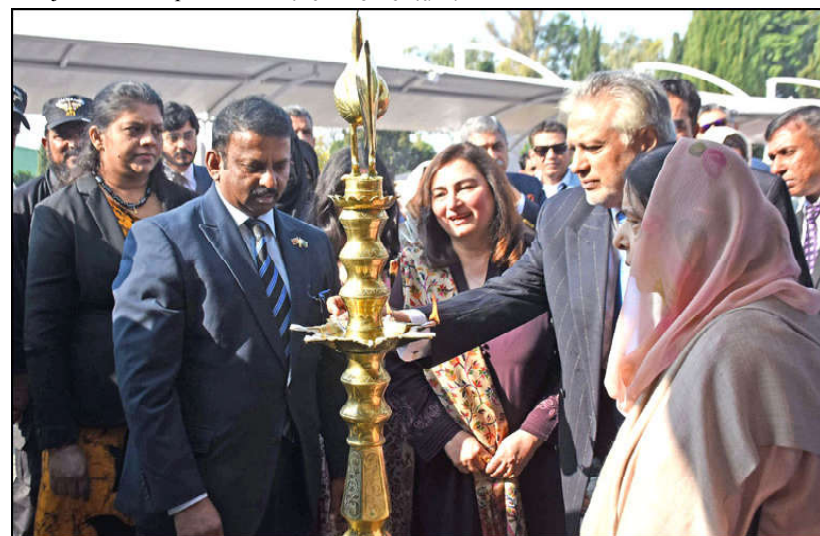
ISLAMABAD: Deputy Prime Minister of Pakistan and Foreign Minister Senator Mohammad Ishaq Dar is lighting traditional oil lamp at Sri Lanka stall during Pakistan Foreign Office Women's Association (PFOWA) charity bazaar 2024 at Ministry of Foreign Affairs, in the Federal Capital.

The faculty members and students on the occasion termed their visit to FC Headquarters as very useful. They said that they got very useful information during the visit. They said that Army and FC is taking certain measures for security of the province. They said that a lot of wrong information was being spread on the social media, but they got right picture through visit.