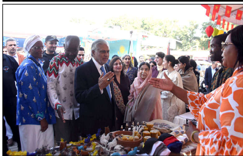
ISLAMABAD: Deputy Prime Minister of Pakistan and Foreign Minister Senator Mohammad Ishaq Dar is visiting at a stall during Pakistan Foreign Office Women's Association (PFOWA) charity bazaar 2024 at Ministry of Foreign Affairs, in the Federal Capital.