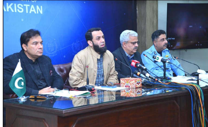
Mr. Attaullah Tarar Federal Minister for Information, Broadcasting and National Heritage, addressed a press conference in Islamabad.

The fight against terrorism would continue till the complete eradication of this menace from the country, the press release quoted the prime minister as saying.