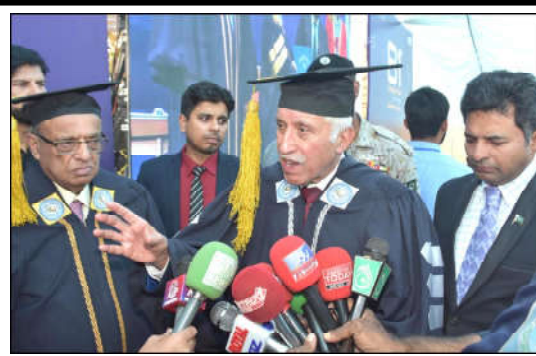
Federal Minister For Maritime Affairs, Qaiser Ahmed Sheikh, talking to the Media persons during the Convocation ceremony at National University of Computer and Emerging Sciences, Chiniot - Faisalabad Campus.

He also noted that both Azad Kashmir and Gilgit-Baltistan had fought for their freedom, with the support of tribal forces and