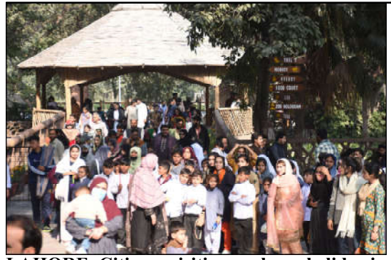
LAHORE: Citizens visiting parks on holiday in the provincial capital.

He pointed out that, for the sake of peace and stability in the province, political parties must unite, regardless of differences.