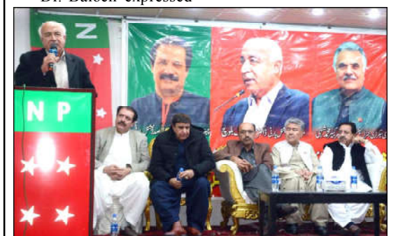
QUETTA: President National Party former chief minister Dr Abdul Malik addressing during a ceremony hosted by member Central Committee National Party Ramzan Hazara.