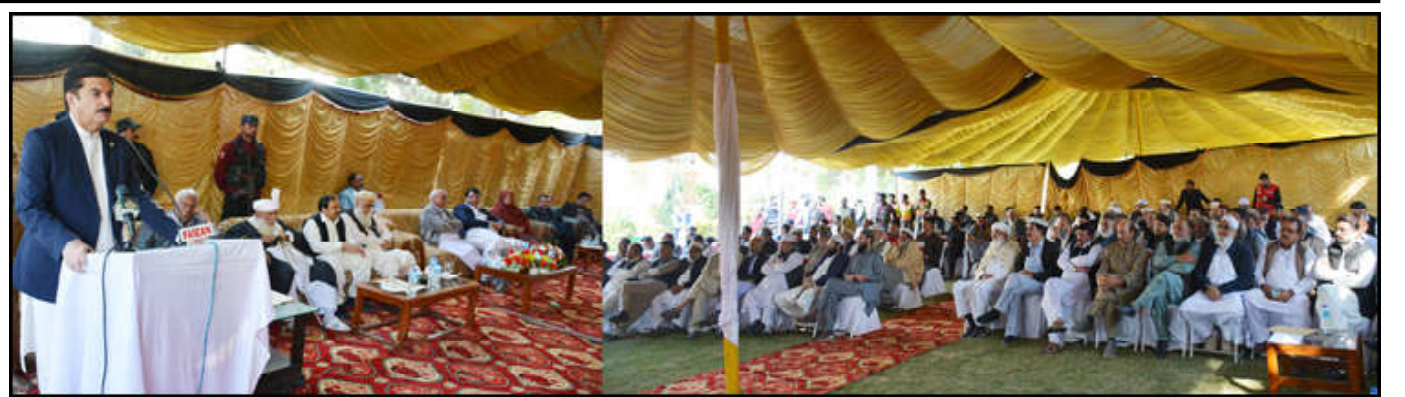
KOHAT: Governor Khyber Pakhtunkhwa, Faisal Karim Kundi speaking at a grand jirga of political leaders and tribal elders in Kohat.