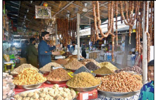
ISLAMABAD: Vendors displaying dry fruit to attract the customers at Sunday Bazaar, Peshawar Morr.