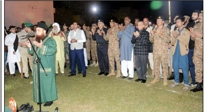
LAHORE: Prime Minister Muhammad Shehbaz Sharif attending funeral of Captain Muhammad Zohaib-ud-Din Shaheed.

In Paris, London and Washington DC, the governments proposed the areas for protests, he said, asking whether any civilized country allowed the protestors to wield AK-47 guns and possessed shells and glass marbles during the protests.