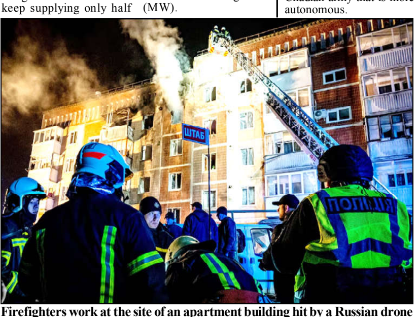
Firefighters work at the site of an apartment building hit by a Russian drone

with a jihadist insurgency for over a decade, and back ing by French and US troops has failed to bring stability. "This rupture is part of our will to build a Chadian army that is more