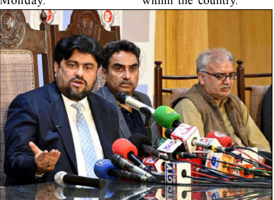
LAHORE: Governor Sindh Kamran Tessori talking to the media persons during meet the press program at Lahore press club.

Coal Block-II at a Deputy Chairman Planning significantly lower fuel Commission, Federal Secretary Energy Fakhre price of Rs 4.8 per kWh, compared to Rs 19.5 per Alam, and others attended kWh for imported coal, the meeting. Shah said that Thar which has resulted in a Coal represents the most foreign exchange saving of approximately $1.3 billion, economical source of a communique said on electricity generation within the country.