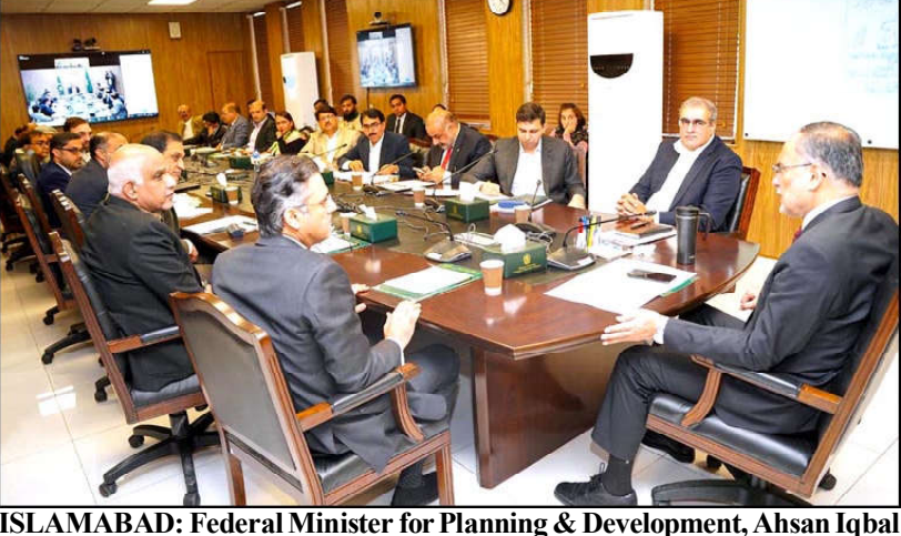
chairs a high-level meeting to expedite immediate solutions for the Neelum

different cases. The police have started further investiga-