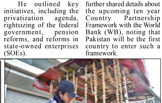
QUETTA: With the winter chill settling in, a street vendor at Joint Road sees a surge in demand for crispy peanuts, a favorite seasonal dryfruit perfect for cold days in the city.

The price of gold in the international market decreased by $17 to $2,633 from $2,650, the Association reported.