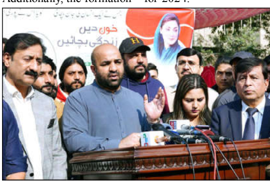
LAHORE: Punjab Education Minister Rana Sikandar Hayat talking to the media during his visit to the blood camp organized by Sundas Foundation at MAO College.

uniforms, and caps, as well as the formation of need for an effective a special committee to review PERA's operational procedures and regulations