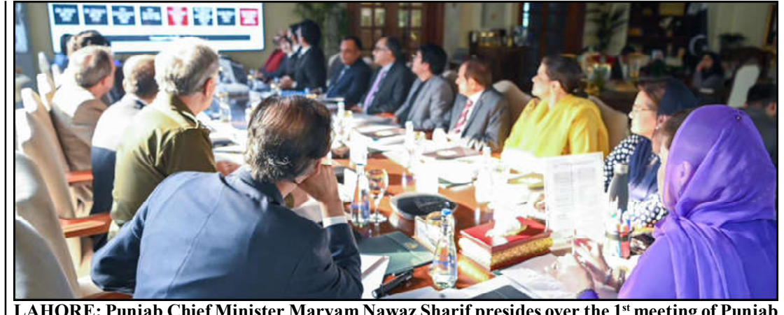
LAHORE: Punjab Chief Minister Maryam Nawaz Sharif presides over the 1st meeting of Punjab

drive change. Women and WDD Punjab call on all stakeholders, including individuals, organizations, policymakers, to join hands in creating a safe, equitable, and violencefree society for all.