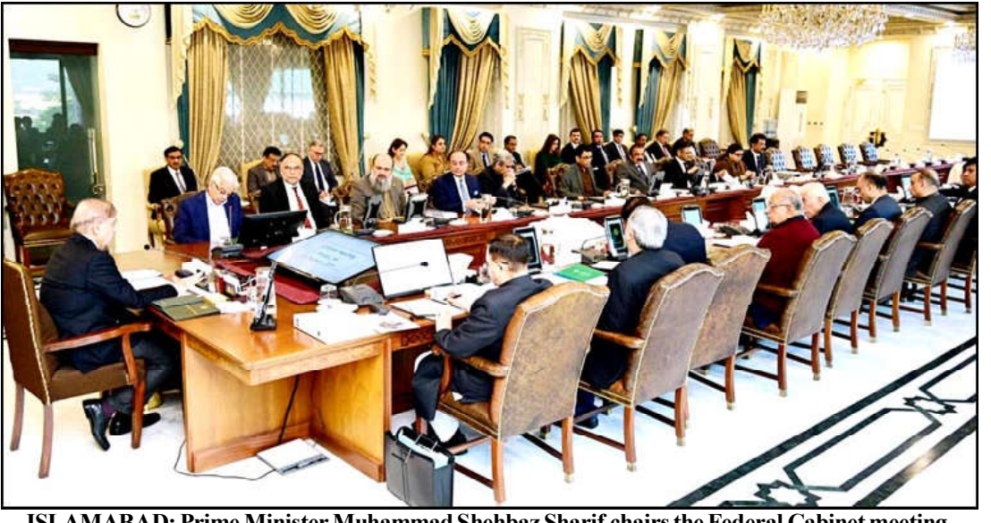
ISLAMABAD: Prime Minister Muhammad Shehbaz Sharif chairs the Federal Cabinet meeting.

Ph: 2841470/2841473 REG: No. BC-116 B/ID-445 Vol. XXVI No. 103, Jamaadi ul Awwal 30, 1446 AH Tuesday December 03, 2024 Pages 08, Price Rs. 15