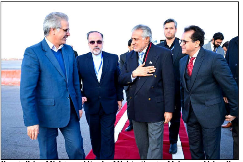
Deputy Prime Minister and Foreign Minister Senator Mohammad Ishaq Dar has arrived in Mashhad, Iran. He was warmly received at the airport by Vice Governor General of Razavi Khorasan province Mohammad Ali Nabipoor and Pakistan's Ambassador to Iran, Mudassir Tipu.

On month-on-month basis, it increased by 0.5% in November 2024 as compared to an increase of 1.5% in the previous CPI inflation Urban, de- month and an increase of 0.4% in November