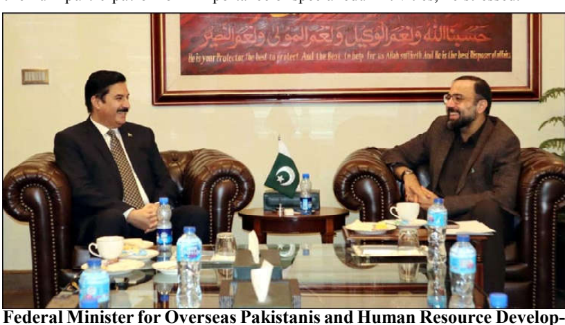
ment Chaudhry Salik Hussain meets with Governor KP Faisal Karim Kundi in Islamabad.