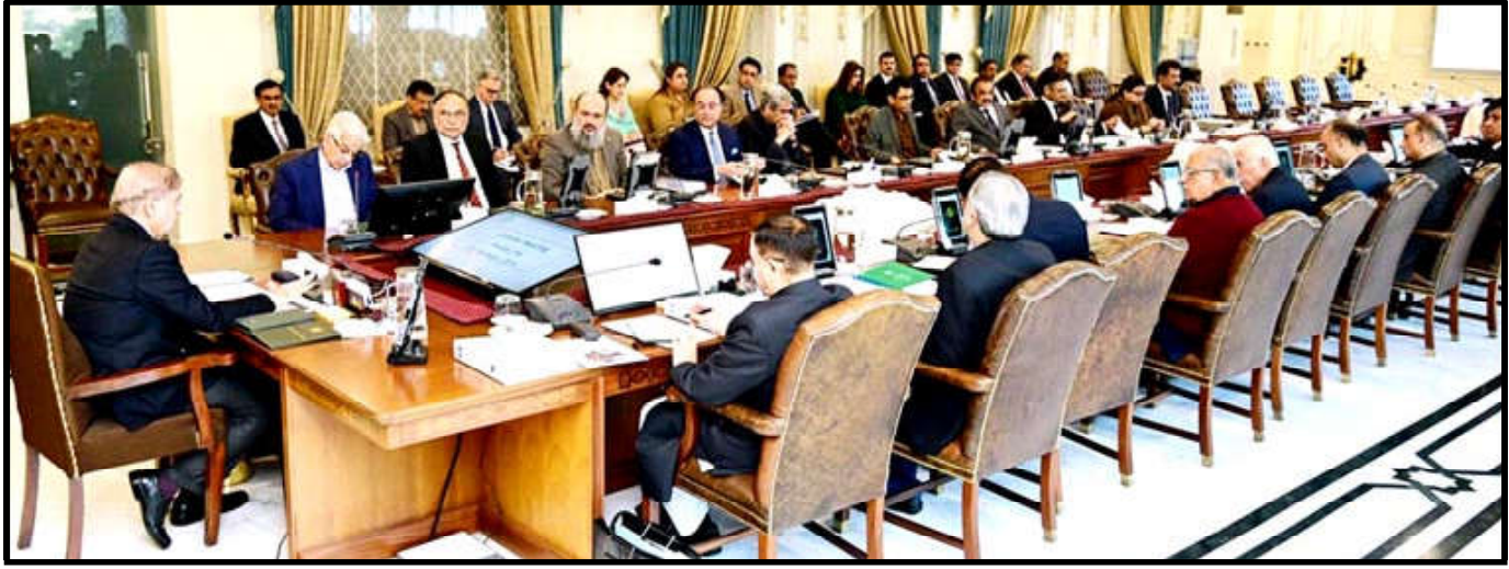
ISLAMABAD: Prime Minister Muhammad Shehbaz Sharif chairs the Federal Cabinet meeting.

Vol. XIV No. 280 Reg. mails-B / ID-445 Tuesday December 03, 2024, Jamaadi ul Awwal 30,1446 A.H. Ph: 2158688, 2158997 Pages 4: Rs. 12