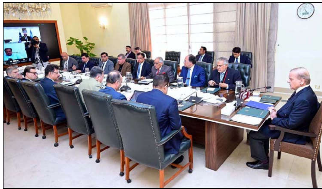
ISLAMABAD: Prime Minister, Muhammad Shehbaz Sharif chairs a review meeting regarding KSAs Investments in various sectors in Pakistan, in Islamahad.