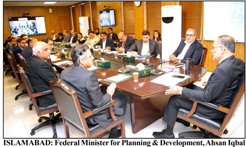
chairs a high-level meeting to expedite immediate solutions for the Neelum Jhelum Hydropower Project.

"From the outset, an accountability mechanism should have been in place to monitor progress and assign responsibilities, especially for a project of this scale, he remarked.