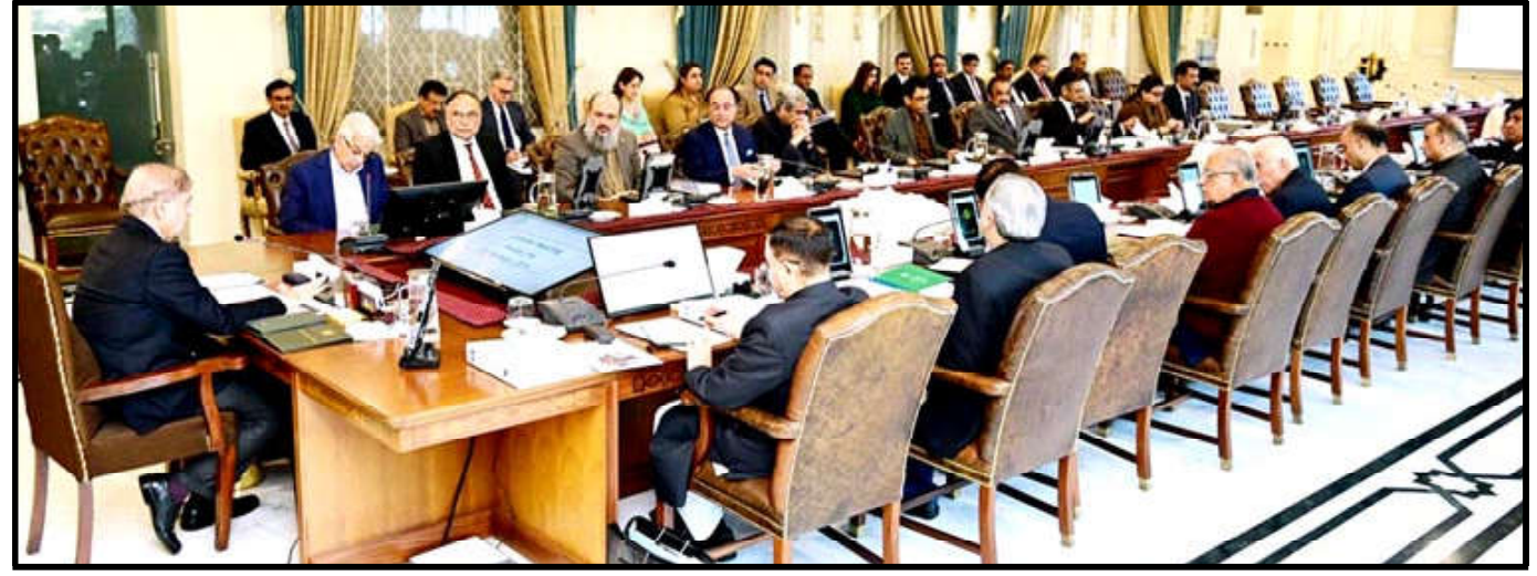
ISLAMABAD: Prime Minister Muhammad Shehbaz Sharif chairs the Federal Cabinet meeting.

Ph: 2841470/2841473 Vol: XIX No. 267, Jamaadi ul Awwal 30, 1446 AH Tuesday December 03, Pages 04, Price Rs.15