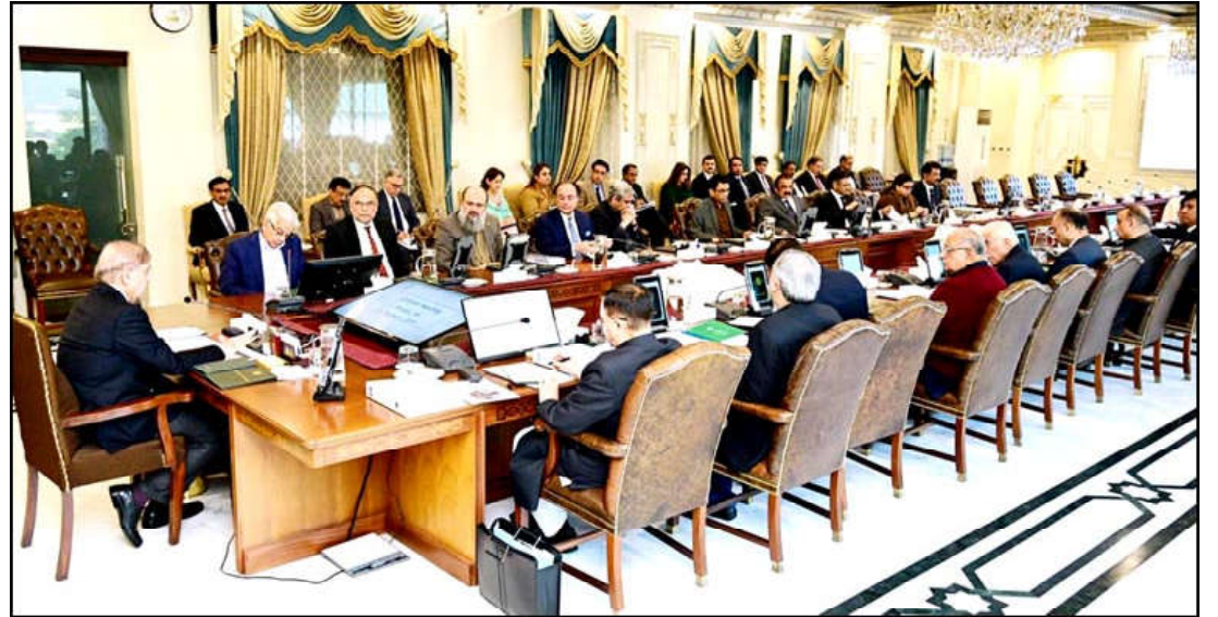
ISLAMABAD: Prime Minister Muhammad Shehbaz Sharif chairs the Federal Cabinet meeting.

The cabinet, on the proposal of ministry of education and professional training also gave a go ahead to the renewal of the Memoranda of Understandings with respect to University of Cambridge, Saint Antony's College University of Oxford, University of Jordan, Pecking University China, University of Hydal Berg, and Pakistan Chairs in Germany.