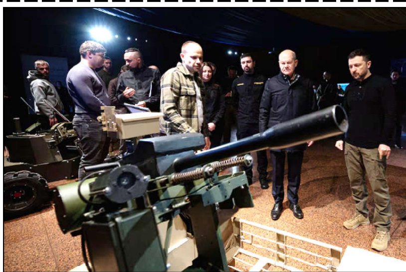
Ukraine's President Volodymyr Zelenskyy and German Chancellor Olaf Scholz visit an exhibition of Ukrainian unmanned vehicles, amid Russia's attack on Ukraine, in Kyiv.