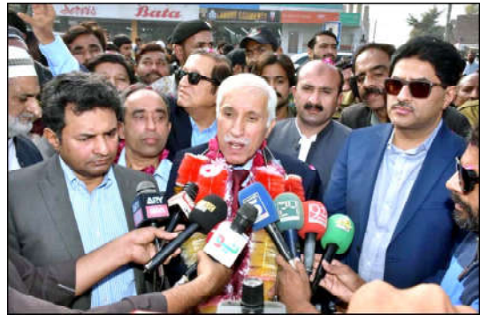
CHINIOT: Federal Minister for Maritime Affairs, Qaiser Ahmed Shaikh, talking to the media persons.