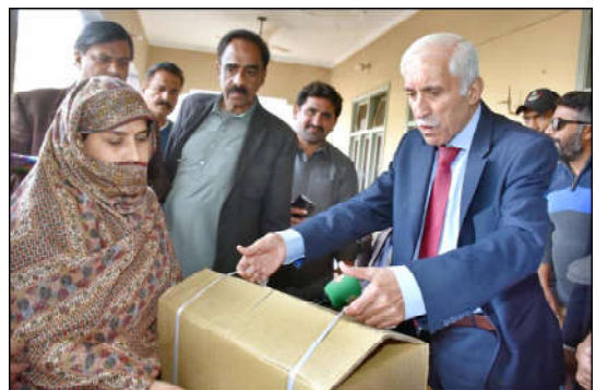
CHINIOT: Federal Minister for Maritime Affairs, Qaiser Ahmed Shaikh, distributing sewing machines to the poor ladies while holding a "Khuli Kachehri" (Open Court).

FAISALABAD (APP): Federal Minister for Maritime Affairs Qaiser Ahmed Sheikh laid foundation stone for establishment of two new public parks in Chiniot on Monday and vowed his commitment to public service and urban development in the area. Among the new public parks in the city included "Fatima Ladies Park" in Mohalla Mashki Shah and "Irfan Qaiser Sheikh Park" near Lorry Adda Chiniot. Addressing the foundation stone ceremony, the minister highlighted these projects as part of a broader initiative to create recreational spaces for the residents. "Parks and sports grounds contribute to a healthier and happier society", he said, adding that these facilities would enhance Chiniot's urban landscape and quality of life. The minister also arranged an open court at his office in Chiniot and heard public grievances relating to provision of civic amenities, utilities and health services. He said that redressal of public problems was collective responsibility.