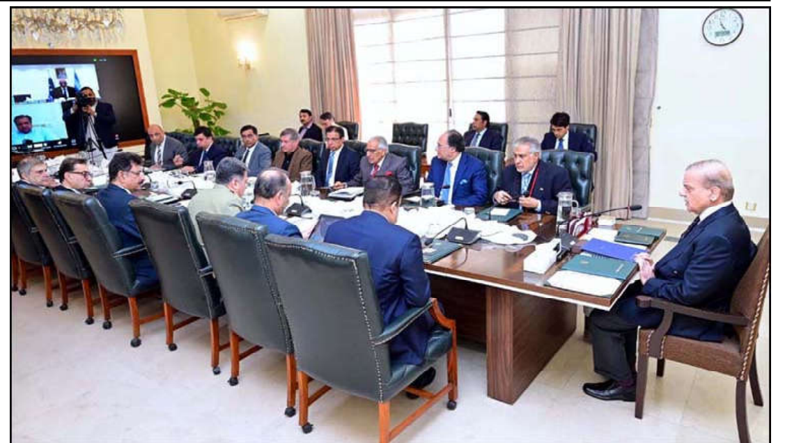
ISLAMABAD: Prime Minister, Muhammad Shehbaz Sharif chairs a review meeting regarding KSAs Investments in various sectors in Pakistan, in Islamabad.