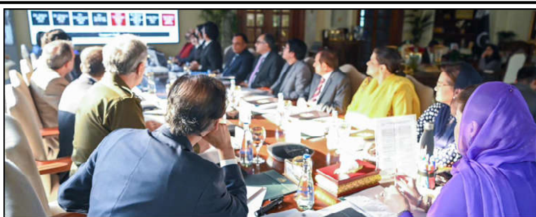
LAHORE: Punjab Chief Minister Maryam Nawaz Sharif presides over the 1st meeting of Punjab Enforcement and Regulatory Authority.