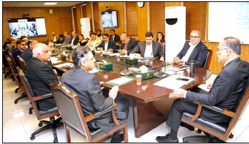
ISLAMABAD: Federal Minister for Planning & Development, Ahsan Iqbal chairs a high-level meeting to expedite immediate solutions for the Neelum Jhelum Hydropower Project.

He warned that stern action would be taken against those committing negligence and carelessness in their duties.