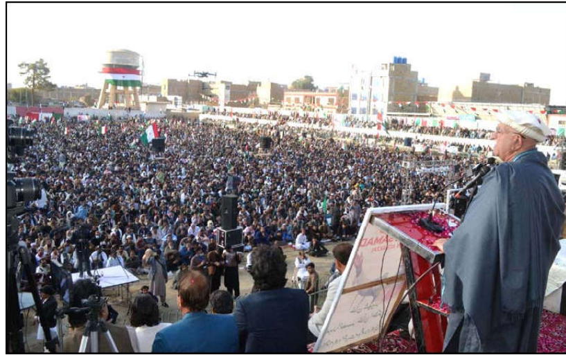
QUETTA: Pakhtunkhwa Milli Awami Party (PKMAP) Chief, Mehmood Khan Achakzai addresses to his supporters during public gathering meeting on the occasion of 51st death anniversary of the Shaheed Abdul Samad Khan Achakzai, in Quetta.