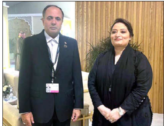
RIYADH: Iranian Minister for Agriculture Gholamreza Nouri Ghezleji along with Coordinator to the Prime Minister on Climate Change Romina Khurshid Alam after meeting.

program. During the inauguration ceremony, the officers involved emphasized that the agricultural census is crucial for national development and effective planning. Therefore, all the participants should fully understand the technical aspects and usefulness of agricultural census and fulfill their responsibilities in the best possible way. In the meeting, it was further emphasized that all the participants should utilize their capabilities to achieve the desired results and make this process a success.