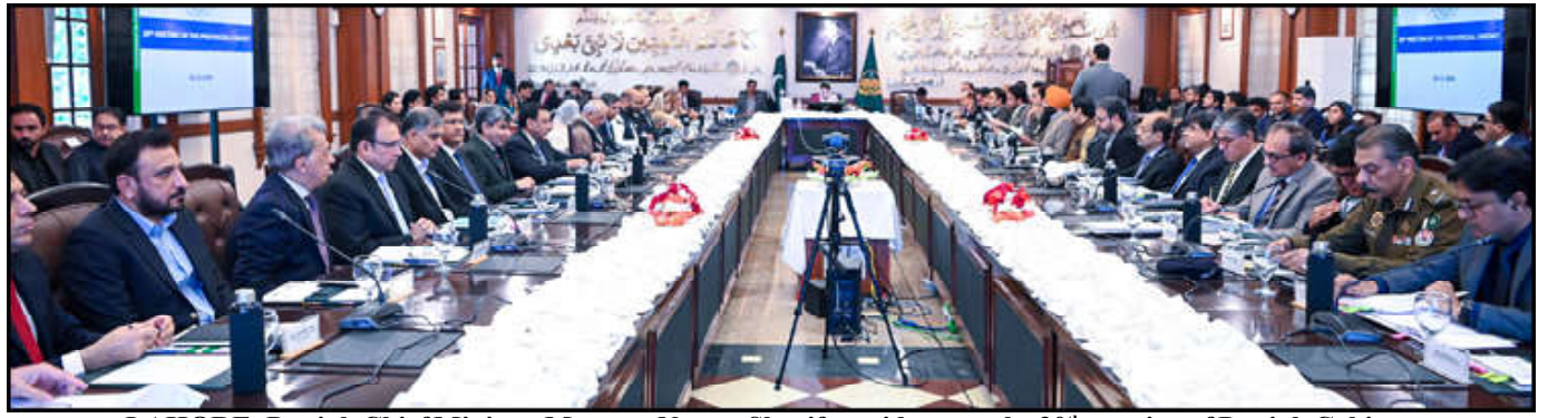
LAHORE: Punjab Chief Minister Maryam Nawaz Sharif presides over the 20 th meeting of Punjab Cabinet.

merciless violence of PTI workers' mob. The SP was beaten so mercilessly with nailed sticks that his skull and brain were damaged and his eye was swollen, she said. The CM said, "I have never seen such a display of brutality, cruelty and violence in my life. A policeman was shot at close range, which went through his body." She lamented that the constable martyred by the violence of PTI workers has little children. A special force of 10,000 trained security personnel will be established in Punjab to combat riots. Attacks on Dera Ghazi Khan and Mianwali check posts have increased. She directed to improve the security arrangements.