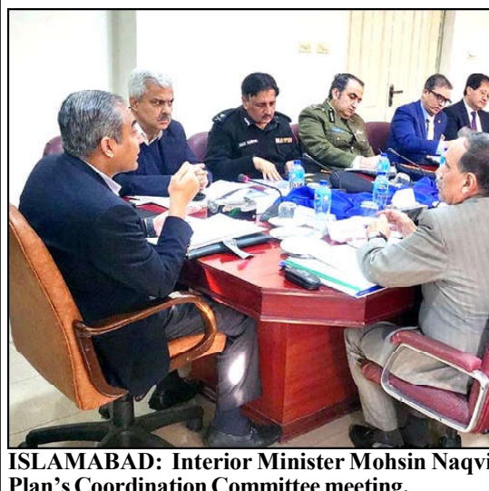
ISLAMABAD: Interior Minister Mohsin Naqvi chairing National Action Plan's Coordination Committee meeting.

MUZZAFFARABAD (Online): Azad Kashmir Supreme Court has suspended controversial presidential ordinance of AJK government. A full court presided over by Chief Justice Raja Saeed Akram Khan of AJK SC heard the petition. The court issued order for suspending presidential ordinance after preliminary hearing. The court on the appeal of bar council and civil society restrained government from promulgating ordinance. It is pertinent to mention here that under the ordinance it was necessary to obtain permission from DC a week before any protest and public meeting or procession. Under ordinance no unregistered party or organization was entitled to file application for protest.