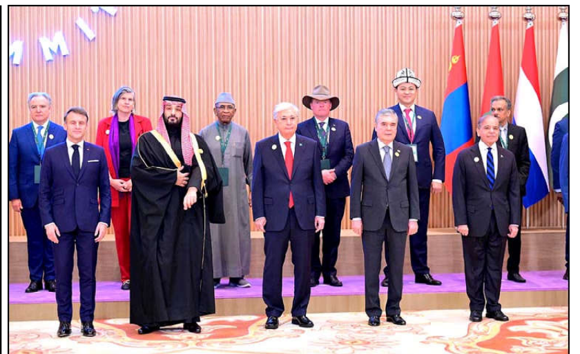
RIYADH: Prime Minister Muhammad Shehbaz Sharif in the family photo of the One-Water Summit.