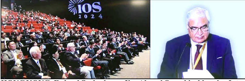
HONG KONG: Federal Ombudsman Ijaz Ahmed Qureshi addressing International Ombudsmen Conference 2024 on eve of 35th anniversary of establishment of Ombudsman office

put all the differences away, sit on a table and ment has pledged to com- work jointly," he noted.