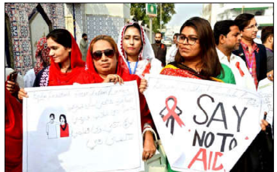
LARKANA: Women participating in a awareness walk on the mark of World HIV, AIDS Day organized by Bridge Consultant's Foundation Pakistan at Arts Council Road.