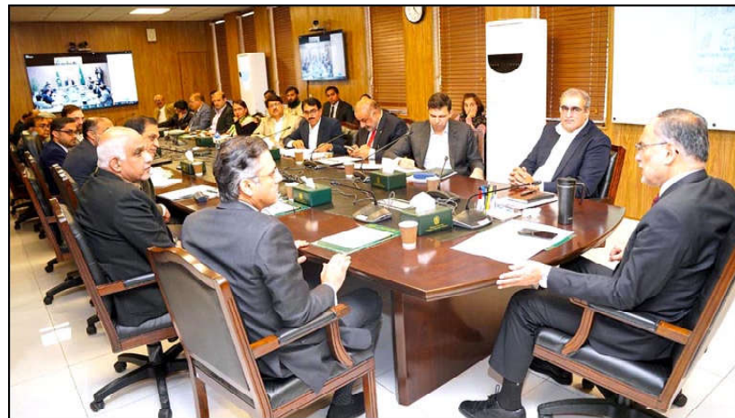
ISLAMABAD: Federal Minister for Planning & Development, Ahsan Iqbal chairs a high-level meeting to expedite immediate solutions for the Neelum Jhelum Hydropower Project.

Additionally, the minister emphasized the internal accountability process concerning poor project management by WAPDA. During the meeting, officials briefed the minister on the project's technical issues, stating that while some problems had been identified, accountability was still under investigation. Ahsan Iqbal expressed serious concerns over the delay, highlighting that it had hindered timely investigations and accountability. "From the outset, an accountability mechanism should have been in place to monitor progress and assign responsibilities, especially for a project of this scale," he remarked. The minister directed that both approaches to the investigation be pursued, including engaging an international consultant and speeding up the completion of ongoing work, adding that all mega projects like Diamer-Bhasha Dam must be free of poor project management. He stressed the need for an independent validation of NESPAK's work by international experts to avoid similar recurring issues in the future, and stated that the reform of NESPAK must be undertaken as a priority.