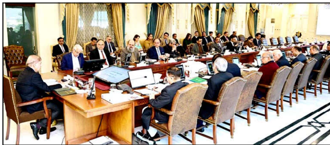
ISLAMABAD: Prime Minister Muhammad Shehbaz Sharif chairs the Federal Cabinet Meeting.

Furthermore, Deputy Commissioner South has been given 24 hours to submit a detailed inquiry report. The Chief Secretary emphasized the importance of preserving greenery in urban areas, especially in Karachi, where trees play a crucial role in combating rising pollution and improving environmental sustainability.