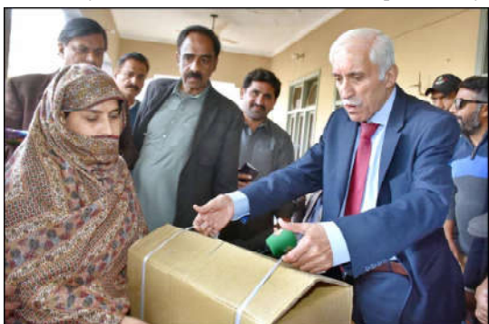
CHINIO: Federal Minister for Maritime Affairs, Qaiser Ahmed Shaikh, distributing sewing machines to the poor ladies while holding a "Khuli Kachehri" (Open Court).

FAISALABAD (APP): Federal Minister for Maritime Affairs Qaiser Ahmed Sheikh laid foundation stone for establishment of two new public parks in Chinio on Monday and vowed his commitment to public service and urban development in the area. Among the new public parks in the city included "Fatima Ladies Park" in Mohalla Mashki Shah and "Irfan Qaiser Sheikh Park" near Lorry Adda Chinio. Addressing the foundation stone ceremony, the minister highlighted these projects as part of a broader initiative to create recreational spaces for the residents. "Parks and sports grounds contribute to a healthier and happier society", he said, adding that these facilities would enhance Chinio's urban landscape and quality of life. The minister also arranged an open court at his office in Chinio and heard public grievances relating to provision of civic amenities, utilities and health services. He said that redressal of public problems was collective responsibility.