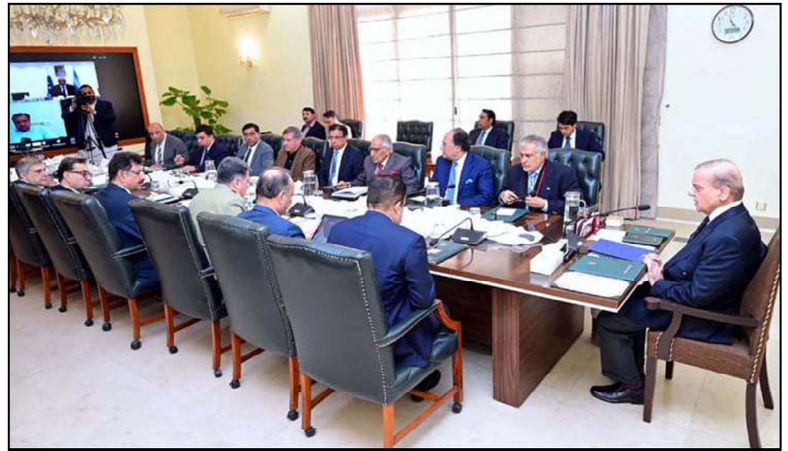
ISLAMABAD: Prime Minister, Muhammad Shehbaz Sharif chairs a review meeting regarding KSAs Investments in various sectors in Pakistan, in Islamabad.

bilateral investments. The meeting was briefed about the progress on bilateral cooperation in various fields in the second meeting of the Pakistan Saudi Arabia Joint Task Force held in November. It was informed that within a short span of time, both the countries had signed of 34 memorandums of understanding (MOUs), seven of which have already been formalized