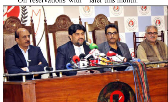
LAHORE: Governor Sindh, Kamran Tessori addresses to media persons during Meet the Press Programme, at Lahore press club.

The PPP Chairman directed committee members to engage with political parties to determine on what issues political consensus can be formed, in order to present recommendations before Party's Central Executive Committee later this month.