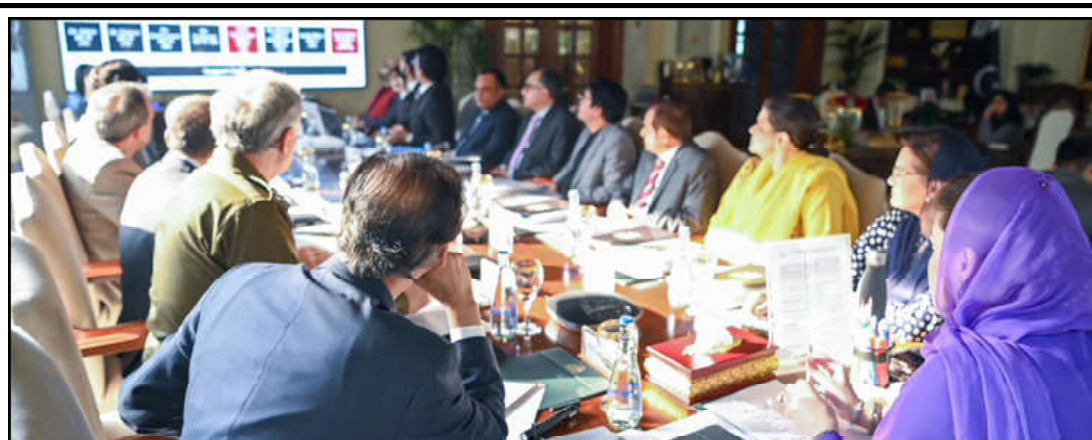
LAHORE: Punjab Chief Minister Maryam Nawaz Sharif presides over the 1st meeting of Punjab Enforcement and Regulatory Authority.

LAHORE (APP): Prime Minister's Youth Programme Chairman Rana Mashhood Ahmad Khan has said that awareness campaigns are of utmost importance to tackle challenges of climate change. He said this while addressing PM's Green Youth Movement Capacity Building Training on Climate Action Toolkit at Aiwan-i-Iqbal on Monday. He said that gym clubs in 137 public sector universities and green movement clubs had been set up, adding that more than 18,000 persons have been registered as club members. Prime Minister Shehbaz Sharif also wrote a letter to the members to encourage them, he added. Rana Mashhood said that after 137 public sector universities, private universities had also been contacted in this regard and there were 268 universities across the country. He said, "We are focusing to make gym clubs in all public and private universities by next year." Later, colleges and schools would be approached in this regard, he said and added that currently smog was the biggest health hazard.