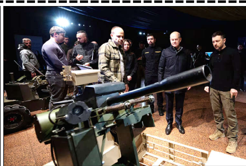
Ukraine's President Volodymyr Zelenskiy and German Chancellor Olaf Scholz visit an exhibition of Ukrainian unmanned vehicles, amid Russia's attack on Ukraine, in Kyiv.