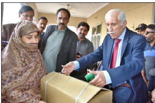
CHINIO: Federal Minister for Maritime Affairs, Qaiser Ahmed Shaikh, distributing sewing machines to the poor ladies while holding a "Khuli Kachehri" (Open Court).

FAISALABAD (APP): Federal Minister for Maritime Affairs Qaiser Ahmed Sheikh laid foundation stone for establishment of two new public parks in Chinio on Monday and vowed his commitment to public service and urban development in the area. Among the new public parks in the city included "Fatima Ladies Park" in Mohalla Mashki Shah and "Irfan Qaiser Sheikh Park" near Lorry Adda Chinio. Addressing the foundation stone ceremony, the minister highlighted these projects as part of a broader initiative to create recreational spaces for the residents. "Parks and sports grounds contribute to a healthier and happier society", he said, adding that these facilities would enhance Chinio's urban landscape and quality of life. The minister also arranged an open court at his office in Chinio and heard public grievances relating to provision of civic amenities, utilities and health services. He said that redressal of public problems was collective responsibility.