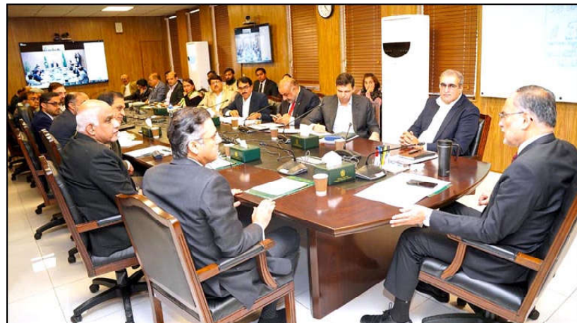
ISLAMABAD: Federal Minister for Planning & Development, Ahsan Iqbal chairs a high-level meeting to expedite immediate solutions for the Neelum Jhelum Hydropower Project.

He stressed the need for an independent validation of NESPAK's work by international experts to avoid similar recurring issues in the future, and stated that the reform of NESPAK must be undertaken as a priority.