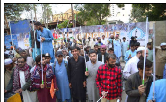
KARACHI: Members of Sindh Blind Action Committee are holding protest demonstration for acceptance of their demands, on the occasion of International Day of Persons with Disabilities, held at Karachi press club.

Jawed Bilwani suggested that instead of applying a flat rate to all types of imported tea, a more thoughtful approach should be adopted.