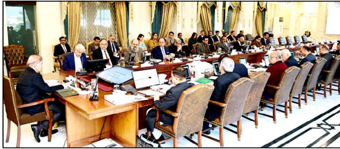
ISLAMABAD: Prime Minister Muhammad Shehbaz Sharif chairs the Federal Cabinet Meeting.

Furthermore, Deputy Commissioner South has been given 24 hours to submit a detailed inquiry report. The Chief Secretary emphasized the importance of preserving greenery in urban areas, especially in Karachi, where trees play a crucial role in combating rising pollution and improving environmental sustainability.