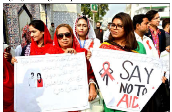
LARKANA: Women participating in a awareness walk on the mark of World HIV/AIDS Day organized by Bridge Consultant's Foundation Pakistan at Arts Council Road.

Heads of various public and private institutions from the district, along with representatives of social organizations are expected to attend the event.