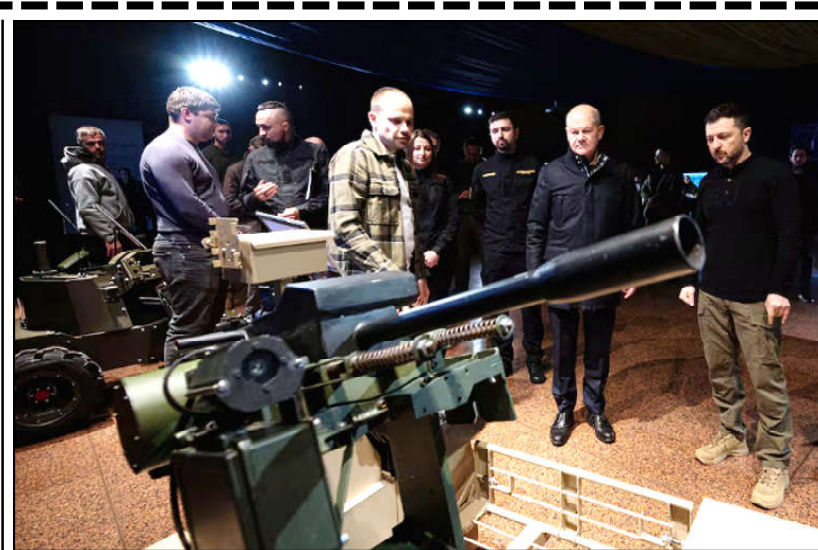
Ukraine's President Volodymyr Zelenskiy and German Chancellor Olaf Scholz visit an exhibition of Ukrainian unmanned vehicles, amid Russia's attack on Ukraine, in Kyiv.