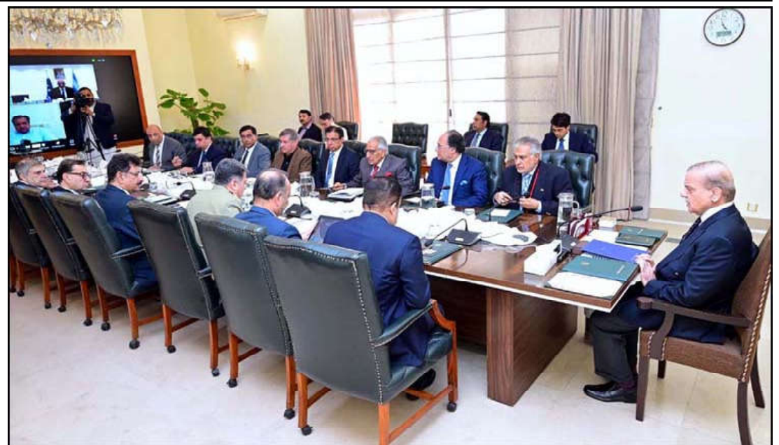
ISLAMABAD: Prime Minister, Muhammad Shehbaz Sharif chairs a review meeting regarding KSAs Investments in various sectors in Pakistan, in Islamabad.