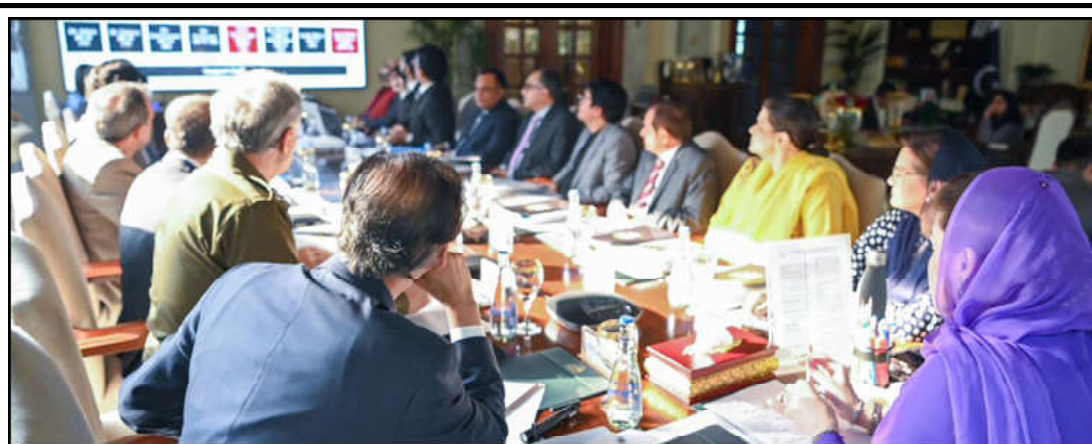
LAHORE: Punjab Chief Minister Maryam Nawaz Sharif presides over the 1st meeting of Punjab Enforcement and Regulatory Authority.

LAHORE (APP): Prime Minister's Youth Programme Chairman Rana Mashhood Ahmad Khan has said that awareness campaigns are of utmost importance to tackle challenges of climate change. He said this while addressing PM's Green Youth Movement Capacity Building Training on Climate Action Toolkit at Aiwan-i-Iqbal on Monday. He said that gym clubs in 137 public sector universities and green movement clubs had been set up, adding that more than 18,000 persons have been registered as club members. Prime Minister Shehbaz Sharif also wrote a letter to the members to encourage them, he added. Rana Mashhood said that after 137 public sector universities, private universities had also been contacted in this regard and there were 268 universities across the country. He said, "We are focusing to make gym clubs in all public and private universities by next year." Later, colleges and schools would be approached in this regard, he said and added that currently smog was the biggest health hazard.