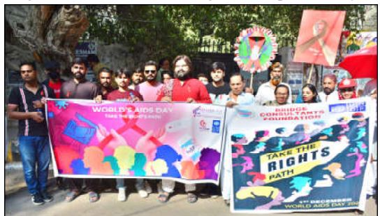
HYDERABAD: People participating in walk to create awareness on the occasion of World AIDS Day organized by Bridge Consultants Foundation outside Press club.