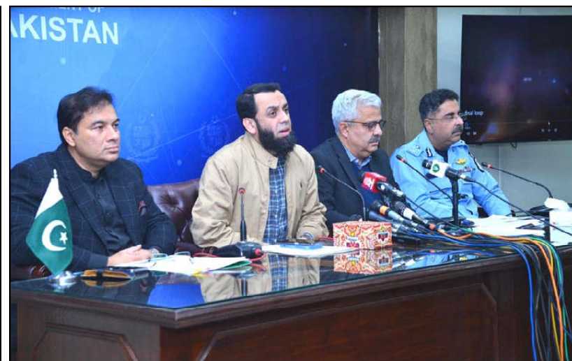
Mr. Attaullah Tarar Federal Minister for Information, Broadcasting and National Heritage, addressed a press conference in Islamabad.

No personnel of the LEA is allowed for the live ammunition, he said, adding that the fake videos and pictures were being created to cover up their humiliation and political failure from the so called final call.