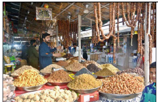
ISLAMABAD: Vendors displaying dry fruit to attract the customers at Sunday Bazaar, Peshawar Morr.

She said by integrating school meals with broader health and hygiene efforts, WFP ensures a comprehensive approach to child development.