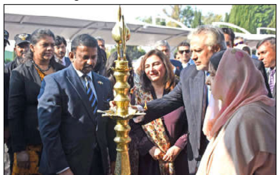
ISLAMABAD: Deputy Prime Minister of Pakistan and Foreign Minister Senator Mohammad Ishaq Dar is lighting traditional oil lamp at Sri Lanka stall during Pakistan Foreign Office Women's Association (PFOWA) charity bazaar 2024 at Ministry of Foreign Affairs, in the Federal Capital.

On the contrary and in spite of the extraordinary concessions extended, PTI violated the court's orders blatantly and instead of holding protest at designated place (Sanghani), unlawfully breached entry towards the Red Zone of Islamabad.