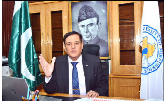
MIRPUR KHAS: The University of Mirpurkhas, established under the Sindh Assembly Act in 2023, has emerged as a beacon of hope for students in Mirpurkhas.

over the tragic incidents, praying for the departed souls and the swift recovery of the injured. Muqam emphasized that the issue transcends politics, urging all stakeholders to unite for a common resolution. "This is not just a provincial issue; it concerns the entire nation," he said and highlighted his efforts to foster unity, including visits to the Chief Minister's House and collaboration with the Governor of Khyber Pakhtunkhwa. The minister reiterated that lasting solutions can only be achieved through dialogue, not conflict. He promised to personally discuss the compensation package with the prime minister and present the matter to the federal cabinet.