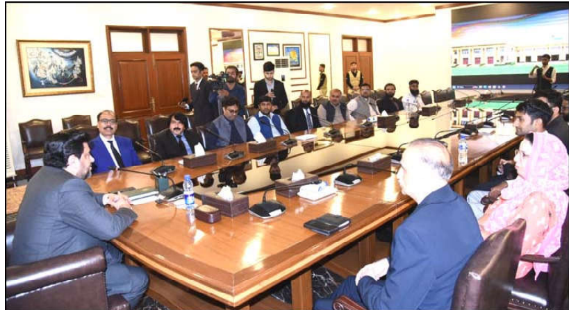
KARACHI: Under trainee Executive Engineers of WAPDA meeting with Governor Sindh Kamran Khan Tessori.