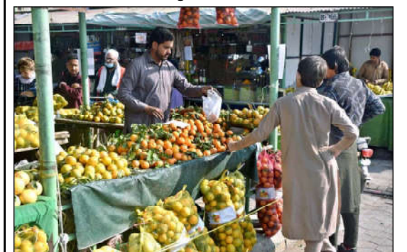
ISLAMABAD: Vendors displaying seasonal fruits to attract the customers at Sunday Bazaar, Peshawar Morr.

These partnerships circumvent the lengthy process of developing new cultivars while ensuring affordable access to high-yield seeds, ultimately boosting crop productivity and farm incomes.