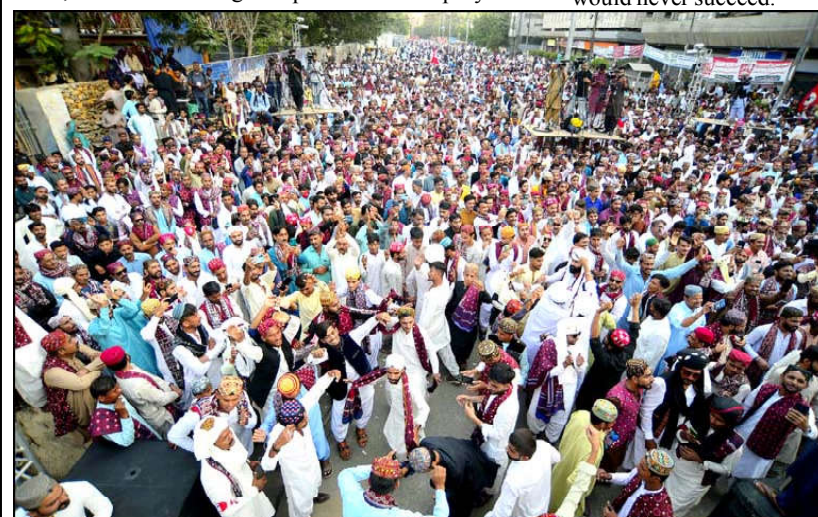
KARACHI: A large number of people are wearing Sindh traditional dresses as they hold celebration demonstration on the occasion of Sindh Culture Day held at Karachi press club.

The Deputy Prime Minister will hold meetings with participating ministers and other dignitaries on the sidelines of the ministerial meeting.