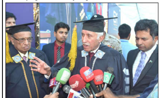
Federal Minister For Maritime Affairs, Qaiser Ahmed Sheikh, talking to the Media persons during the Convocation ceremony at National University of Computer and Emerging Sciences, Chiniot - Faisalabad Campus.

Bilawal Bhutto offered prayers for the elevation of ranks of the martyred soldiers and expressed heartfelt condolences to their families, praying for their strength and patience in this time of grief.