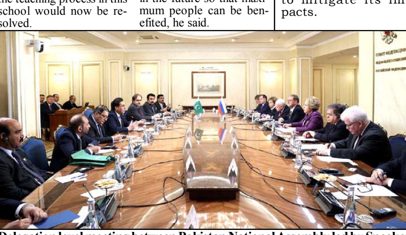
Delegation level meeting between Pakistan National Assembly led by Speaker HE Sardar Ayaz Sadiq and Russian Federation Council led by HE Ms Valentina Matviyenko in Moscow.

He highlighted that the adverse effects of climate change are affecting the entire world, stressing the need for collective action to mitigate its im