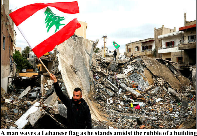
destroyed in Israeli strikes in Tyre, Lebanon.