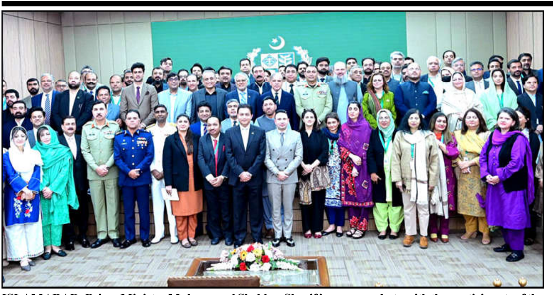
ISLAMABAD: Prime Minister Muhammad Shehbaz Sharif in a group photo with the participants of the 26th National Security Workshop

ment to execute a compre- ence over strong perfor-