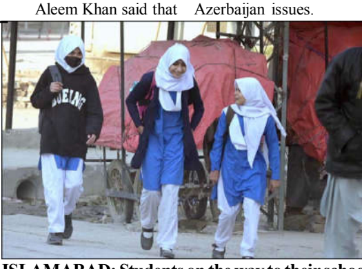
ISLAMABAD: Students on the way to their school following the reopening of educational institutions

The meeting also decided to nominate a Focal Person from each department for Pakistan-