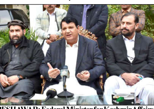
PESHAWAR: Federal Minister for Kashmir Affairs, Gilgit-Baltistan and SAFRON Engr. Amir Muqam addressing a press conference at his residence.

They provided a comprehensive overview of the application process, highlighting key strategies to increase the chances of accepworldwide under the Chief tance at top-tier institutions.