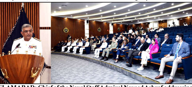
ISLAMABAD: Chief of the Naval Staff Admiral Naveed Ashraf addressing the participants of 7th Maritime Security Workshop (MARSEW-7) during visit to Naval Headquarters.