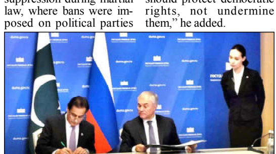
MOSCOW: Speaker National Assembly, Sardar Ayaz Sadio and Chairman Russian State Duma, Vvacheslav Voldodin signing agreement on cooperation.