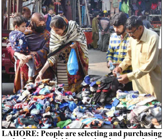
socks from roadside setup in a local market in Provincial Capital.

past five years. As most Pakistan sesame is for export, with more than 1/3 goes to China, AVC aims to link the quality sesame from Pakistani growers served by Syngenta with and cash crop import international value chain partners especially in