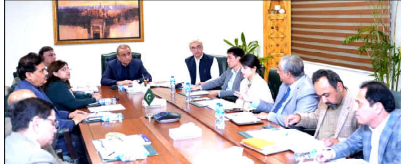
ISLAMABAD: Federal Minister for Board of Investment presided high level meeting on Special Economic Zones.