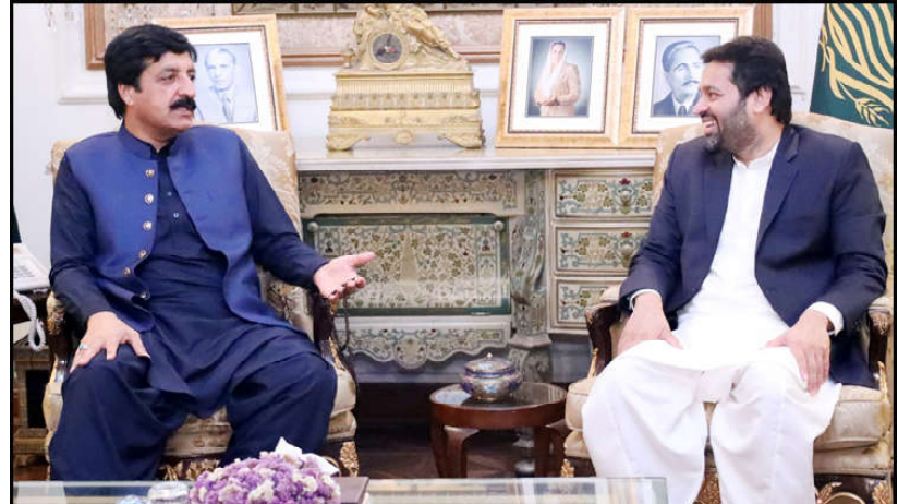
LAHORE: Deputy Speaker Punjab Assembly Zaheer Iqbal Chhanar meeting with Governor Punjab, Sardar Saleem Haider Khan at the Governor House.

Sindh's water to be taken away." His remarks underscore the province's consistent resistance to projects perceived as harmful to its water rights. The CM emphasised the necessity for full implementation of the 1991 Water Accord and urged that it be granted constitutional protection to safeguard Sindh's water rights. He also pointed out the PPP's significant position in the province, saying that it [PPP] holds a two-thirds majority in the Sindh Assembly and represents over 70 per cent of the province's population.