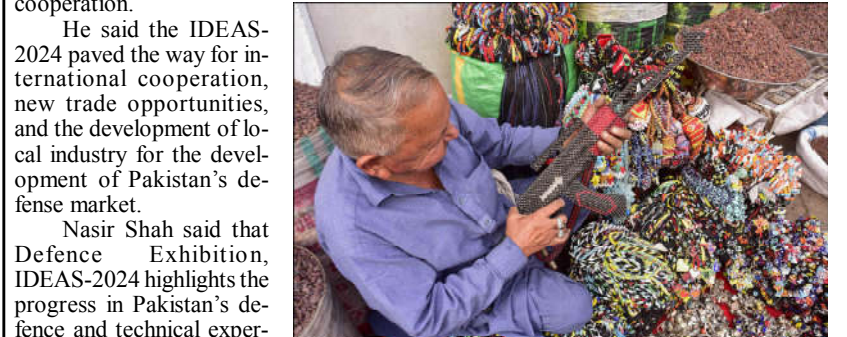
PESHAWAR: A man selling handmade decoration gun along roadside at Ashraf road.