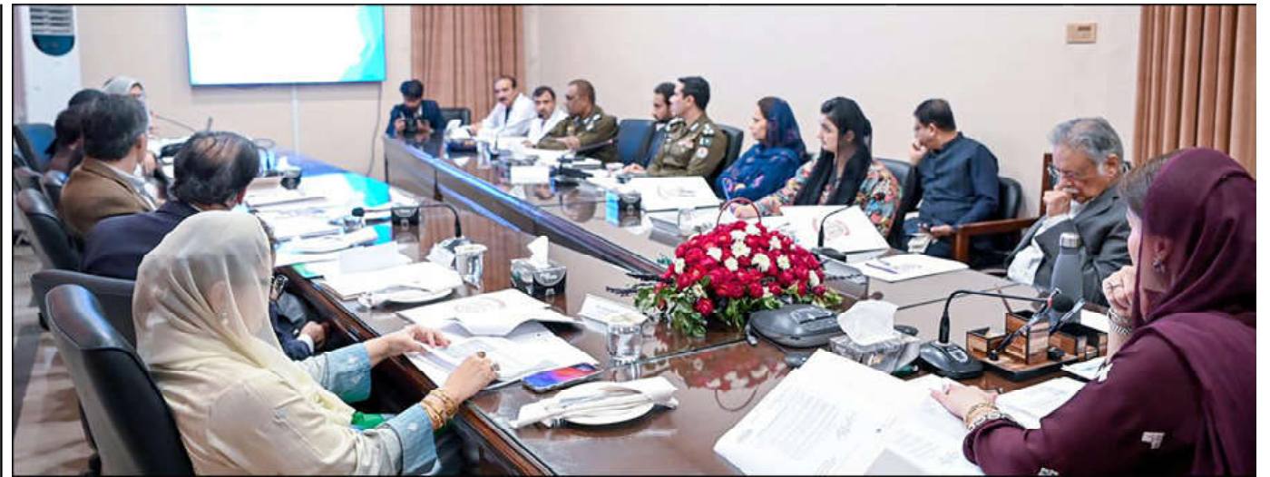
LAHORE: Punjab Chief Minister Maryam Nawaz Sharif presides over the meeting to review law and order situation in Multan Division.