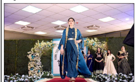
ISLAMABAD: Students taking part in a fashion show titled "Elegance of Flare" held at FG Home economics college F11/3 in Alumni Evening 2024.

He said the student delegation visited the Security