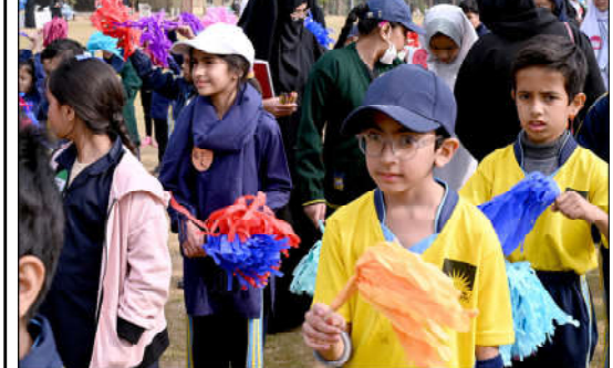
ISLAMABAD: Students participating in Annual Sports day session 2024-25 of Dar-e-Arqam school PWD, Pakistan town and Sohan Garden branches at Naval anchorage Club.

ISLAMABAD (APP): Indus River System Authority (IRSA) on Saturday released 96,500 cusecs water from various rim stations with inflow of 50,100 cusecs. According to the data released by IRSA, water level in River Indus at Tarbela Dam was 1503.25 feet and was 105.25 feet higher than its dead level of 1,398 feet. Water inflow and outflow in the dam was recorded as 23,700 cusecs and 49,000 cusecs respectively. The water level in River Jhelum at Mangla Dam was 1163.75 feet, which was 113.75 feet higher than its dead level of 1,050 feet. The inflow and outflow of water was recorded 5,900 cusecs and 27,000 cusecs respectively.