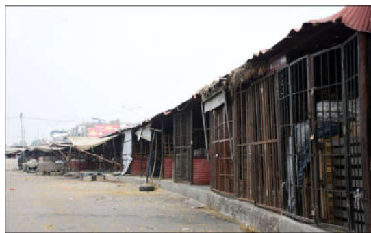
ISLAMABAD: A view of deserted fruit and vegetable market at sector I-11 due to road closed with shipping containers ahead of PTI protest, in the Federal Capital.