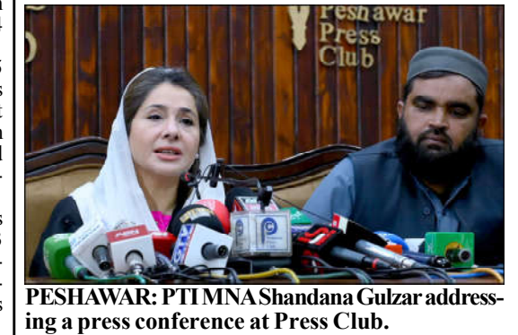
PESHAWAR: PTI MNA Shandana Gulzar addressing a press conference at Press Club.

LAHORE (APP): At least 11 people were killed and 1,701 others injured in 1,559 road accidents in Punjab during the last 24 hours. As many as 755 people with serious injuries were shifted to different hospitals, while 946 with minor injuries were treated at the incident site by rescue medical teams. The data analysis showed that 848 drivers, 53 underage drivers, 210 pedestrians, and 663 passengers were among the victims of road traffic crashes.