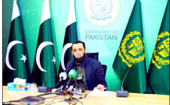
ISLAMABAD: Federal Minister for information, Broadcasting and national Heritage, Attaullah Tarar addresses a press conference.