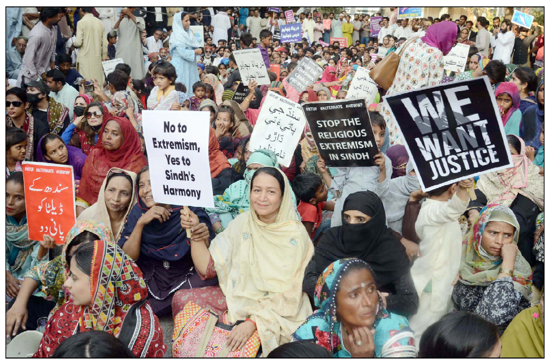
HYDERABAD: Workers of Tolerance March Committee hold banners and placards and shout slogans during a rally in the city

LAHORE (APP): Lahore recorded an Air Quality Index (AQI) of 241 on Saturday, maintaining its position as the most polluted city in the world, according to IQAir rankings. Despite reduced traffic due to blocked entry and exit points, the city's skies remained hazy, creating an unpleasant experience for travelers. Lahore topped the list with an AQI of 241, followed by Delhi (India) at 224, and Tashkent (Uzbekistan) at 177. Other cities in the top 10 included Dhaka (Bangladesh) 172, Sarajevo (Bosnia and Herzegovina) 161, Ulaanbaatar (Mongolia) 159, Wuhan (China) 159, Mumbai (India) 159, Hanoi (Vietnam) 158, and Yangon (Myanmar) (155).