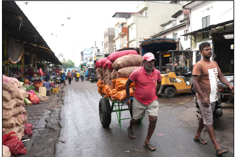
A man pulls a cart as he transports sacks filled with potatoes at a market in Colombo, Sri Lanka.