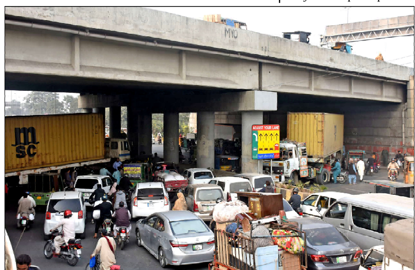
LAHORE: A view of road closed in Provincial Capital ahead of PTI protest, in Islamabad on 24th November.

education. He also urged parents to actively participate in their children's education, ensuring they are well-informed about their progress. Later, the Mayor inspected ongoing renovation work at school. He directed display of Quaid-e-Azam Muhammad Ali Jinnah and Allama Iqbal portraits in classrooms. The ceremony honored students who secured first, second and third positions in the midterm examinations from Prep to 11th grade with cash prizes and shields.