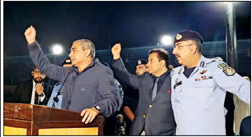
ISLAMABAD: Federal Interior Minister Mohsin Naqvi addressing the ICT police to boost their morale in Police Lines

During stay in Pakistan, President Lukashenko is scheduled to meet President Asif Ali Zardari, Prime Minister Shehbaz Sharif, and military leadership.