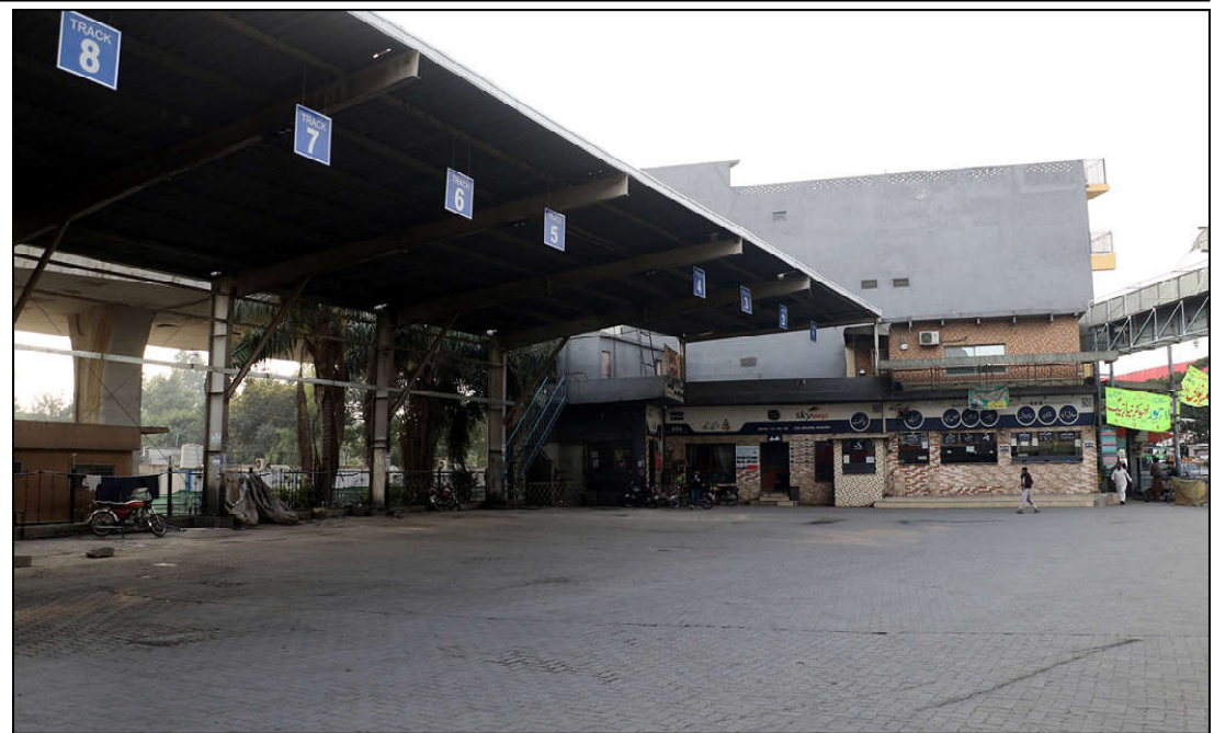
ISLAMABAD: A view of closed General Bus Stand at Faizabaddue to PTI protest on 24 Nov.

the UN High Commissioner to press the Indian government to abide by its international obligations, release all political prisoners, halt state-sponsored violence, and end reprisals against human rights advocates in IIOJ&K. The letter emphasized that the people of Jammu and Kashmir were entitled to the right to self-determination, as enshrined in international law. The appeal also urged the international community to demand better medical care for Kashmiri prisoners and ensure their health and well-being were safeguarded in accordance with global human rights standards.