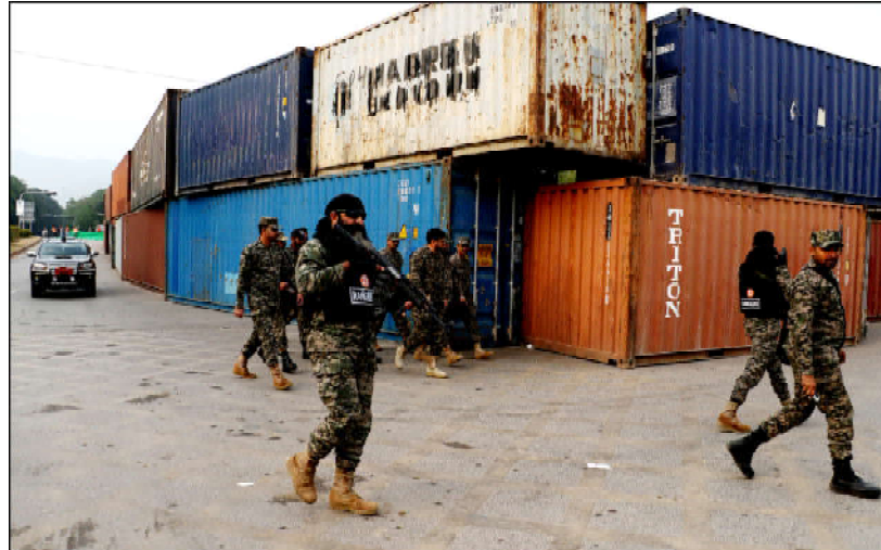
ISLAMABAD: Rangers personal walking alongside containers placed at in capital city due to PTI protest on 24 Nov.

Former prime minister Imran Khan has called for a protest in Islamabad on November 24, warning that those who do not participate will be expelled from the party.