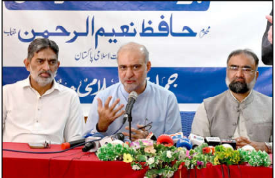
HYDERABAD: Ameer Jamaat-e-Islami Hafiz Naem ur Rehman addressing a press conference at Markaz-e-Tabligh-e-Islam.

LAHORE (INP): The closure of the Motorways has led to a significant increase in passenger traffic at the Lahore Railway Station, causing considerable inconvenience to those traveling to other cities. With fewer transportation options available, many passengers are now opting for trains, leading to overcrowding at the station. Travelers are facing a variety of issues, including difficulty obtaining tickets and delays in train departures. Some passengers have expressed concerns over the availability of seats, while others are frustrated by the lack of timely departures. The increased rush has put additional pressure on railway staff and systems, exacerbating the challenges for commuters. The passengers are facing mounting issues as they struggle to make their way to various destinations amid the disruption caused by the motorway closure.