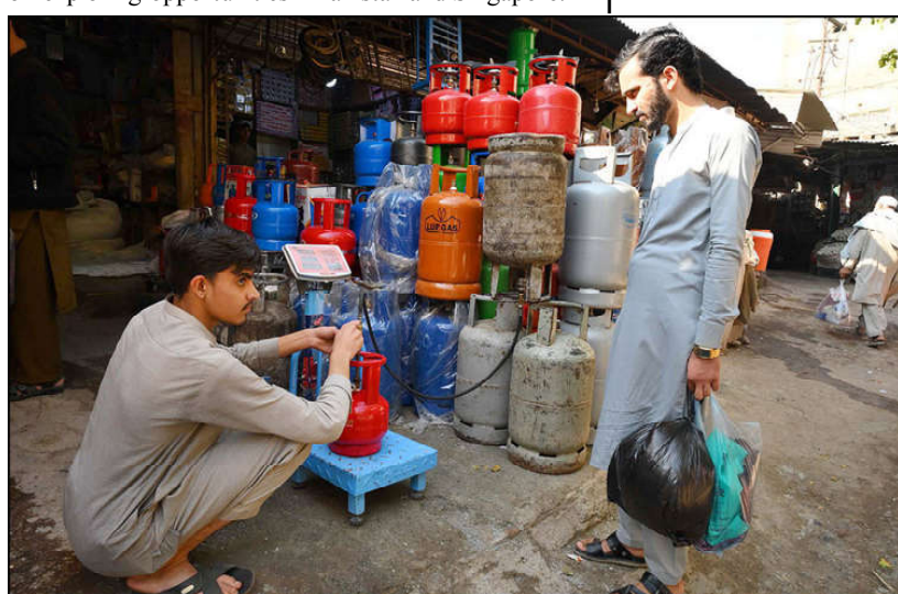
PESHAWAR: Vendor busy in filling LPG gas in to a cylinder for a customers at Ashraf road.