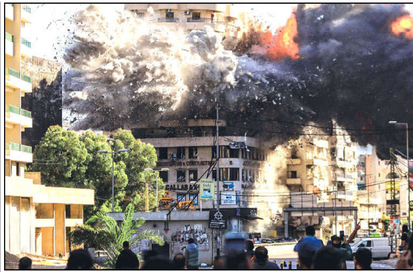
BEIRUT: Fire and smoke erupt from a building seconds after an Israeli air strike in Lebanon's southern Shayah neighbourhood. The 11-storey building housed several apartments, a gymnasium and shops.

assault on north Gaza. The civil defence agency was not immediately able to provide an exact toll. Biden, in a statement responding to the ICC's arrest warrants, called them "outrageous", vowing to "always stand with Israel against threats to its security". China, which like Israel and the United States is not a member of the ICC, urged the court to "uphold an objective and just position". Foreign ministry spokesman Lin Jian said that Beijing "supports any efforts... that are conducive to achieving fairness and justice". The ICC also issued an arrest warrant for Hamas's military chief Mohammed Deif, accusing him of responsibility for war crimes and crimes against humanity over the attack on Israel that sparked the war, as well as "sexual and gender-based violence" against hostages.