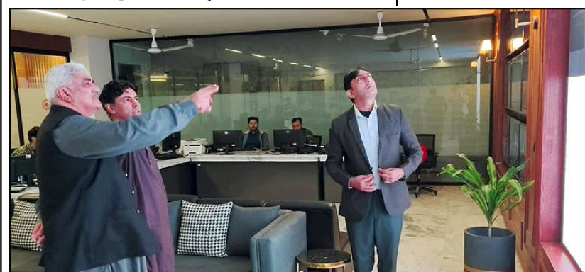
LAHORE: Punjab Minister for Health and Chairman Cabinet Committee for law and order Khawaja Salman Rafique being briefed about security arrangements during his visit to Central Control Room.

among protesters than the safety of his people. They should be ashamed of spewing venom against the very country from which they have been doing business with diamonds. The provincial information minister said, "We cannot leave Islamabad at the mercy of these goons. Maintaining peace and order is the responsibility of both the provinces and the federal government, and we will fulfill this responsibility. Anyone who tries to take the law into their own hands will be treated like the Khawarij." She added that the Islamabad High Court clearly stated that no one would be allowed to disrupt the situation, and they should be given a designated place for protests.