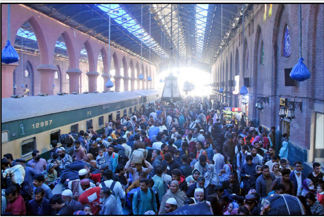
LAHORE: Passengers crowd to board a train at Lahore railway station going to their home towns, passengers travelling on train due to bus station closed in Lahore ahead of PTI protest.