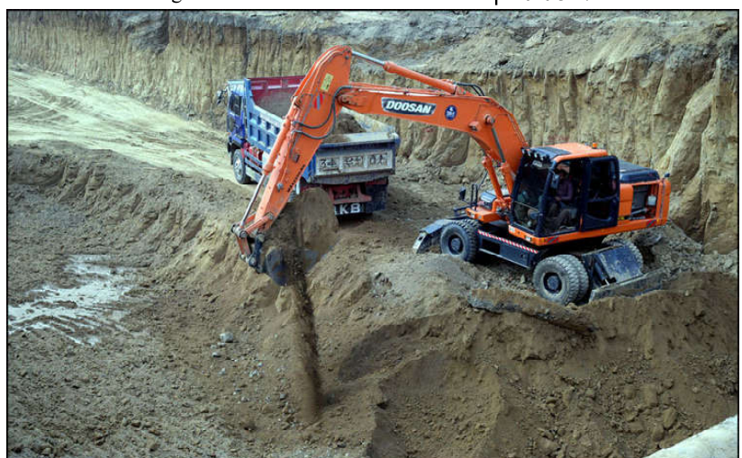
ISLAMABAD: Heavy machinery in action for the construction of 9th Avenue F-9 underpass and flyover project in the Federal Capital.