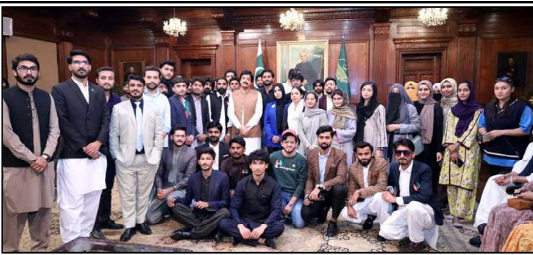
LAHORE: A delegation of Punjab University students in a group photo with Governor Punjab/Chancellor, Sardar Saleem Haider Khan at Governor House.