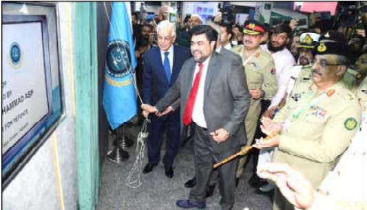
KARACHI: Federal Minister for Defense Khawaja Asif alongwith Governor Sindh Kamran Khan Tessori inaugurating IDEAS 2024 Exhibition at NRTC Pavilion.