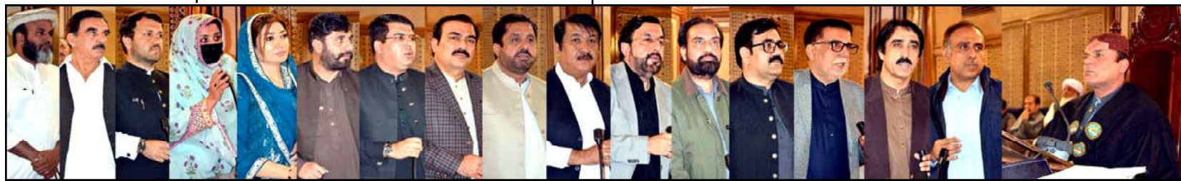
QUETTA: Provincial Ministers and MPAs expressing their views on law and order situation in the Balochistan Assembly.