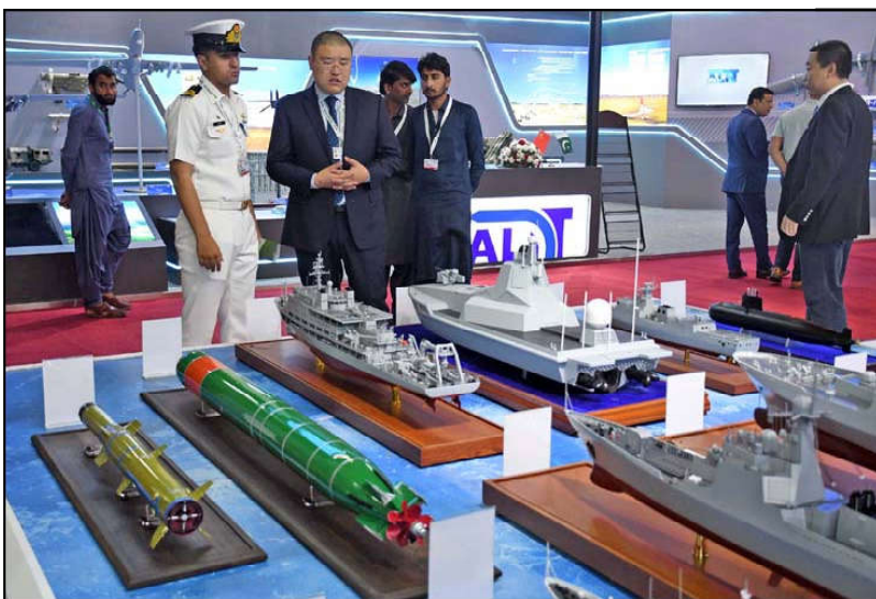
KARACHI: Visitors inspect military armunitions during the International Defence Exhibition and seminar (IDEAS), in the Provincial Capital.

close monitor dialysis centres across the province. The CM expressed strong indignation over the spread of AIDS in Multan and sought a report within 24 hours. She said, "Spreading of AIDS among dialysis patients is not only regrettable but also shameful. Halting dialysis procedure due to non-availability of funds is regrettable and it should continue." It was apprised during the briefing that patients from other provinces are also