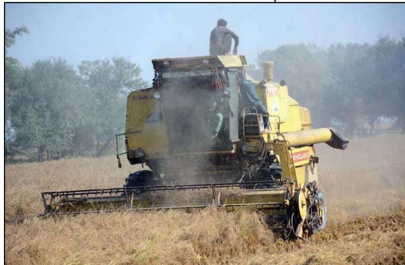
FAISALABAD: Farmers using a harvester machine to harvest rice in the fields on the outskirts of the city.

PTCL employees participating in the TOT program will carry forward the message of safe riding, amplifying the initiative's positive impact. The event concluded with both parties expressing enthusiasm for the potential of this partnership to make roads safer for everyone.