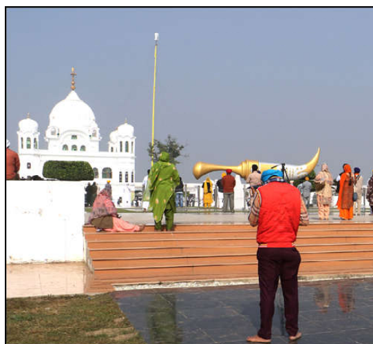
KARTARPUR: Sikh pilgrims pay their respect during celebrations marking the birth anniversary of Guru Nanak, founder of Sikhism, at the Gurdwara Darbar Sahib in Kartarpur near the India-Pakistan border.