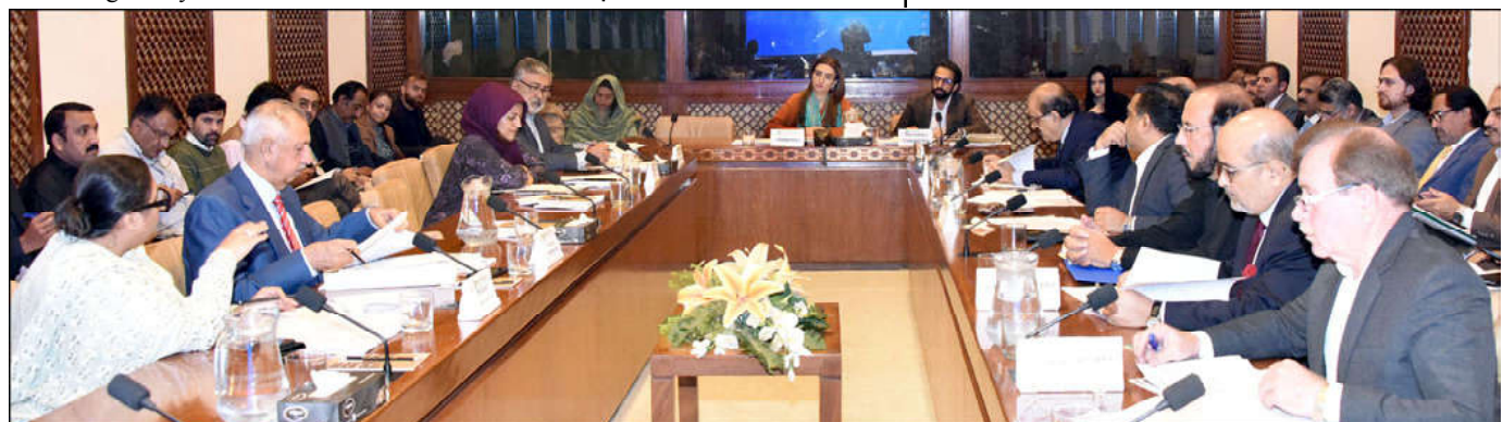
Senator Bushra Anjum Butt, Chairperson Senate Standing Committee on Federal Education and Professional Training presiding over a meeting of the committee at Parliament House Islamabad

The send-off ceremony held at Jinnah International Airport was attended by senior officials of the government and representatives of the Al-Khidmat Foundation.