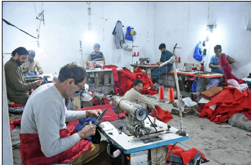
LAHORE: Workers are busy in preparing warm jackets at their workplace due to cold weather, in the Provincial Capital.

The price of per tola and ten gram silver remained constant at Rs.3250 and Rs.2,786 respectively.