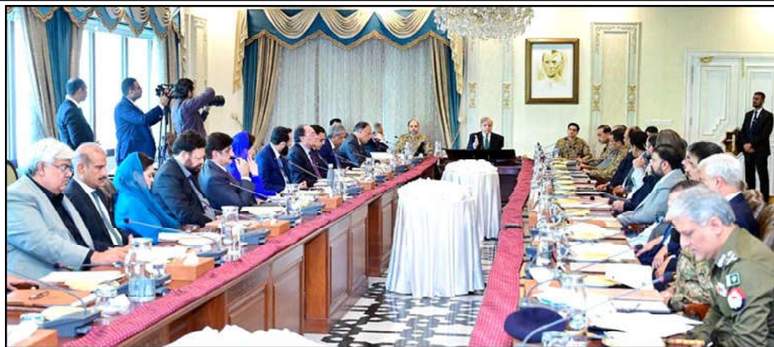
ISLAMABAD: Prime Minister Muhammad Shehbaz Sharif chairs a meeting of Federal Apex Committee of National Action Plan.

A seven members constitutional bench of SC presided over by Justice Amin ud Din took up the case regarding tax on ghee mills for hearing. Justice Jamal Mandokhel remarked he has given decision on the case in Balochistan High Court. I think I should not hear the case.