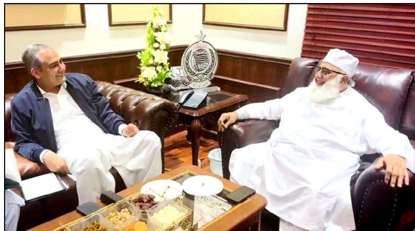
ISLAMABAD: Federal Minister for Interior Mohsin Naqvi in a meeting with JUI Chief Maulana Fazlur Rehman at his residence.