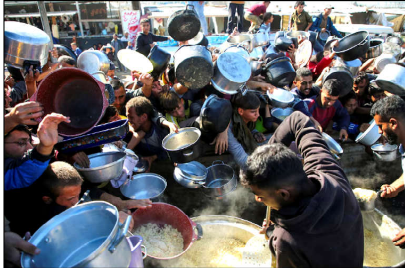
Palstinians gather to receive food cooked by a charity kitchen, amid a hunger crisis, as the Israel-Gaza conflict continues, in Khan Younis in the southern Gaza Strip.

The previous doctrine, set out in a 2020 decree, said Russia may use nuclear weapons in case of a nuclear attack by an enemy or a conventional attack that threatened the existence of the state.