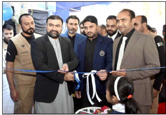
QUETTA: Chief Minister Balochistan Mir Sarfraz Ahmed Bugti inaugurating Sciences and Art Exhibition at Jinnah Elite School.