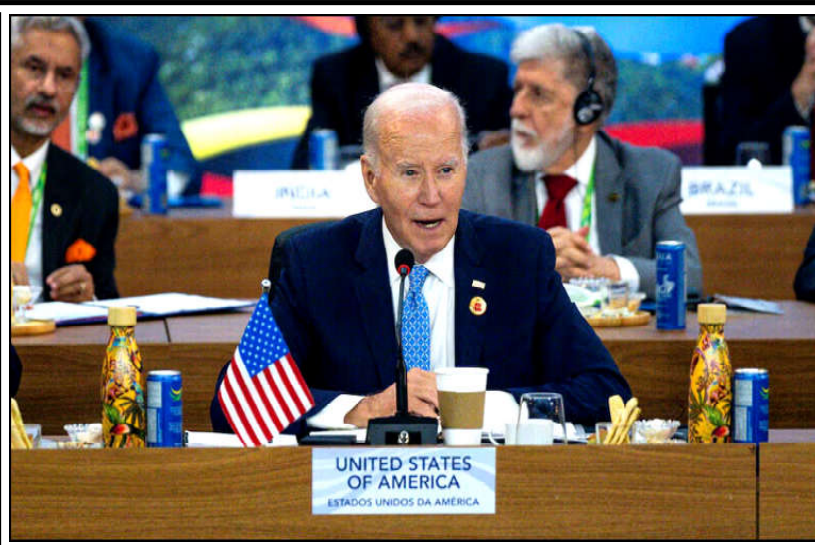
US President Joe Biden delivers remarks during an event launching the Global Alliance Against Hunger and Poverty at the G20 Summit at the Museum of Modern Art in Rio de Janeiro, Brazil.

Ten Kuki militants were killed when they attempted to assault police last week.