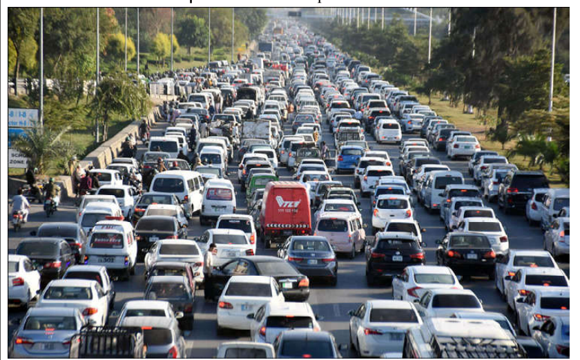
ISLAMABAD: A view of massive traffic jam at Islamabad Highway in day hours, in the Federal Capital.

A detailed briefing was provided to the chairman, confirming that all activities were on schedule.