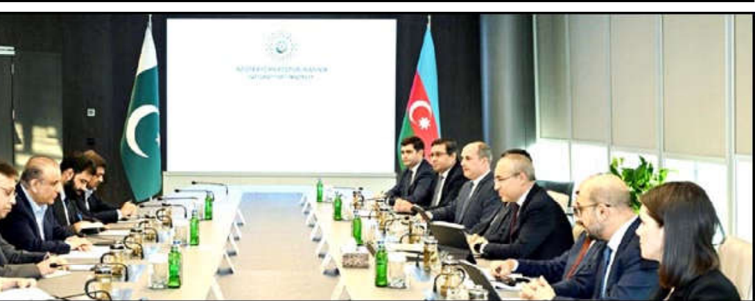
Federal Minister for Investment, Privatisation and Communications, Abdul Aleem Khan held a meeting with Minister for Economy, H.E. Mikayal Jabbaaro in Azerbaijan.