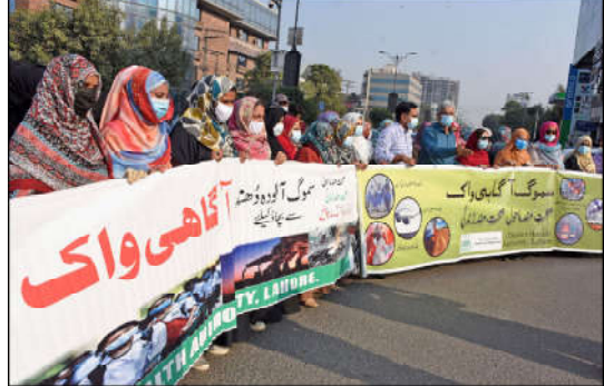
LAHORE: Participants hold a banner during smog awareness campaign walk at Liberty chowk, in the Provincial Capital.