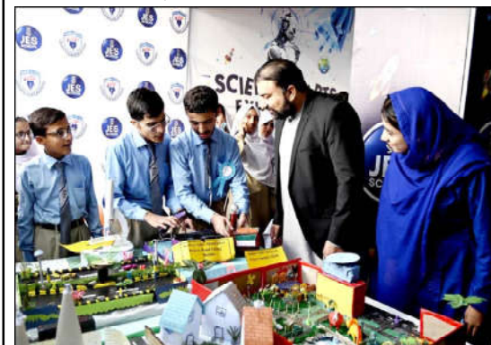
QUETTA: Chief Minister Balochistan Mir Safaraz Ahmed Bugti visiting stalls at Sciences and Art Exhibition in Jinnah Elite School.

Pakistan's 2,500 courts. "The system should provide detailed profiles of all judges, track the status of disposed cases, and include timelines for pending cases to ensure transparency and efficiency," he stated. The Minister recommended the establishment of a comprehensive police information system to integrate all 1,500 police stations in the country. This system would include details of each station's jurisdiction and streamline operations. He underscored the importance of leveraging technology to modernize Pakistan's administrative and service delivery systems. "Technology should expose discrepancies in a way that eliminates human manipulation," he said, citing the Federal Board of Revenue's (FBR) successful implementation of the Iris software as a model for digital automation.