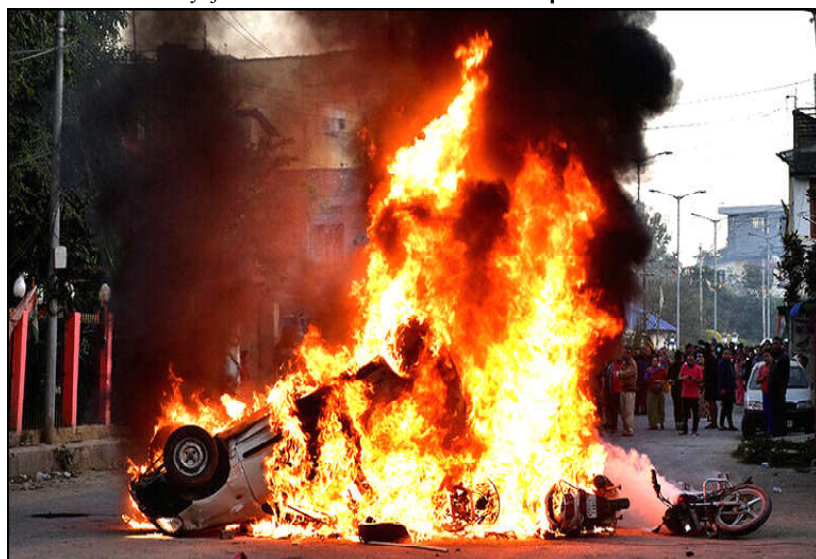
Vehicles burn as demonstrators stand during a protest against the recent killings, in Imphal West, in the northeastern state of Manipur India.