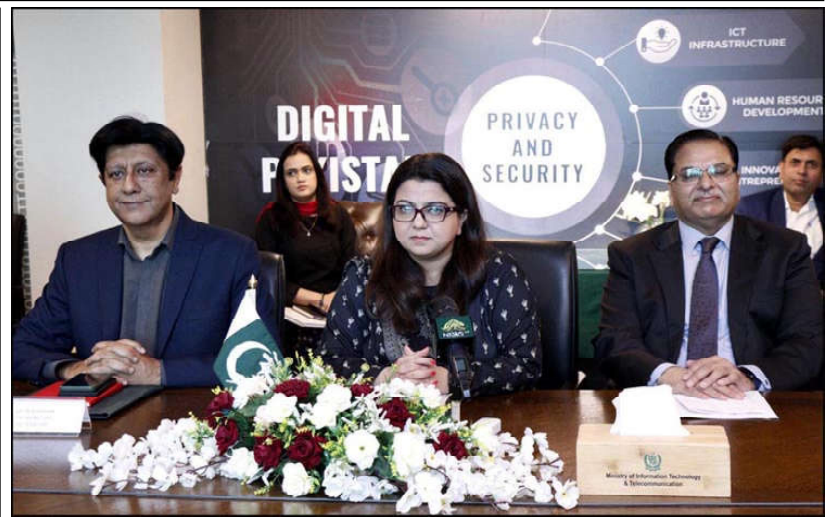
ISLAMABAD: Minister of State for IT and Telecommunication Ms. Shaza Fatima Khawaja addressing launching ceremony of 'Digital Dialogue Pakistan'.

Looking at the overall performance, the minister said Punjab's score stood at 61.39 percent, Khyber Pakhtunkhwa's at 54.47 percent, Sindh's at 51.55 percent and Balochistan's at 45.50 percent.