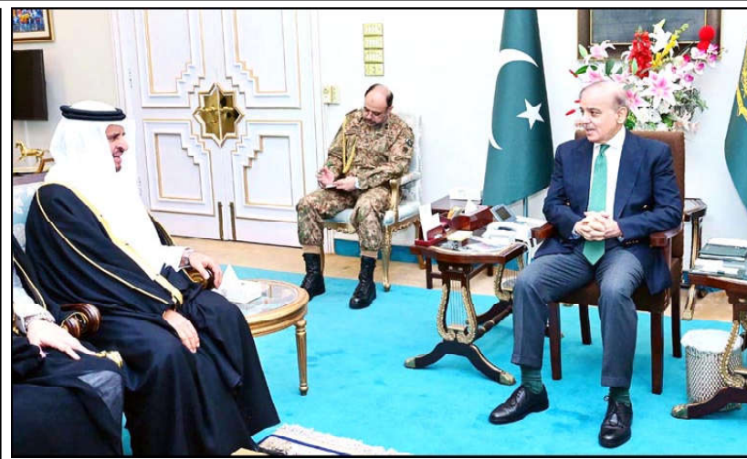
ISLAMABAD: Deputy Interior Minister of Saudi Arabia H.E. Dr. Nasser bin Abdul Aziz Al Dawood calls on Prime Minister Muhammad Shehbaz Sharif.

Prime Minister Shehbaz lauded the leadership role of Saudi Arabia and the efforts of Crown Prince Mohammed bin Salman in unifying the Ummah to collectively seek an end to violence in Gaza due to Israel's genocidal actions. Emphasizing the significance of bilateral cooperation in defence and security sectors, he said that the visit of the Saudi deputy interior minister and his delegation would help bring both sides closer in terms of cooperation in these specific areas. Prime Minister Shehbaz also reiterated his invitation to Crown Prince Mohammed bin Salman to undertake an official visit to Pakistan at his earliest convenience as the people of Pakistan were waiting to accord him a very warm welcome.