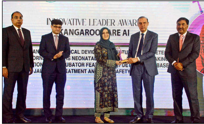
KARACHI: The Governor State Bank of Pakistan Jameel Ahmed distributing awards to women entrepreneurs during an event held to mark Women Entrepreneurship Day at SBP Museum Karachi.

He also instructed the government agencies to take similar actions in steel, cigarettes, cement, beverages and other sectors.