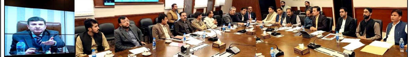
QUETTA: Chief Secretary Balochistan Shakeel Qadir Khan presiding over meeting regarding PSDP 2024-25.

They said that the government has miserably failed to protect the life and property of the common men, as a result of which, they are feeling their insecure. They demanded of the government and other concerned law enforcement agencies to ensure safe recovery of the kidnapped child without any further loss of time.