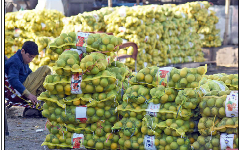
ISLAMABAD: A young vendor is displayed Kinnow attraction for customers at fruit and vegetable market sector I-11, in the Federal Capital.

ISLAMABAD (APP): Pakistan's ICT export remittances have witnessed a remarkable growth of 34.9%, reaching US$ 1,206 billion during the first four months of FY 2024-25 (July to October) said Minister of State for IT and Telecommunication Shaza Fatima Khawaja. In a statement, she said ICT exports were US$ 894 million in the same period last year (FY 2023-24). Shaza Fatima said in October 2024, the remittances from ICT services export amounted to US$ 330 million, a 38.6% increase over US$ 238 million in October 2023. The Minister of State for IT said on the directives of the Prime Minister of Pakistan steps were being taken to increase IT exports. She said the Ministry of IT, the Pakistan Software Export Board (PSEB) and the IT industry were committed to increasing the country's IT exports.