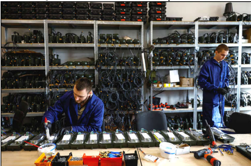
Employees work at a production facility of Unwave company, a Ukrainian producer of jammers and radio electronic warfare, amid Russia's attack on Ukraine, at an undisclosed location, Ukraine.

The Houthis did not immediately claim the attacks. However, it can take the rebels hours or even days to acknowledge their assaults.