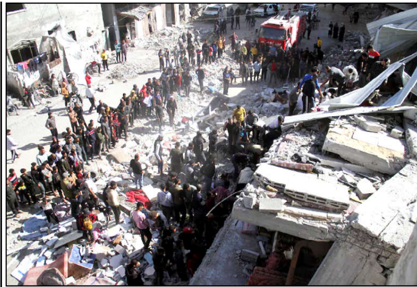
Palestinians, including rescuers, search for casualties at the site of an Israeli strike on a house, in Gaza City.

The scope of the new firing guidelines isn't clear. But the change came after the U.S., South Korea and NATO said recently that North Korean troops are in Russia and apparently are being deployed to help the Russian army drive Ukrainian troops out of Russia's Kursk border region.