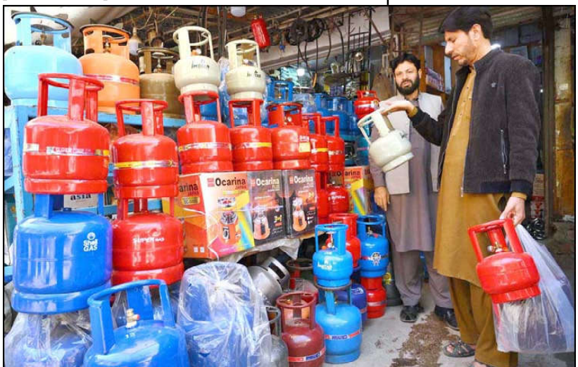
PESHAWAR: Customer selecting and purchasing LPG cylinder from vendor at Firdous area.