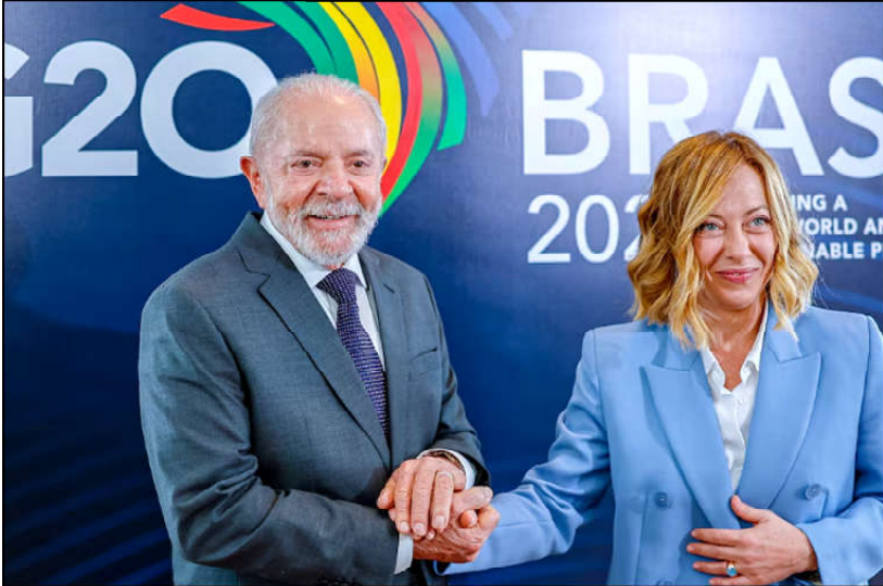
Brazil's President Luiz Inacio Lula da Silva greets Italian Prime Minister Giorgia Meloni, as she arrives ahead of the G20 Summit, in Rio de Janeiro, Brazil.

With London holding the rotating presidency of the council, British foreign minister David Lammy is due to chair a vote on a UK/Sierra Leone-proposed draft resolution, which also calls for the protection of civilians.