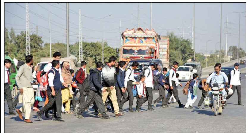
ISLAMABAD: Students cross very busy Karnal Sher Khan Shaheed Road, during heavy traffic, which may cause any incident any time as needs to attention for concern authority, in the Federal Capital.