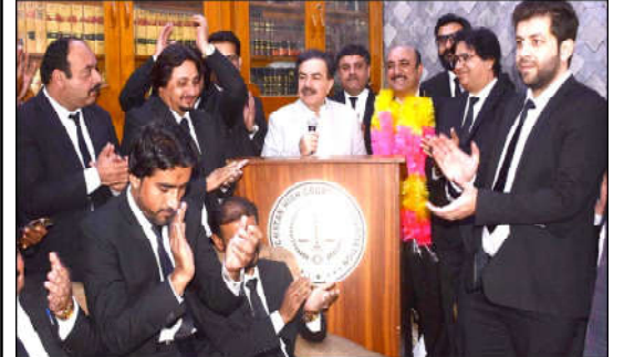
QUETTA: Governor Balochistan Jaffar Khan Mandokhail speaks during a ceremony at High Court Bar.

In a surprising turn, the petitioner admitted not casting his vote in the previous general elections when questioned by Justice Jamal Mandokhail.