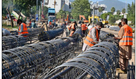
ISLAMABAD: Laborers are busy binding steel at the construction site of an underpass along Khyaban-e-Suharwardi in the Federal Capital as part of ongoing development work.