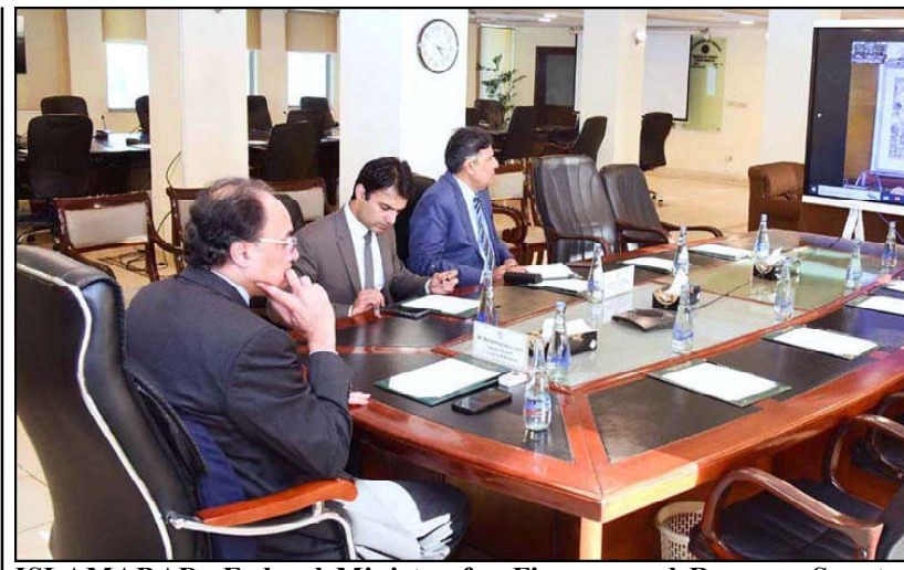
ISLAMABAD: Federal Minister for Finance and Revenue Senator Muhammad Aurangzeb held a virtual meeting with the Governor of the State Bank of Pakistan (SBP), Mr. Jameel Ahmed, and the Chairman of the Pakistan Banks' Association (PBA), Mr. Zafar Masud, along with their teams, to discuss progress on financing for the priority sectors.