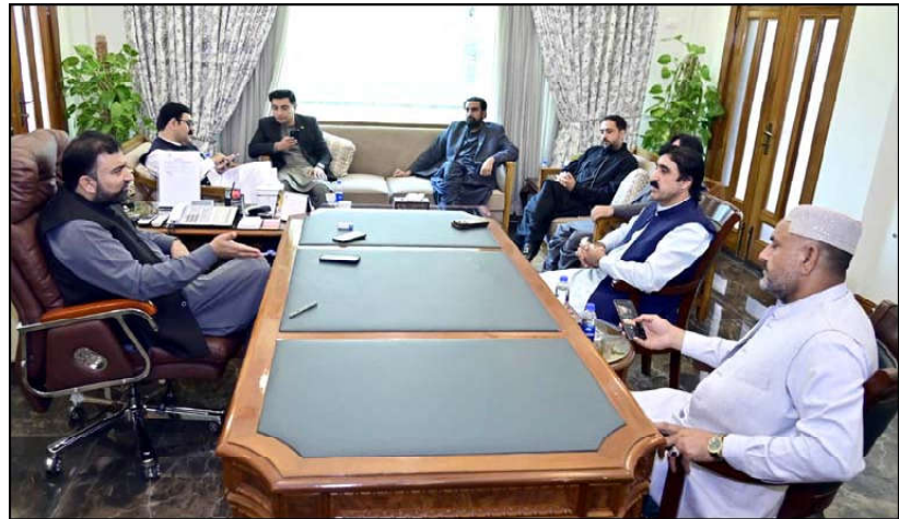
QUETTA: Provincial Ministers and MPAs meeting with Chief Minister Balochistan Mir Sarfaraz Ahmed Bugti.

The prime minister directed for accelerating actions against tax defaulters, and reiterated to bring the tax evaders and their facilitators to book.