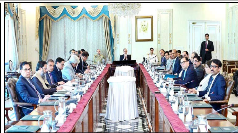
ISLAMABAD: Prime Minister Muhammad Shehbaz Sharif receiving a briefing from the Ministry of Finance regarding the country's economy and the meeting with the IMF delegation.

It was said in the letter that meeting of CCI is must for bolstering cooperation between federal units, resolution of key issues, peace in the country, harmony and socio-economic development of the country.