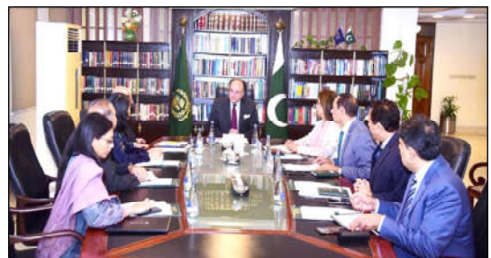
Senator Muhammad Aurrangzeb at the Finance Division on Monday.