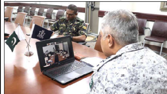
Navy in support of CTF-150 mission to counter illicit maritime activities at sea, said a news release issued by Directorate General Public Relations (Pakistan Navy).

PTA decides to give 2 weeks time for un-registered VPN ISLAMABAD (Online): Pakistan Telecommunication Authority (PTA) has decided to give two weeks time for registration of non registered VPN. According to sources this decision has been taken in review meeting of PTA following the issuance of directives from interior ministry for closure of non registered VPN. Sources said it was decided in the meeting to give time till November 30 for registration of non registered VPN. Later the crackdown will be launched against non registered VPN from December 01. One trial has been completed successfully with reference to closure of VPN. Second trial will be conducted in coming days in this regard. PTA said time is being given to non registered VPN holders for registration ahead of closure. PTA said non registered VPN are security risk. Access can be sought to sensitive data and objectionable material through non registered VPN.