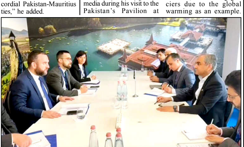
BUDAPEST: Federal Minister for Interior Mohsin Naqvi in a meeting with his counterpart from North Macedonia Panche Toshkovski