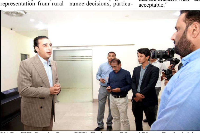
KARACHI: Peoples Party (PPP) Chairman, Bilawal Bhutto Zardari visited various departments including media cell, monitoring room and news section, at Bilawal House in Karachi.