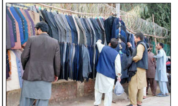
BAHAWALPUR: People buying overcoats from roadside stalls as the temperature rapidly falls in the city.

wheat cultivation target of 16.5 million acres across Punjab has been set and 82 percent of the target has been completed. She added wheat cultivation target will be completed across the province by December 10. She highlighted wheat cultivation on 326,000 acres of government land across Punjab has been set. The CM said 40,000 agriculture graduate interns are available to assist farmers in the field across the province, adding that applications have been invited for free grant of 1,000 green tractors and 1,000 land levelers for wheat farmers under Chief Minister Maryam Nawaz Sharif's scheme.