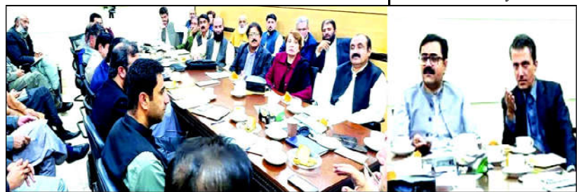
QUETTA: Provincial Minister for Health Bakht Muhammad Kakar presides over the meeting to ensure medicine supply in hospitals. Secretary Health Mubejj-ur-Rehman Panezai is also present.