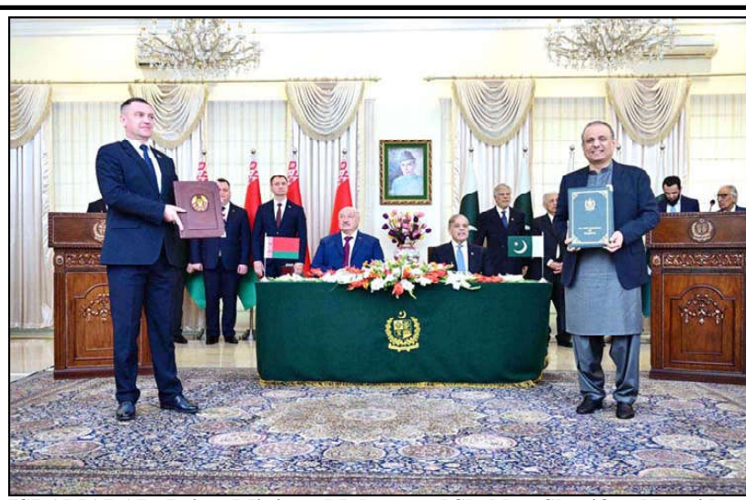
ISLAMABAD: Prime Minister Muhammad Shehbaz Sharif and President of Belarus H.E. Aleksandr Lukashenko witnessing the MoUs and Agreements exchange ceremony held in Prime Minister's House.