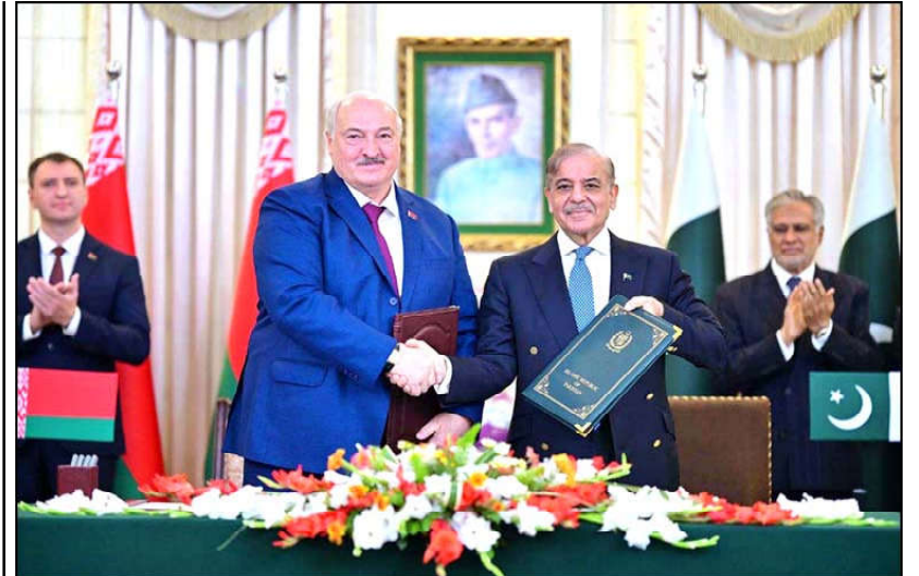
ISLAMABAD: Prime Minister Muhammad Shehbaz Sharif and President of Belarus H.E. Aleksandr Lukashenko exchanging joint communique.