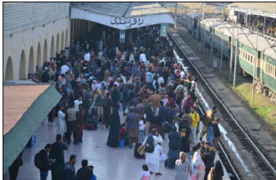
RAWALPINDI: Passengers rush to the railway station due to the closure of transport amid PTI protest.

LAHORE (APP): Seventh edition of the Maritime Security Workshop (MARSEW-7) aimed at enhancing knowledge and understanding of maritime security, geopolitical dynamics in the broader Indian Ocean region and the Blue Economy besides exploring Pakistan's untapped maritime potential commenced on Tuesday at Pakistan Navy War College. The workshop was inaugurated by the Commandant of Pakistan Navy War College, Rear Admiral Azhar Mahmood, said a news release issued by the Directorate General of Public Relations (Pakistan Navy). MARSEW is a national-level forum organized under the auspices of the Pakistan Navy, with the theme "Secure Seas, Prosperous Pakistan." The workshop seeks to highlight the challenges and opportunities in Pakistan's maritime sector and its critical role in supporting the national economy. This forum provides a shared platform for participants from the public and private sectors, including senators, parliamentarians, senior bureaucrats, maritime industry professionals, business leaders, academia, think tanks, and media representatives, to deliberate on pressing national maritime issues. A total of 38 participants from the public, private, and military sectors are taking part in MARSEW-7. In his welcome address, Rear Admiral Azhar Mahmood outlined the purpose of the workshop, emphasizing the need for Pakistan's intelligentsia to shift its strategic focus towards the sea.