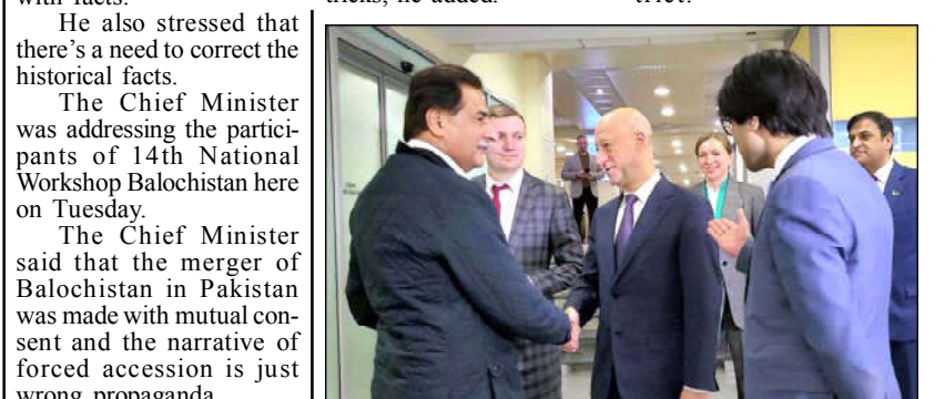
MOSCOW: Speaker National Assembly Sardar Ayaz Sadiq being welcomed at Moscow on his arrival by Vice Chairman of Russian State Duma Mr. Alexander Babakov.

He said that it is just wrong to attribute the operation in limited area as operation in the whole province. He stressed the need to correct the historic facts. Referring the province, Chief Minister said that Balochistan is being pushed towards instability in three ways. While resentment is being spread by killing innocent people through violence, he mentioned adding that hatred is being spread against the State through baseless propaganda on social media. Moreover, social instability is being created through the negative social tricks, he added. He said that measures are being taken to bridge the gulf between State and youth in the province. The Chief Minister also mentioned that implementation has been started on first Youth Policy after its formulation. In addition to this, it has been decided to grant scholarships to the students of Balochistan for Ph.D from 200 prominent universities of the world. Similarly, the Provincial government would bear 16 years' educational expenditures of the topper students from each district.