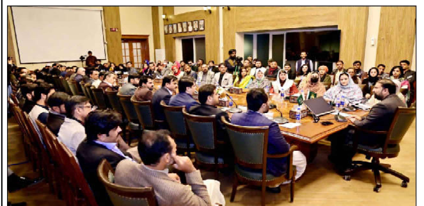
QUETTA: Balochistan Chief Minister Mir Sarfaraz Ahmed Bugti speaking to the participants of 14th National Workshop on Balochistan.

Trade, audit institutions, financial intelligence sharing, vocational education and science & technology. One of the key outcomes of the meeting was the signing of the "Roadmap for Comprehensive Bilateral Cooperation between Pakistan and Belarus for 2025-2027," which outlines a strategic framework for enhancing economic ties through high-level meetings, inter-governmental commissions, and targeted collaborative initiatives. Talking to the media, Prime Minister Shehbaz Sharif referred to the closeness between Pakistan and Belarus and said that in their "productive" bilateral meeting and the delegation-level talks, they discussed the cooperation in multiple sectors including commerce, tourism, defence, food and others. He lauded President Lukashenko's commitment to turning the bilateral understandings into practical agreements and actions.