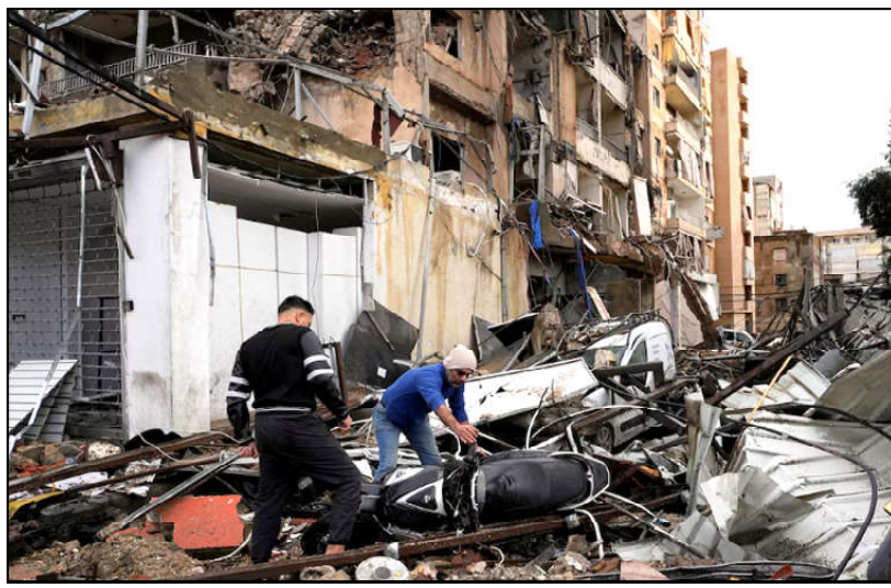
A man moves a scooter amid the rubble, in the aftermath of Israeli strikes on Beirut's southern suburbs, amid the ongoing hostilities between Hezbollah and Israeli forces, in Lebanon.

A statement listed "the casualty toll of Israeli enemy strikes on a number of Lebanese cities and towns" in the east, south and near Beirut, with most people killed in the south and four killed in the east. The NNA also reported "a drone strike that targeted a residential complex" in a Druze-majority town on the outskirts of Beirut, without prior evacuation calls. Lebanon's Druze community follows an offshoot of Shiite Islam, and its heartland around Mount Lebanon has largely been spared in the current hostilities. The education ministry suspended classes on Monday in schools, technical institutes and private higher education institutions in Beirut and a number of surrounding areas, citing "the current dangerous conditions".