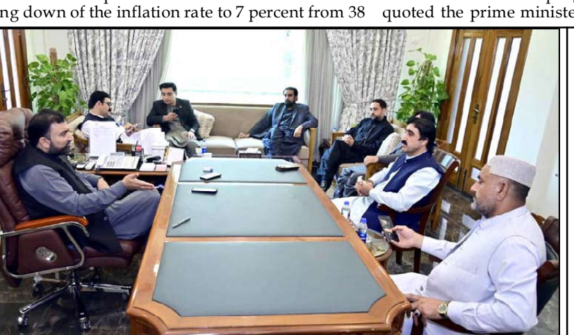
OUETTA: Provincial Ministers and MPAs meeting with Chief Minister Balochistan Mir Sarfaraz Ahmed Bugti.