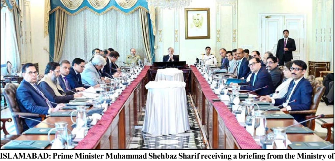
Finance regarding the country's economy and the meeting with the IMF delegation.

They said that the government has miserably failed to protest the life and property of the common men, as a result of which. they are feeling them insecure. They demanded of the government and other concerned law enforcement agencies to ensure safe recovery of the kidnapped child without any further loss of time