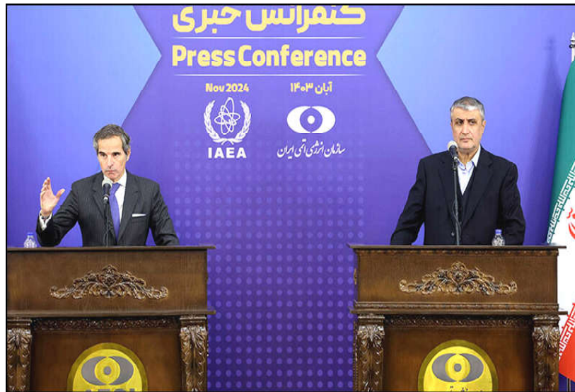
Iran's head of the Atomic Energy Organisation Mohammad Eslami and the United Nations nuclear chief Rafael Grossi hold a joint press conference in Tehran.