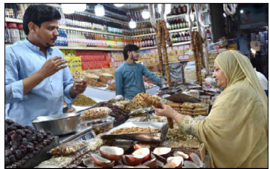
KARACHI: Woman selecting and purchasing dry fruit from ship before selling after change weather in Provincial Capital.

The Director General of FBR (Reforms and Automation) addressed participants, underscoring the need for a track and trace solution for the oil sector akin to systems already implemented in other industries.