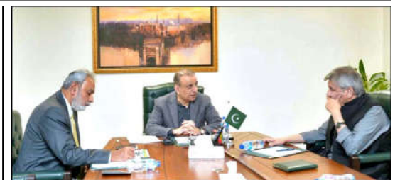
ISLAMABAD: Federal Minister for Communications, Privatisation and Board of Investment Abdul Aaleem Khan presides meeting of NHA.

Pakistani people. Responding to a question, the spokesperson said Pakistan will continue to work with China for the safety and security of Chinese nationals, projects and institutions in the country. She said Pakistan and China have a robust dialogue and cooperation on a range of issues including counter terrorism and security of Chinese nationals. She said this dialogue is based on mutual respect, mutually beneficial cooperation and respect for each other's 'sovereignty. As Iron brothers and strategic partners, the two countries have the resolve and capability to foil any attempts aimed at harming this relationship.