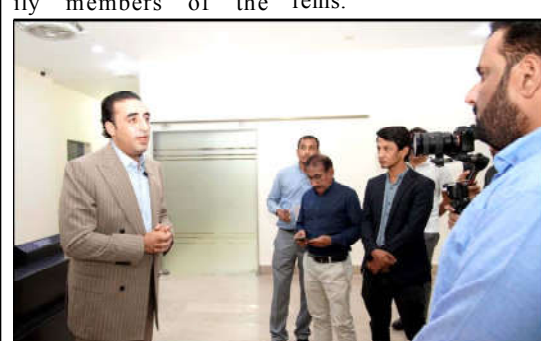
KARACHI: Peoples Party (PPP) Chairman, Bilawal Bhutto Zardari visited various departments including media cell, monitoring room and news section, at Bilawal House in Karachi.