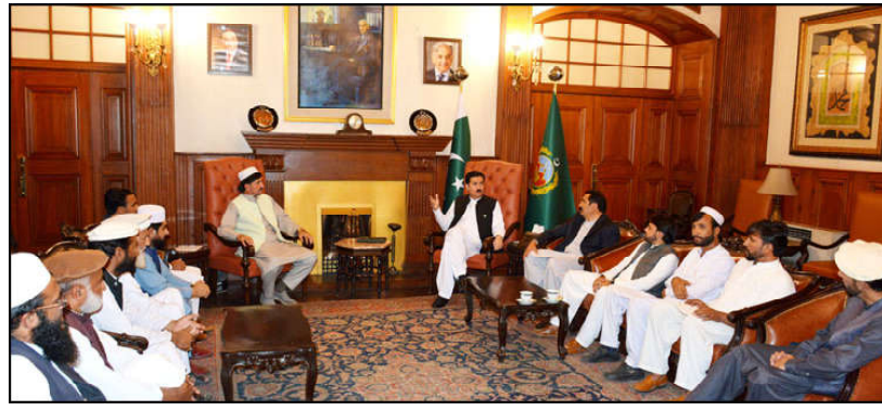
PESHAWAR: Governor Khyber Pakhtunkhwa Faisal Karim Kundi called on by Mamozai Qaumi Ittehad representative delegation at Governor House.