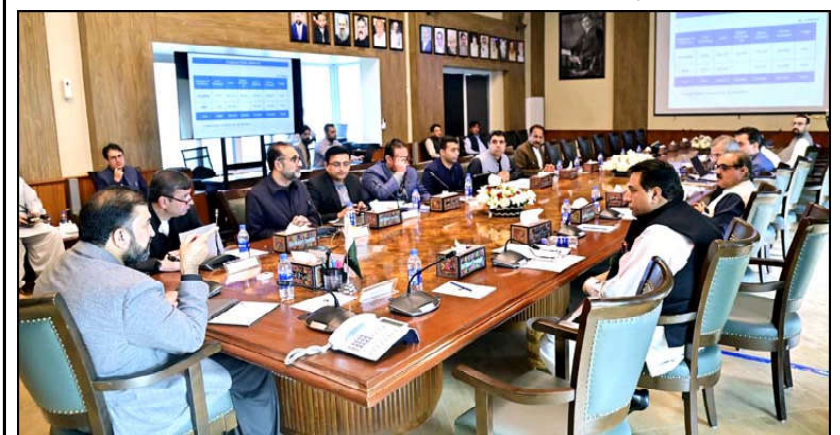
QUETTA: Chief Minister Balochistan Mir Sarfraz Ahmed Bugti presiding over a meeting to review progress on development projects.