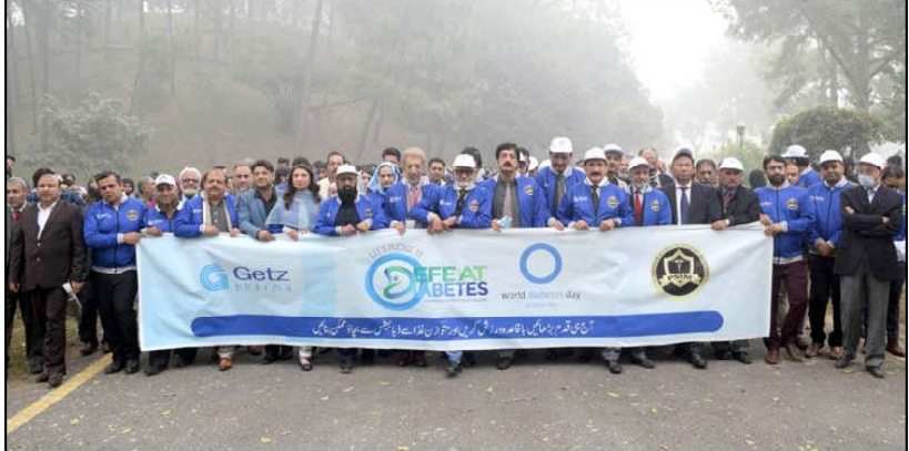
LAHORE: Governor Punjab Sardar Salim Haider Khan participating in a public awareness event organized by the Internal Society of Internal Medicine regarding World Diabetes Day at Governor House Lahore.