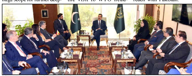
ISLAMABAD: Chairman Senate, Syed Yousaf Raza Gilani exchanging views with members of the Parliamentary delegation of senate affairs committee of the kingdom of Spain at Parliament House.

quarters, and the fruitful discussions on expanding Pakistan access to international markets and strengthening trade relations, which aligned with Pakistan broader economic goals. He emphasized that the EU trade concessions were a milestone, facilitated by support from Spain, which provided significant economic benefits to Pakistan's textile industry. The Chairman Senate also highlighted importance of inter-parliamentary relations in strengthening bilateral ties. He commended the Spanish Senate for prioritizing diplomatic outreach with Pakistan.