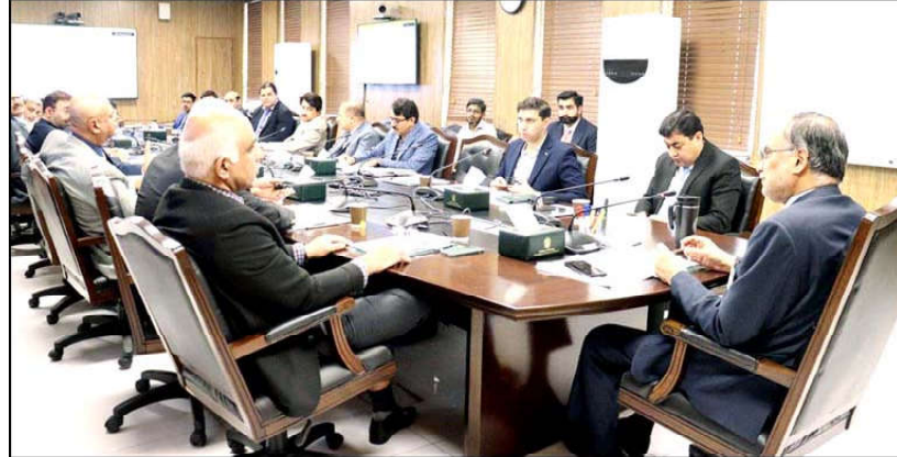
ISLAMABAD: Federal Minister for Planning, Development and Special Initiatives, Ahsan Iqbal chairing a meeting to review the progress and challenges of two major national projects: the Neelum Jhelum Hydropower Project (NJHPP) and the Diamer Bhasha Dam.

project's Head Race Tunnel (HRT) have led to temporary power stoppages. To resolve these issues, an international panel of experts, including a prominent Pakistani geologist, was appointed to identify the causes and suggest solutions. The experts recommended steps to fix blockages and structural damages inside the tunnels. Minister Ahsan Iqbal directed the concerned authorities to expedite repair work and develop a detailed plan based on scientific studies that could be able to justify the costs spent on the projects. He stressed that the remedial work must provide a sustainable solution, ensuring long-term stability and value for the investment. The meeting also focused on the Diamer Bhasha Dam, a key project on the Indus River. This dam will store water for irrigation, help manage floods, and generate 4,500 MW of electricity.