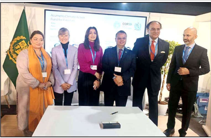
BAKU: Coordinator to the Prime Minister for Climate Change, Romina Khurshid Alam posing for a group photo with federal minister for finance, Muhammad Aurangzeb and representatives of Founder Acumen, Green Climate Fund and USAID in an event on Acumen's Climate Action Fund for Pakistan at Pakistan Pavilion COP29 Summit.