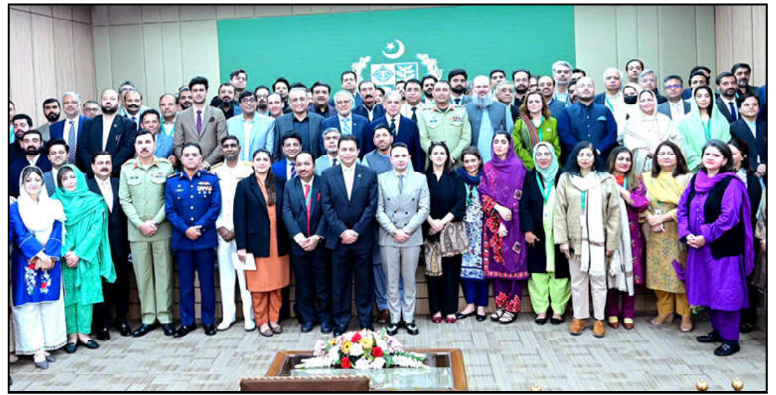
ISLAMABAD: Prime Minister Muhammad Shehbaz Sharif in a group photo with the participants of the 26th National Security Workshop.

cupied Palestinian Territories as a result of Israel's ongoing genocidal military campaign. He highlighted that over the past one-year, Israeli actions, in blatant violation of international humanitarian law, had claimed more than 45,000 Palestinian lives, mostly women and children. He said that millions of Palestinians were being deliberately denied life-saving humanitarian assistance by Israel by obstructing the vital work of the United Nations Relief and Works Agency for Palestine.