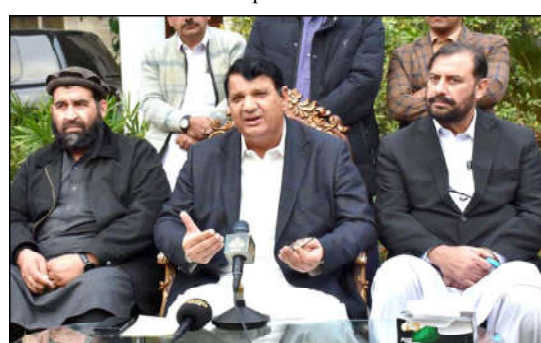
PESHAWAR: Federal Minister for Kashmir Affairs, Gilgit-Baltistan and SAFRON Engr. Amir Muqam addressing a press conference at his residence.