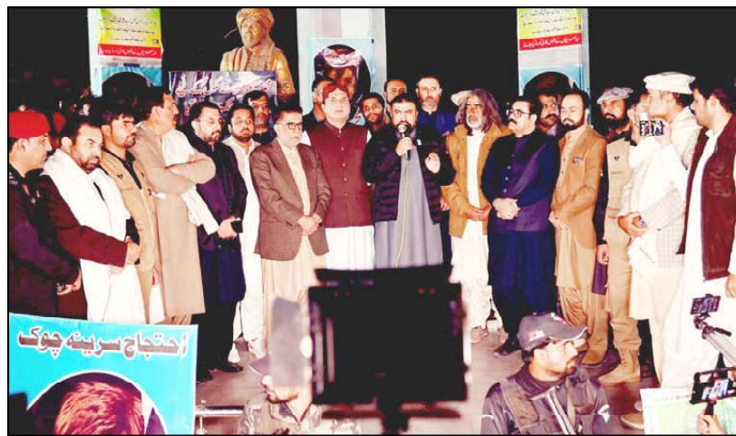
QUETTA: Chief Minister Balochistan Mir Sarfraz Ahmed Bugti addressing protesters to end 12 day sit-in against kidnapping of Musawar Khan Kakar. Speaker Balochistan Assembly, opposition leader, provincial ministers and MPAs are also present.

kidnapped child. The Chief Minister urged them to end their dharna. On standing assurance of the Chief Minister, the dharna was deferred for 10 days. Speaking on the occasion, Chief Minister said that it feels that the kidnapped child is just his own. He said that he is in contact with the family of kidnapped child from the day first. He said that there happens to be no other option except protest in case of such incidents. He said that every one has right of protest in democracy. However, negotiations are the best solution to the issues, he added. He said that the efforts remain continued if the negotiations would not be successful even. Later, the roads were opened following the visit of Chief Minister to dharna point.