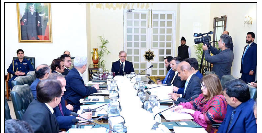
ISLAMABAD: Prime Minister Muhammad Shehbaz Sharif chairs a meeting regarding law and order situation.