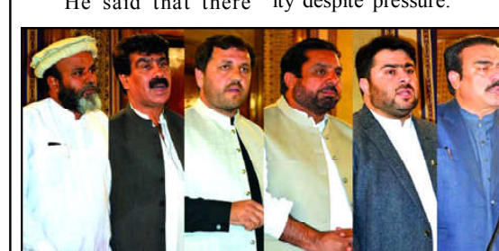
QUETTA: Provincial Ministers and MPs expressing their views on point of order during Balochistan Assembly session

would be marked improvement in the education sector with recruitments to be made on merit. He said that the restoration of merit has been the vision of Chief Minister Balochistan from the day one. He said that the Chief Minister extended wholehearted cooperation to make recruitments of teachers on the basis of merit. The Deputy Pishin Pishin also said that restoration of merit is the topmost priority despite pressure.