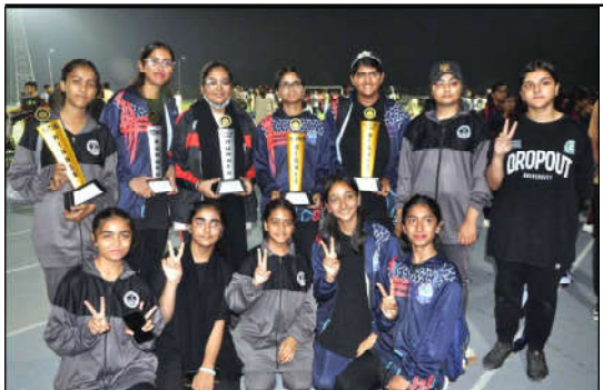
HYDERABAD: Players of winning team are in a group photo during the Iqbal Day Sports Festival held at Public School in Hyderabad.

the unique challenges faced by Khyber Pakhtunkhwa, particularly in terms of security, infrastructure, and economic development. Federal Minister acknowledged the concerns raised by the Governor and assured him of the federal government's commitment to addressing the issues, particularly in regard to enhancing the province's security apparatus and ensuring that Khyber Pakhtunkhwa receives its due share of resources and rights within the federation.