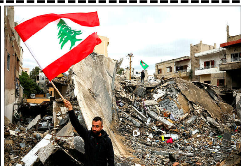
A man waves a Lebanese flag as he stands amidst the rubble of a building destroyed in Israeli strikes in Tyre, Lebanon.

Announcing the Lebanon accord on Tuesday, U.S. President Joe Biden said he would now renew his push for a ceasefire agreement in Gaza, urging Israel and Hamas to seize the moment. Months of efforts to negotiate a ceasefire have yielded scant progress, and negotiations are now on hold. The ceasefire in the parallel conflict between Israel and Hezbollah, an ally of Hamas, took effect before dawn on Wednesday, bringing a halt to hostilities that had escalated sharply in recent months and overshadowed the conflict in Gaza. In Nuseirat, one of Gaza's eight historic refugee camps, Israeli planes carried out several airstrikes, destroying a multi-storey building and hitting roads outside mosques.