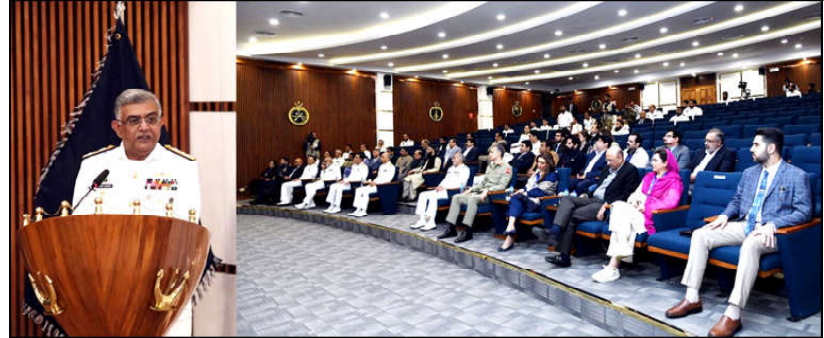
ISLAMABAD: Chief of the Naval Staff Admiral Naveed Ashraf addressing the participants of 7th Maritime Security Workshop (MARSEW-7) during visit to Naval Headquarters.