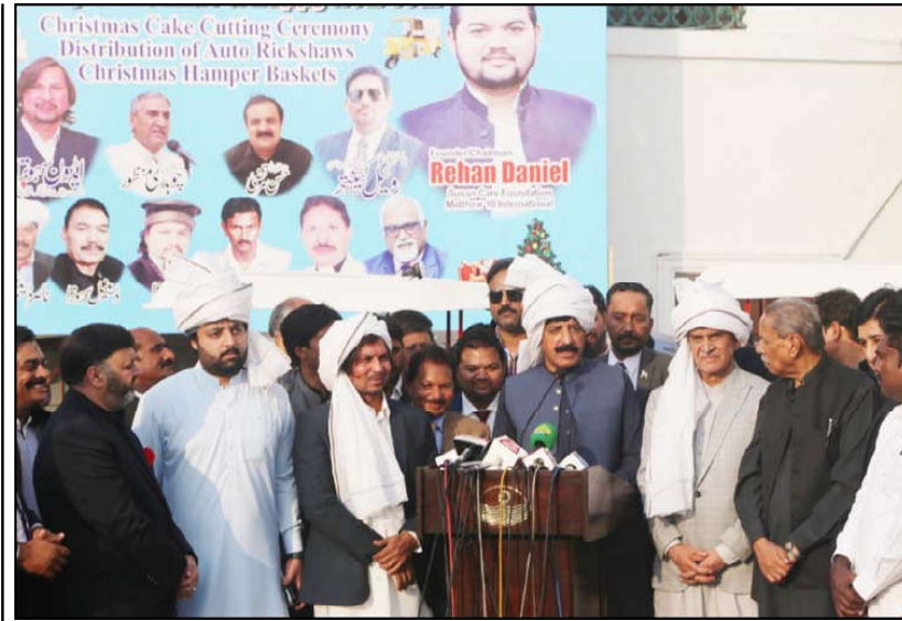
LAHORE: Governor Punjab Sardar Saleem Haider Khan addressing the distribution ceremony of rickshaws at Governor House organized by Lahore Presbytery Church and Vice President of People's Party Minority Wing Central Punjab, Advin Sahotra.

outsourcing of Solid Waste Management Services. More than 21 thousand cleaning machinery and 83,000 cleaning equipment will be provided. Door-to-door waste collection will be carried out from 15 lakh houses of Lahore due to outsourcing of Solid Waste Management. It was further apprised in the meeting that cleanliness will be ensured in 500 markets and 400 villages of Lahore. 540 workers will be hired to ensure cleanliness measures in Lahore. 10 loader rickshaws will be distributed in every union council of Lahore. The Chief Minister directed to maintain equal cleanliness quality measures in every street and town. She asserted.