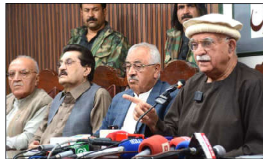
PTI, Imran Khan release. He noted with concern that several persons are missing after the Islamabad's incident and stressed that the solution of the same should be found

Independent Report QUETTA: The Chairman Pashtoonkhan Milli Awami Party (PkMAP) and Head of Tehreek Tahafuz Aayeen-e-Pakistan, Mehmood Khan Achakzai has stressed that judiciary should take suo moto notice of Islamabad incident demanding probe into the alleged killings of workers of Pakistan Tehreek-e-Insaf (PTI) during its protest in Islamabad. He also demanded of the Prime Minister Muhammad Shahbaz Sharif to get the founder of