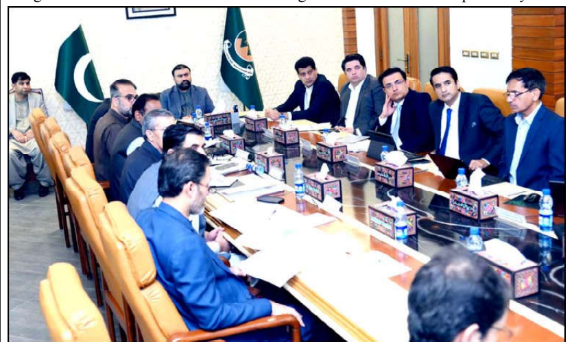
QUETTA: Chief Minister Balochistan Mir Sarfraz Ahmed Bugti presiding over a review meeting regarding Quetta Development Projects.

Facilitating the audience over strong performance of Pakistan Stock Exchange that crossed 100,000 points on Thursday, the prime minister said this was the result of team effort and close coordination among the federal government and various stakeholders. "This is also about business sentiments and we believe that Pakistan is slowly and steadily moving towards right direction." He said the day before yesterday the stock market witnessed a steep fall of around 4000 points due to what happened in Islamabad, however he said as the situation became normal, the market rebounded in next couple of days.