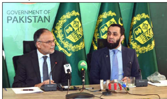
Mr. Attaullah Tarar, Federal Minister for Information & Broadcasting briefing the representatives of International media along with Mr. Ahsan Iqbal, Federal Minister for planning & development in Islamabad.

ISLAMABAD (INP): The Oil and Gas Regulatory Authority (OGRA) has recommended increasing the prices of petrol and diesel by Rs 3 and Rs 2.87 per litre, respectively. According to sources well placed in OGRA, if approved, the price of petrol will rise from Rs 248.38 to Rs 251.38 per litre, while high-speed diesel will increase from Rs 255.14 to Rs 258.01 per litre. The sources said that the proposal also includes a minor reduction of Rs 0.11 per litre for kerosene oil and Rs 0.04 per litre for light-speed diesel. The final decision on these adjustments will be made on November 30, with global crude oil price fluctuations being a key factor influencing the move.