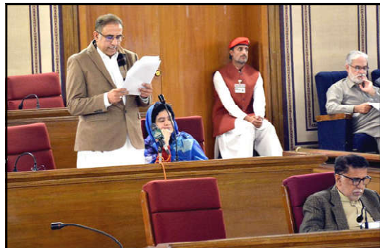
QUETTA: Provincial Minister Mir Saleem Ahmed Khosa presenting joint resolution in Balochistan Assembly.

minister stated that a list circulating on social media regarding the death of protesters was declared fake. The minister said that the federal capital was besieged for the past several days by the miscreants belonging to a political party and this was not the first time they had done so. Attaullah Tarar said that the PTI activists wanted to disrupt peace in Islamabad. He said that the Belarusian President and his delegation was present in the red zone when the PTI protesters besieged the capital. The minister said that the miscreants had modern weapons, tear gas shells, stones and slingshots with them and they were targeting the law enforcement agencies personnel. He informed the foreign media that Islamabad High Court had ordered that there would be no protest of any kind but they openly violated the court orders.