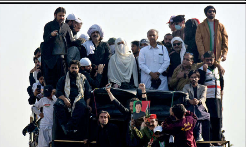
Bushra Bibi, wife of jailed former prime minister Imran Khan, and PTI supporters attend a rally demanding his release, in Islamabad.

"Pakistan cannot afford any chaos and bloodshed for achieving vested political purposes. These acts of violence are unacceptable and highly condemnable which are bordering the limits of restraint by the Law Enforcement Agencies. The entire nation pays homage to the martyred Rangers soldiers and all those police officers who have embraced shahadat."