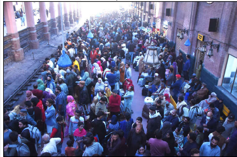
LAHORE: Passengers rush to the railway station due to closure of motorway and ring road in the provincial capital.