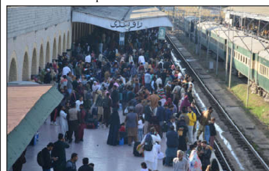
RAWALPINDI: Passengers rush to the railway station due to the closure of transport amid PTI protest.