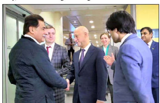
MOSCOW: Speaker National Assembly Sardar Ayaz Sadiq being welcomed at Moscow on his arrival by Vice Chairman of Russian State Duma Mr. Alexander Babakov.

He said that the unbalanced development is the issue of whole country.