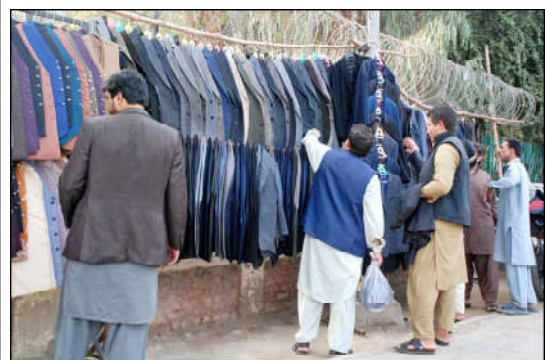
BAHAWALPUR: People buying overcoats from roadside stalls as the temperature rapidly falls in the city

LAHORE (APP): Punjab Chief Minister Maryam Nawaz Sharif has said that for the first time, there is an abundance of fertilizer in Punjab in the Rabi season, and prices have also come down. Chairing a special meeting on agriculture here on Tuesday, she said 30 percent more stock of DAP fertilizer is available in Punjab, and 17 percent reduction in its price during the wheat season has been observed for the first time. The CM said that 125 percent more stock of urea fertilizer than required is available, and 25 percent reduction in its price has been observed in the province. She said that the