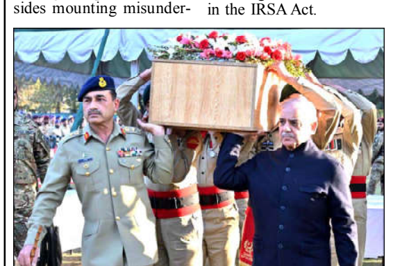
RAWALPINDI: Prime Minister Muhammad Shehbaz Sharif and COAS General Asim Munir attend the funeral procession of the martyred Rangers officials.

Pakistan has consistently been asking the Interim Afghan Government to ensure effective border management on their side of the border. The interim Afghan Government is expected to fulfil its obligations and deny the use of Afghan soil by Khwarij for perpetuating acts of terrorism against Pakistan, it further said.