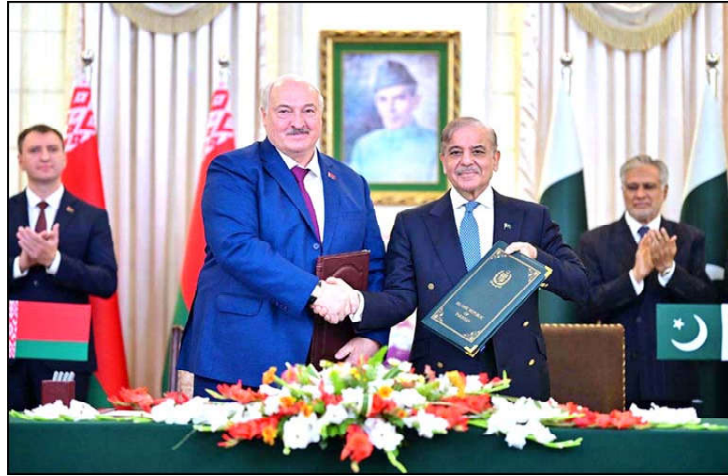
ISLAMABAD: Prime Minister Muhammad Shehbaz Sharif and President of Belarus H.E. Aleksandr Lukashenko exchanging joint communiqué.

Ph: 2841470/2841473 Vol: XX No. 128, Jamaadi ul Awwal 24, 1446 AH Wednesday November 27, 2024, Pages 04, Price Rs.15