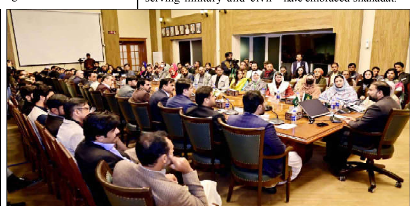
QUETTA: Balochistan Chief Minister Mir Sarfraz Ahmed Bugti speaking to the participants of 14th National Workshop on Balochistan.

Khan accused the authorities of violence against protesters, claiming that police and Rangers forces, under the direction of interim Punjab Chief Minister Mohsin Naqvi, fired upon PTI workers and used tear gas, resulting in injuries. He demanded accountability for the actions taken against the demonstrators.