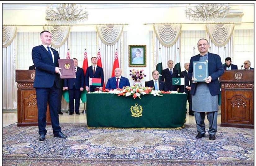
ISLAMABAD: Prime Minister Muhammad Shehbaz Sharif and President of Belarus H.E. Aleksandr Lukashenko witnessing the MoUs and Agreements exchange ceremony held in Prime Minister's House.