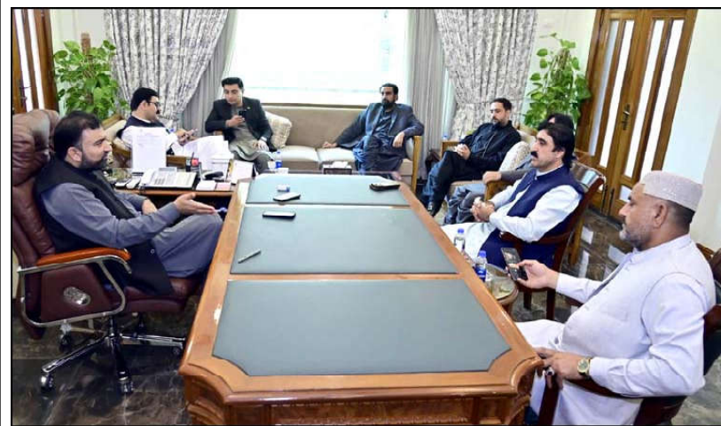
QUETTA: Provincial Ministers and MPs meeting with Chief Minister Balochistan Mir Sarfraz Ahmed Bugti.