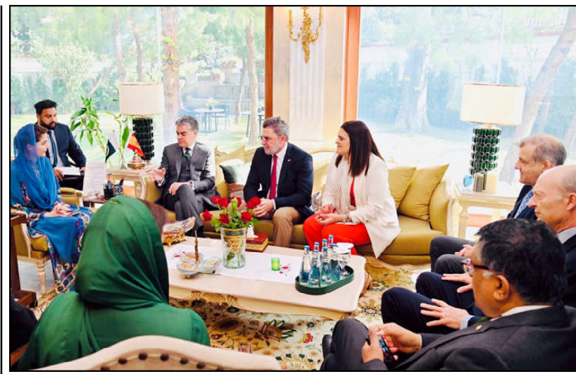
LAHORE: The Spanish Parliamentary delegation meeting with Punjab Chief Minister Maryam Nawaz Sharif.