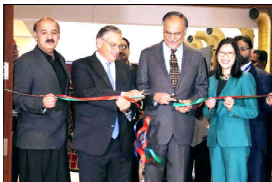
ISLAMABAD (APP): Minister for Planning, Development and Special Initiatives Professor Ahsan Iqbal on Monday highlighted the importance of addressing global challenges such as climate change, energy sustainability and food security while discussing future cooperation between Pakistan and the United States. Addressing an event organized by USAID to mark the longstanding US infrastructure development support to Pakistan, he called for collaborative research in renewable energy, sustainable agriculture, and modern infrastructure to build a more resilient future. He also stressed the need for engaging the vibrant Pakistani diaspora in the United States to strengthen cultural, academic and economic ties between the two countries, a news release said.