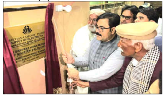
QUETTA: Provincial Health Minister Bakht Muhammad Kakar inaugurating provision of electricity project in Christian Colony, Nawab Killi.

As a result of which, the QRF recovered the abducted female and arrested two accused in the case, taking speedy action on directives of the Deputy Commissioner, Chaman.