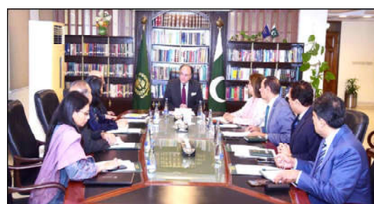
Senator Muhammad Aurangzeb at the Finance Division on Monday.