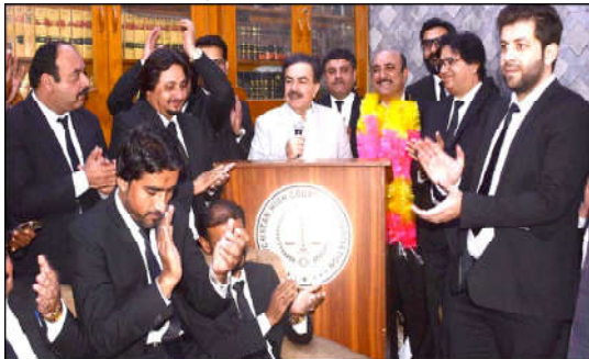
QUETTA: Governor Balochistan Jafar Khan Mandokhail speaks during a ceremony at High Court Bar.