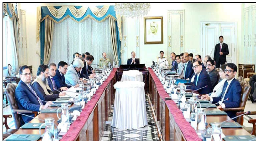
ISLAMABAD: Prime Minister Muhammad Shehbaz Sharif receiving a briefing from the Ministry of Finance regarding the country's economy and meeting with the IMF delegation.