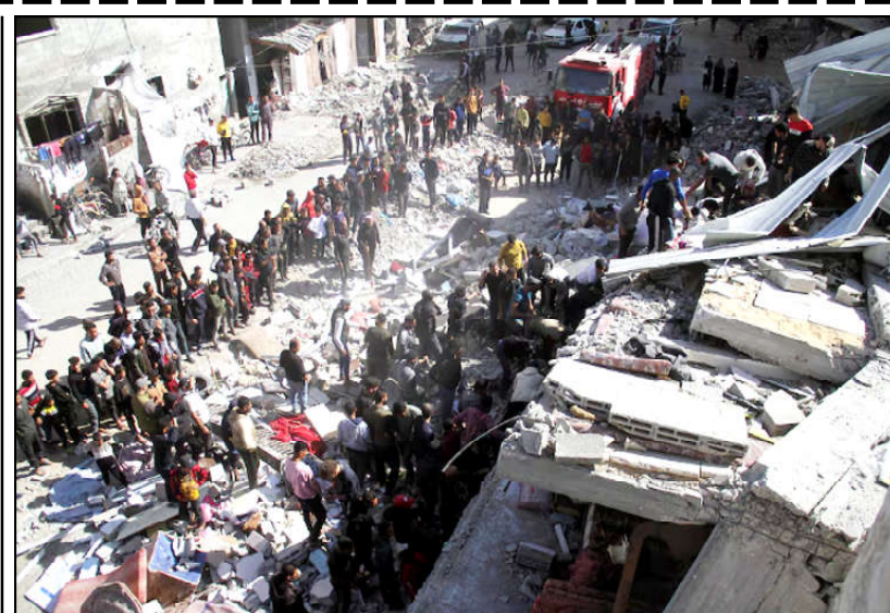
Palestinians, including rescuers, search for casualties at the site of an Israeli strike on a house, in Gaza City.

Monitoring Desk KYIV: President Joe Biden's decision to let Ukraine strike targets inside Russia with U.S.-supplied long-range missiles was met with ominous warnings from Moscow, a hint of menace from Kyiv and nods of approval from some Western allies. Biden's shift in policy added an uncertain but potentially crucial new factor to the war on the eve of its 1,000-day milestone. News of Biden's change came on the day a Russian ballistic missile with cluster munitions struck a residential area of Sumy, a city in northern Ukraine, killing 11 people, including two children, and injuring 84 others. On Monday, another Russian missile attack started fires in two apartment blocks in Odesa, in southern Ukraine. At least eight people were killed and 18 were injured, including a child, regional Gov. Oleh Kiper said. Washington is easing limits on what Ukraine can strike with U.S.-made weaponry, U.S. officials told The Associated Press on Sunday, after months of ruling out such a move over fears of escalating the conflict and bringing about a direct confrontation between Russia and NATO. The scope of the new firing guidelines isn't clear. But the change came after the U.S., South Korea and NATO said recently that North Korean troops are in Russia and apparently are being deployed to help the Russian army drive Ukrainian troops out of Russia's Kursk border region.