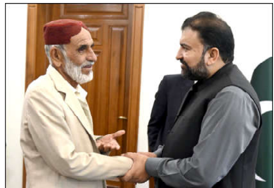
ISLAMABAD (APP): Deputy Prime Minister and Foreign Minister Mohammad Ishaq Dar on Monday chaired the fifth Session of the Exploration & Production Committee constituted by the Prime Minister to develop a comprehensive action plan for addressing the challenges faced by the Exploration and Production (E&P) sector in Pakistan.

In another significant move, the committee decided to initiate a bidding round for available onshore exploration blocks by December 2024. The deadline for bid submissions is set for March 15, 2025. In parallel, a separate bidding process will be launched for offshore exploration blocks, with a six-month period allowed for potential bidders to evaluate the offered blocks and make their bids by 30th of June 2024.