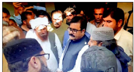
Provincial Health Minister Bakht Muhammad Kakar listening problems of people during his visit to Civil Hospital Zhub.

"Following this amendment, legislation has been rushed that violates human rights," he said. According to Rehman, these laws permit authorities to detain anyone for up to 90 days without due process.