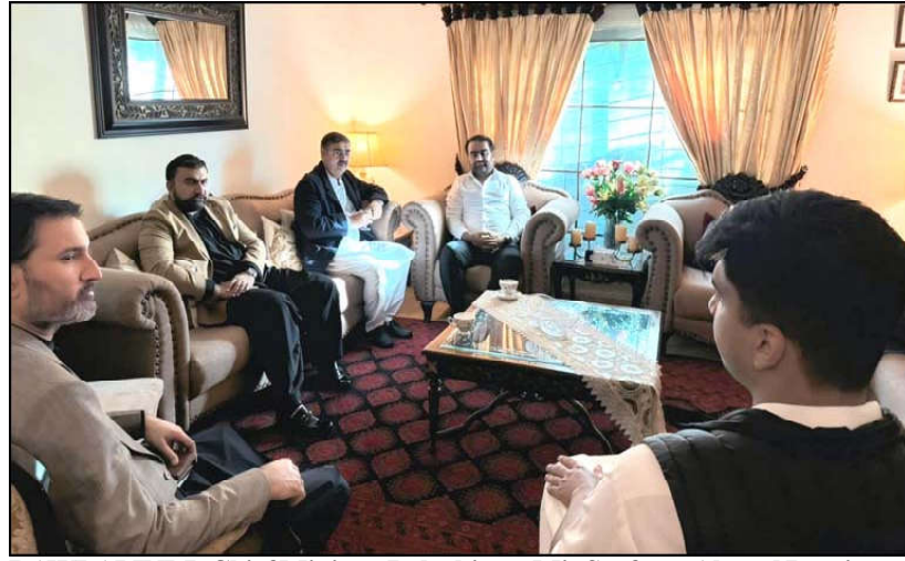
RAWLAPINDE: Chief Minister Balochistan Mir Sarfaraz Ahmed Bugti condoling with relatives of Shaheed Major Haseeb. Former Chief Minister Anwarul Haq Kakar is also present.