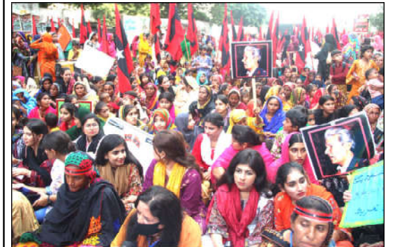
KARACHI: Participants of the protest rally under Awami Tehreek Ladies Wing are raising slogans for their demands at the Karachi Press Club.

Azma Bokhari said that the IMF agreed that the Punjab government had a surplus of approximately Rs 40 billion at the end of the 1 st quarter and as such the Ministry of Finance, government of Pakistan corrected its data and uploaded revised fiscal operations reflecting the Punjab government's surplus. "Lastly, the news item also misreports that Punjab fell short of its surplus target of Rs. 150 billion at the end of the 1 st quarter.