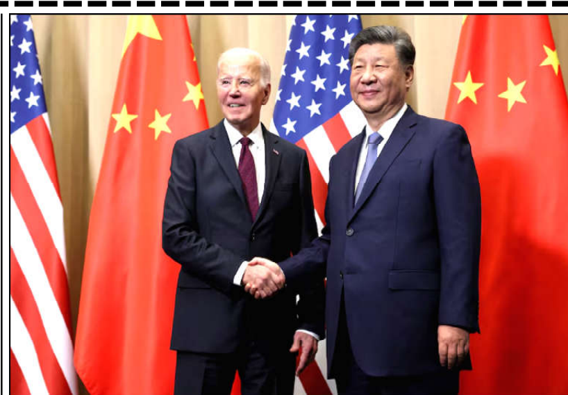
U.S. President Joe Biden meets with China's President Xi Jinping on the sidelines of the APEC Summit in Lima, Peru.