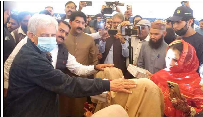
MUREEDKAY: Federal Minister for Industries and Production Rana Tanveer Hussain expressing solidarity with brides during mass wedding ceremony of needy families.

Meanwhile, the governor also paid a visit to the house of late PPP worker Muhammad Akhtar at Paharpur and sympathized with the bereaved family members.