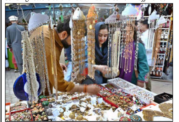
ISLAMABAD: Visitors taking keen interest in artificial jewelry on stall during the 10-Day Folk Festival (Lok Mela) 2024 at Lok Virsa in the Federal Capital.

According to a press release issued here on Sunday, HCSTSI President further stated that the HCSTSI had actively highlighted this issue during the last Hajj season by sending letters to the fed-