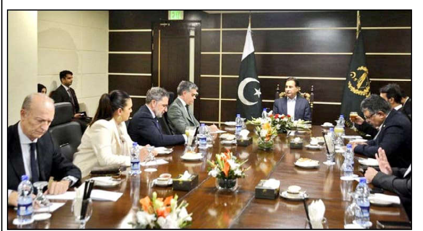
ISLAMABAD: Spanish Senate parliamentary delegation meeting with National Assembly Speaker Sardar Ayaz Sadiq.

Governor Mandokhail urged law enforcement agencies to ensure the safety of citizens' lives and property. He offered prayers for the martyrs from the security forces who lost their lives in the attack and extended his condolences and solidarity to their families. He stated, "We will not allow the peace and order of our region to be disrupted under any circumstances. The sacrifices of our brave security personnel will not go in vain." The Governor's remarks reaffirmed the commitment to combating terrorism and ensuring the protection of Balochistan's people against such cowardly acts.