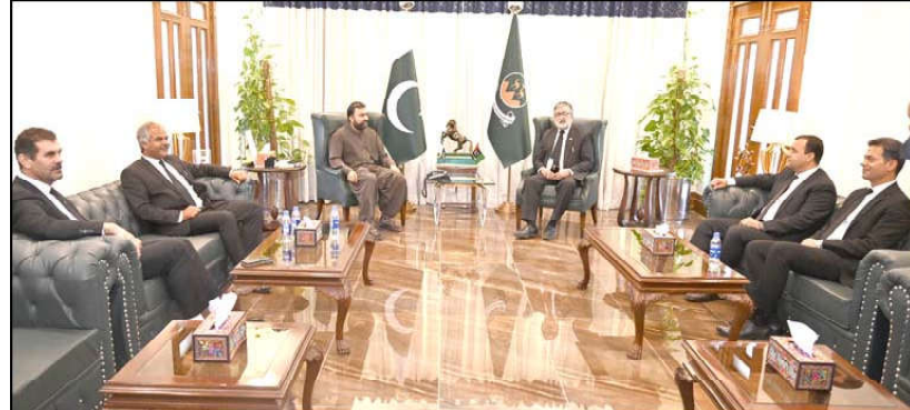
QUETTA: A delegation of lawyers led by Senator Kamran Murtaza Advocate meeting with Chief Minister Balochistan Mir Sarfaraz Ahmed Bugti.