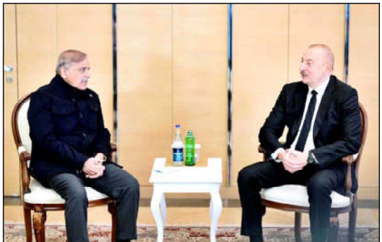
BAKU: Prime Minister Muhammad Shehbaz Sharif meets President of Azerbaijan Ilham Aliyev on the sidelines of COP29 Climate Action Summit.