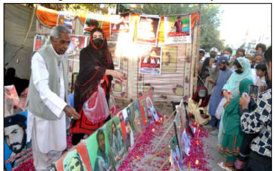
QUETTA: Participants are enlightened candles to pay homage in the memory of Baloch Martyrs on the occasion of Baloch Martyrs Day organized by Voice for Baloch Missing Persons, in Quetta.

According to documents from the Ministry of Petroleum, providing LNG to domestic consumers will require an investment of Rs163 billion. Sources said that the imported LNG is increasing pressure on pipelines on a daily basis.