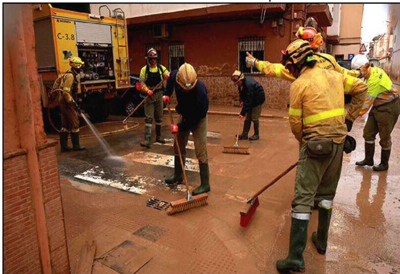
Firefighters clean a drainage system blocked by mud following catastrophic flooding, as Spain braces for torrential rain in Paiporta, Valencia.

LONDON: The Church of England faced pressure on Wednesday to ensure people are held to account for systematically covering up allegations of abuse, one day after the Archbishop of Canterbury resigned over a church abuse scandal. Justin Welby quit on Tuesday as spiritual leader of the global Anglican Church, saying he had failed to ensure a proper investigation into allegations of abuse by a volunteer at Christian summer camps decades ago.