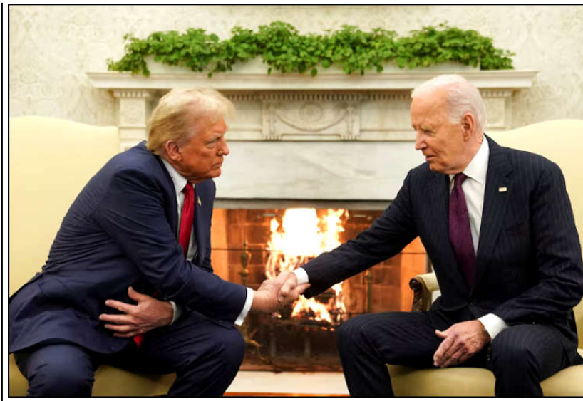
U.S. President Joe Biden meets with President-elect Donald Trump in the Oval Office at the White House in Washington, U.S.

Speaking on Wednesday, U.S. Secretary of State Antony Blinken said Israel "has accomplished the goals that it set for itself" by taking out Hamas' leadership and ensuring the group is unable to launch another massive attack.