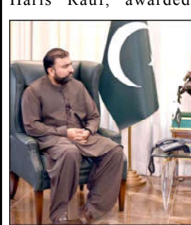
QUETTA: Deputy Chairman Senate Syedal Khan Nasser meeting with Chief Minister Balochistan Mir Sarfaraz Ahmed Bugti.

Previously, Afridi had held the top position during the ICC Men's Cricket World Cup 2023 in India. His fellow bowler, Haris Rauf, awarded