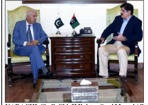
KARACHI: Sindh Chief Minister, Syed Murad Ali Shah exchanges views with Federal Minister for Maritime Affairs, Qaiser Ahmed Sheikh during meeting held at CM House in Karachi.