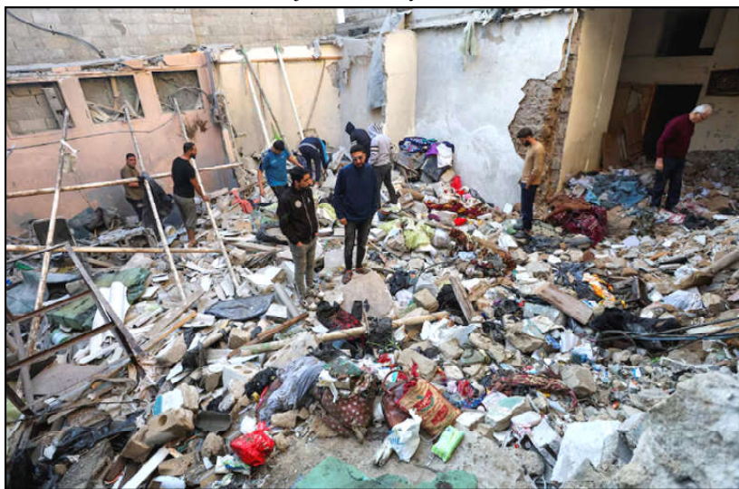
Palestinians inspect the site of an Israeli strike on a house in Nuseirat in the central Gaza Strip.

Multiple eruptions from the 1,703-metre twin-peaked volcano in recent weeks have killed nine people, with 31 injured and more than 11,000 evacuated, Indonesia's disaster mitigation agency said on Tuesday. Eruptions can pose serious risks to flights, disgorging fine ash that can damage jet engines and scour a plane's windshield to the point of invisibility.