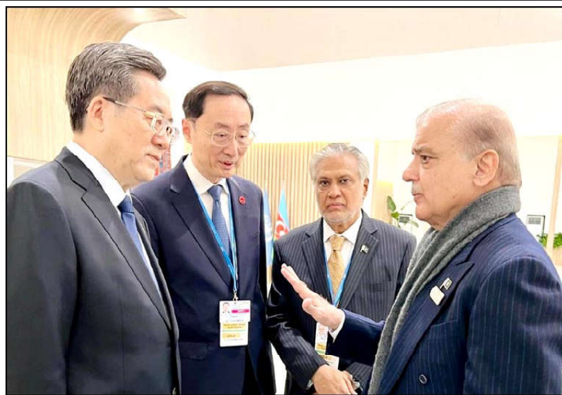
BAKU: Prime Minister Muhammad Shehbaz Sharif met Chinese Vice Premier Ding Xuexiang, on the sidelines of COP29 Climate Action Summit in Baku.