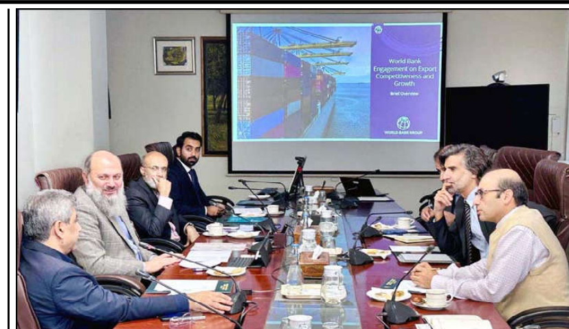
ISLAMABAD: Federal Minister for Commerce, Jam Kamal Khan meets with the World Bank team to discuss strategies for boosting Pakistan's export competitiveness and strengthening trade policies, emphasizing a Whole-of-Government approach for export-led growth.