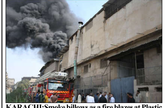
KARACHI: Smoke billows as a fire blazes at Plastic Factory site area Ghani Chowranghi in Karachi.