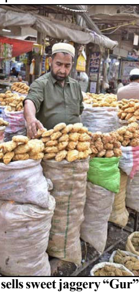
SARGODHA: A trader sells sweet jaggery "Gur", an alternative to sugar, at the Gurr Market.

The price of Euro decreased by 84 paise to close at Rs 294.60 against the last day's closing of Rs 295.44, according to the State Bank of Pakistan (SBP). The Japanese yen came down by 01 paise remained and closed at Rs 1.79, whereas a decline of Rs 2.15 was witnessed in the exchange rate of the British Pound, which traded at Rs 353.85 as compared to the last day's closing of Rs 356.00.