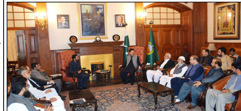
PESHAWAR: Governor Khyber Pakhtunkhwa Faisal Karim Kundi called on by representative delegation of Kohat Chamber of Commerce & Industry at Governor House.

and the Investors group indicated to make investment of US $ 50 million in the EV (electric vehicles) and other sectors in the province. Provincial Minister apprised the delegation that 18 Special Economic Zones (SEZs) have been established in Punjab while seven more SEZs projects are in the pipeline.