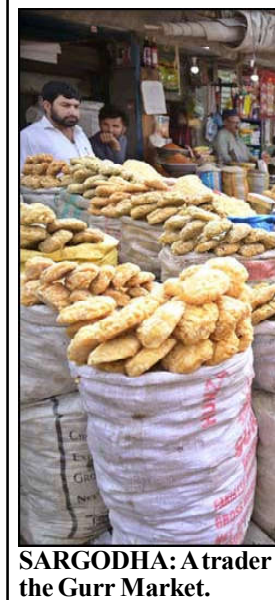
SARGODHA: A trader sells sweet jaggery "Gur", an alternative to sugar, at the Gurr Market.