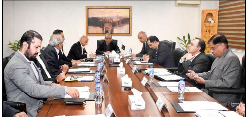
ISLAMABAD: Federal Minister for Privatisation, Investment and Communication Abdul Aleem Khan chairing 227th meeting of Privatisation Commission Board.

sector's development. Pakistan's olive sector is poised to significant growth, with Rana Tanveer outlining ambitious plans to transform the country into a major player in the global market. The Al Baraka Pakistan Olive Summit 2024 brought together key national and international experts, policymakers, and industry leaders to advance Pakistan's olive industry. Under the theme "Developing a Safe, Sustainable & Ready-to-Export Supply Chain of the Olive Sector," the summit emphasized Pakistan's potential to emerge as a significant player in the global olive market.