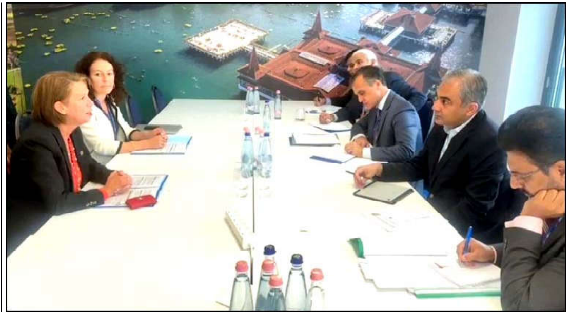
BUDAPEST: Federal Minister for Interior, Mohsin Naqvi exchanging views with Christine Schraner, Swiss Migration Minister during meeting held in Budapest.