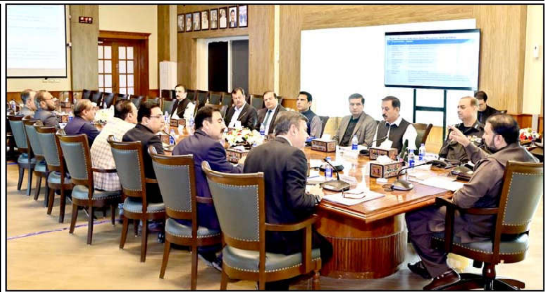
QUETTA: Chief Minister Balochistan Mir Sarfaraz Ahmed Bugti presiding over a high level meeting regarding Provincial Action Plan.

According to an official notification issued here by Services and General Administration Department on Wednesday, the general relaxation has been granted to the fresh candidates and serving government servants in the upper age limits with effect from June 24, 2024 to June 23, 2025.