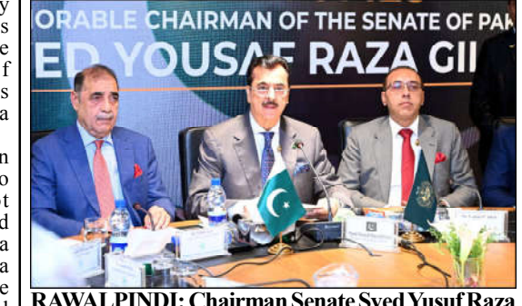
RAWALPINDI: Chairman Senate Syed Yousaf Raza Gilani addressing a function held at the Chamber of Commerce.