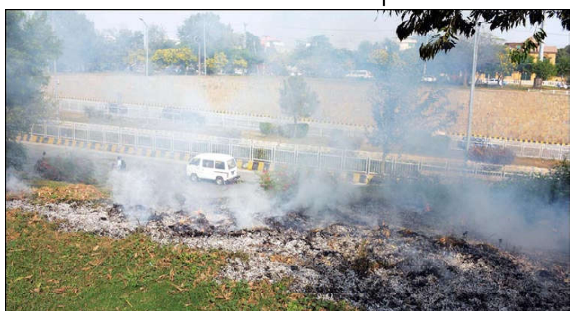
ISLAMABAD: The twin cities and most parts of Punjab are shrouded in heavy smog. According to IQ Air, citizens of Islamabad are required to wear masks and a decision has been made to reduce traffic on the roads. While leaf fires are being set near Sectors I-9 and I-8, the emission of these hazardous substances and smoke is increasing the smog.