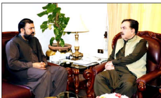
QUETTA: Chief Minister Balochistan Mir Sarfaraz Ahmed Bugti meeting with Governor Sheikh Jaffar Khan Mandokhail.

The president and prime minister lauded the bravery and professionalism of the security forces for killing four terrorists including a high value target in the operation.