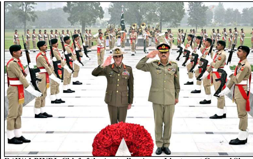
RAWALPINDI: Chief of the Australian Army, Lieutenant General Simon Stuart laid a floral wreath at the Yadgar-e-Shuhada, at General Headquarters (GHQ) in Rawalpindi. Chief of Army Staff (COAS), General Syed Asim Munir is also present.

ing deadly events like the recent floods in Pakistan, India, Nepal and Spain far worse. An overarching aim at this year's global climate meeting is agreeing on how to get more cash to poorer countries to help them curb their planet-warming gases and to help them cope with the worsening impacts of climate change. During her conversation with journalists, Romina Khurshid Alam called upon the world leaders to meet their pledges for climate finance for the developing countries. "Here in Baku, we, however, must reach an agreement on a new global climate finance goal to save the planet earth from devastating impacts of climate change.