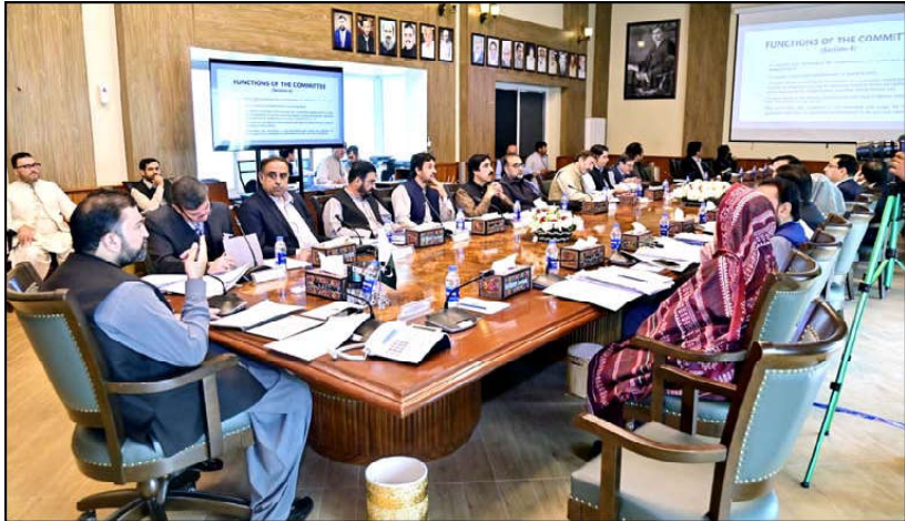
QUETTA: Chief Minister Balochistan Mir Sarfaraz Ahmed Bugti presiding over meeting of Provincial Cabinet.

Ph: 2841470/2841473 REG: No. BC-116 B/ID-445 Vt XXVI No 82, Jamaadi ul Awwal 09, 1446 AH Tuesday November 12, 2024 Pages 08, Price Rs.15