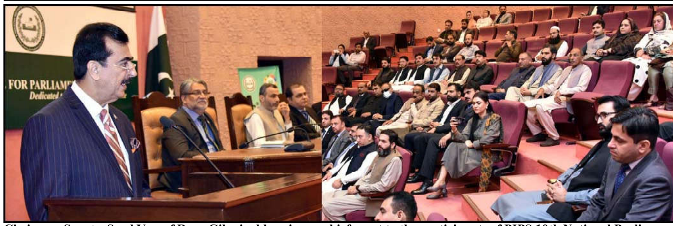
Chairman Senate, Syed Yousaf Raza Gilani addressing as chief guest to the participants of PIPS 10th National Parliament Development Course-2024 at Pakistan Institute for Parliament Services (PIPS), Islamabad.