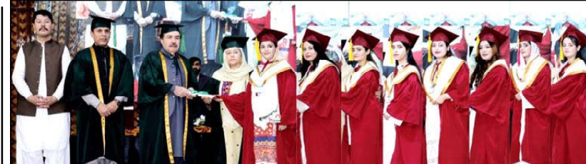
QUETTA: Governor Balochistan Sheikh Jaffar Khan Mandokhail distributing certificates among students during 1st Convocation of Govt. Girls Degree College Quarry Road Quetta.

"Are we unconstitutional until the constitutional bench is established?" he asked, adding that this means constitutional cases would not be heard until the constitutional bench comes into force. He further remarked that even if this regular bench heard the case, nobody could question it. Even if the regular bench decided the case, who could stop it, he asked further.