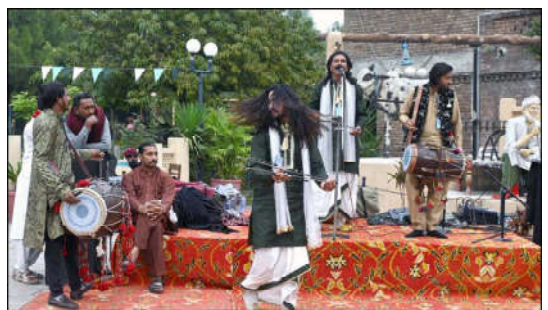
ISLAMABAD: Artists performing on stage during ten days of Folk Festival Lok Mela at Lok Vira in the Federal Capital.