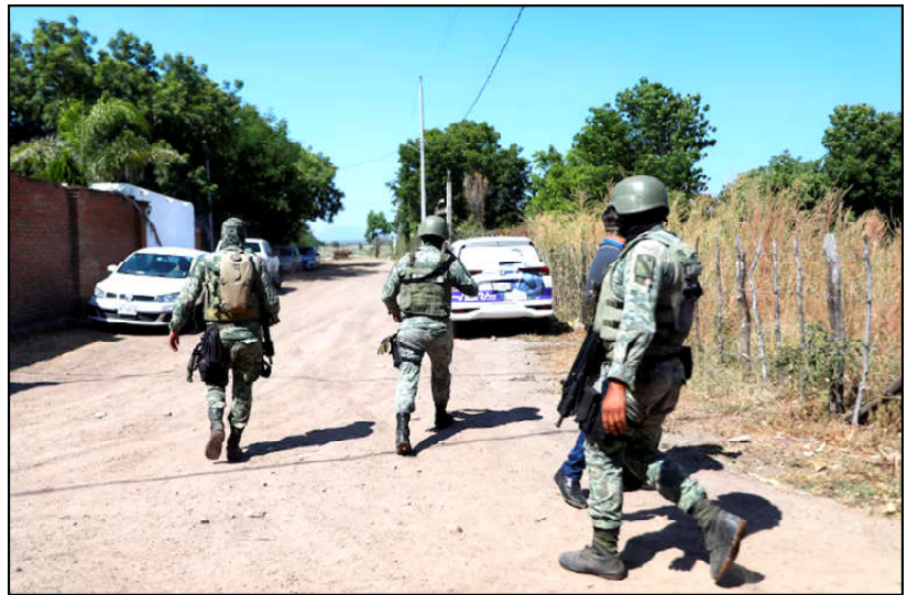
Federal forces guard the perimeter of a scene following a shootout where several suspected gang members were killed while one local cartel leader was arrested, on the outskirts of Culiacan, Sinaloa state, Mexico.

His ACT New Zealand party won 8.6% of the vote in last year's election and argues non-Indigenous citizens are disadvantaged by policies designed to uplift Maori, who are over-represented in many measures of social and financial disadvantage.