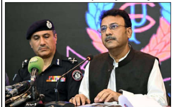
KARACHI: Sindh Home Minister, Zia-ul-Hassan Lanjar along with Sindh Inspector General of Police (IGP), Ghulam Nabi Memon addresses to media persons during press.

The Punjab minister stated that the PTI was divided, with each faction pursuing its own agenda.