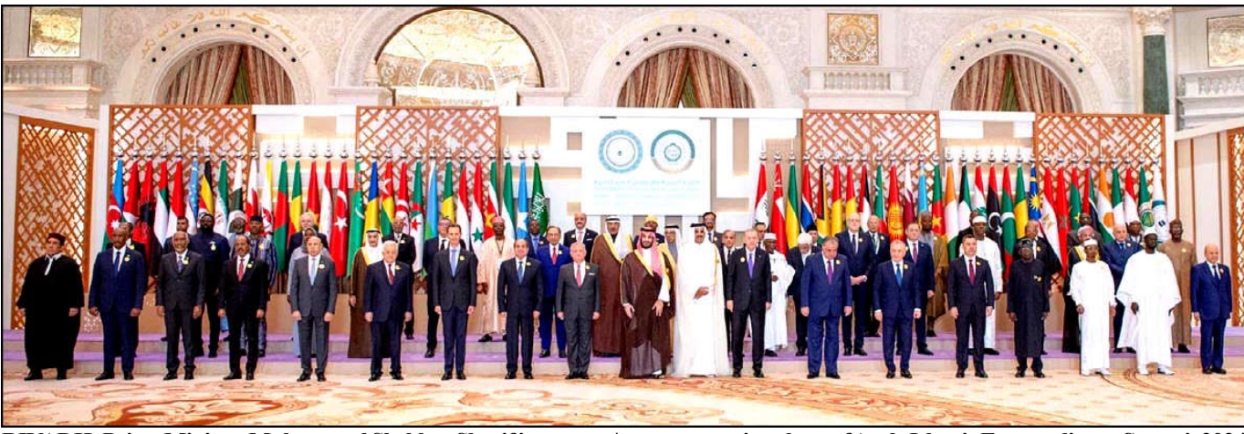
RIYADH: Prime Minister Muhammad Shehbaz Sharif in a group/commemorative photo of Arab-Islamic Extraordinary Summit 2024.