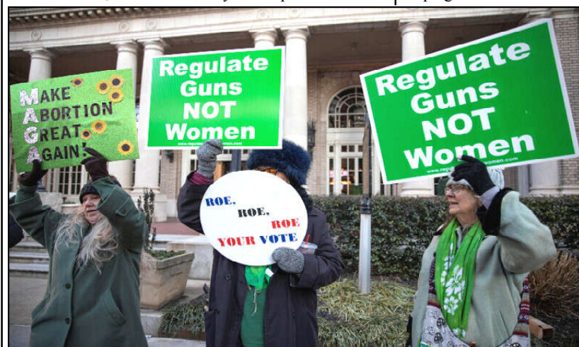
Abortion rights demonstrators rally during the annual Women's March in Atlanta, Georgia, US.

Ayyub, a fierce critic of Modi and his Hindu nationalist government, has been targeted by his ruling Bharatiya Janata Party.