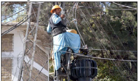
QUETTA: A Quetta Electric Supply Company (QESCO) worker repairing the transformer at Adalat road.

addition, special teams with the assistance of district administrations were monitoring the supply of quality fertilizers, seeds and pesticides in the market. Mega farmer gatherings and demonstration plots were being organized to support and educate farmers while divisional and district committee meetings were also held regularly. Furthermore, coordination between the Agriculture and Irrigation departments had been improved to ensure an adequate water supply for the wheat crop. The provincial minister emphasized that as per the chief minister's directive it was top priority to achieve wheat cultivation targets across all districts. This year, wheat cultivation on government lands would be mandatory and each Deputy Commissioner would submit a report on wheat cultivation on public lands.