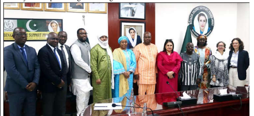
ISLAMABAD: Chairperson Benazir Income Support Programme (BISP), Senator Rubina Khalid in a group photo with a high-level delegation from West African Countries visits Benazir Income Support Programme.

tion, the Parliamentary Rules of Procedure, and the Government Rules of Business 1973. He commended the PIPS administration and team for their pivotal role in empowering parliamentary officers with relevant and practical knowledge. The chairman expressed best wishes to the course participants and hoped they would exploit this learning and networking opportunity towards a new destiny as professionals par excellence, offering quality-oriented services to the Parliamentary institutions. A highly diversified cohort of mid-career officers from the federal parliament and provincial assemblies, as well as Legislative Assemblies of Azad Jammu and Kashmir and Gilgit Baltistan and the Parliament, is participating in the course.