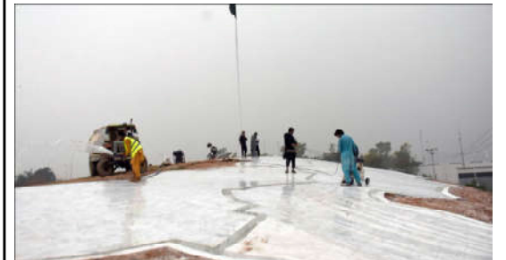
ISLAMABAD: CDA workers cleaning a map constructed at Zero Point in the Federal Capital.

hearing, he said. The Judicial Commission meeting was chaired by Chief Justice Yahya Afridi, where Justice Aminuddin Khan was appointed as the head of constitutional bench by a majority of 7-5 members. A seven-member constitutional bench was formed for 60 days. For the constitutional bench, Justice Aminuddin and Justice Ayesha Malik were taken from Punjab, while Justice Muhammad Ali Mazhar and Justice Hasan Azhar Rizvi were selected from Sindh. Justice Jamal Mankokhal and Justice Naem Akhtar Afghan were included from Balochistan, while Justice Musarrat Hilali was included from Khyber Pakhtunkhwa.