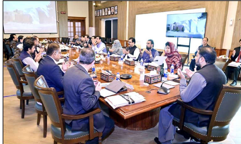
QUETTA: Chief Minister Balochistan Mir Sarfaraz Ahmed Bugti and Cabinet members offering Fateha for victims of Quetta Railway Station bomb blast