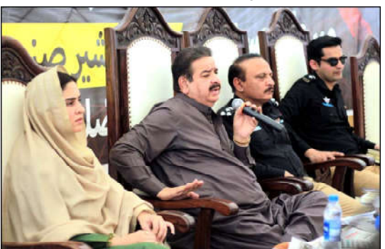
HUB: Advisor to Chief Minister Balochistan on Commerce and Industry, Mir Ali Hassan Zehri holding a Khuli Katchery to resolve the problems of poor people in Hub.

surplus of Rs 103 billion, with revenue of Rs 316 billion and expenditures of Rs 212 billion. Punjab: Faced a deficit of Rs 160 billion, with revenue of Rs 866 billion and expenditures of Rs 1026 billion. Sindh: Recorded a surplus of Rs 131 billion, with revenue of Rs 568 billion and expenditures of Rs 437 billion. Balochistan: Achieved a surplus of Rs 85 billion, with revenue of Rs 168 billion and expenditures of Rs 83 billion. It's worth mentioning here that Pakistan's economy grew by 2.52% in the fiscal year 2024, primarily owing to strong growth in the agriculture sector.