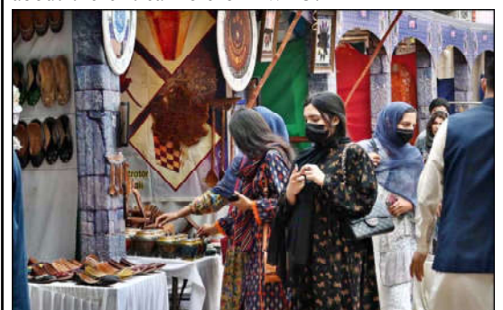
ISLAMABAD: Women visiting stalls during ten days Folk Festival Lok Mela at Lok Virsa in the Federal Capital.

China and the EU in leading global climate cooperation. Solheim emphasized that "Europe and China must work together to defend trade," especially in light of recent political shifts in the U.S., which might increase trade tensions in days to come. Without robust trade, he argued, the shift to green development could take far longer, leaving global economies more vulnerable. In recent years, with repeated shocks from the global pandemic, frequent geopolitical conflicts, and a resurgence of trade protectionism, the multilateral trading system has become increasingly fragile. Unilateral trade protection measures introduced by a few major trading nations could be the final straw that breaks the WTO.