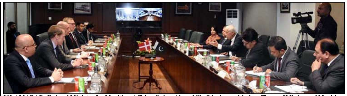
ISLAMABAD: Federal Minister for Maritime Affairs, Qaiser Ahmed Shaikh along with the officers of Ministry of Maritime Affairs in meeting with the senior officials of Danish Shipping Company Maersk Line in Islamabad.

"This reflects our collective efforts in cybersecurity, including initiatives like the National Cyber Security Policy, CERT rules, nCERT, Cyber Security Regulations, Hackathons, cloud-first policy, etc." She said, "Pakistan has also made notable advancements in the UNE-Government Development Index, rising 14 places compared to its position in 2022." "We are now proudly in the High EGD category, reflecting our growing strength in e-governance and digital innovation." She said, "Over 60% of Pakistan's IT and ITes exports go to the US and UK, which speaks volumes about the quality of the work that our enterprises and freelancers produce."