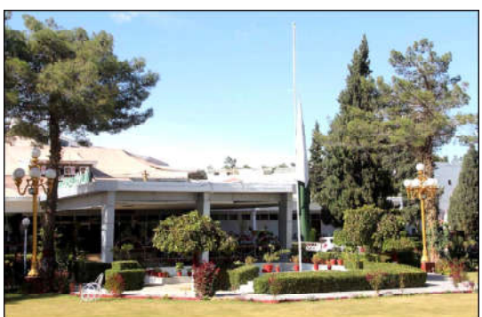
QUETTA: Nataional flag flying half-mast due to three-day mourning over the bomb blast at the railway station