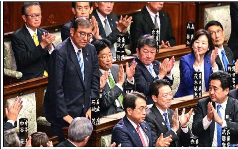
Lawmakers applaud as Japan's Prime Minister Shigeru Ishiba (standing L) is reappointed as leader after the second round of a parliamentary vote to nominate a prime minister following the October 27 general election, during a special session of parliament in Tokyo.

"This summit is very much an opportunity for regional leaders to signal to the incoming Trump administration what they want in terms of US engagement," she said. "The message will likely be one of dialogue, de-escalation and calling out Israeli military campaigns in the region." The war in Gaza began with Hamas's unprecedented attack on southern Israel on October 7 last year, which resulted in 1,206 deaths, mostly civilians, according to an AFP tally of Israeli official figures.