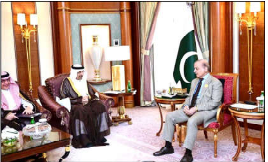
RIYADH: Saudi Investment Minister Engr. Khalid bin Abdulaziz Al-Falih and Advisor Royal Court Muhammad Al-Tuwajri call on Prime Minister Muhammad Shehbaz Sharif on the sidelines of Arab-Islamic Extraordinary Summit.