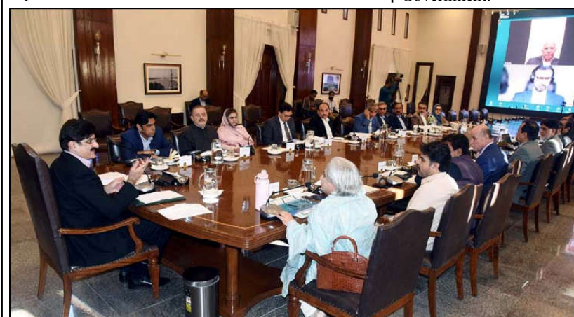
KARACHI: Sindh Chief Minister, Syed Murad Ali Shah chairs 4th the Population Task Force meeting, at CM House in Karachi.