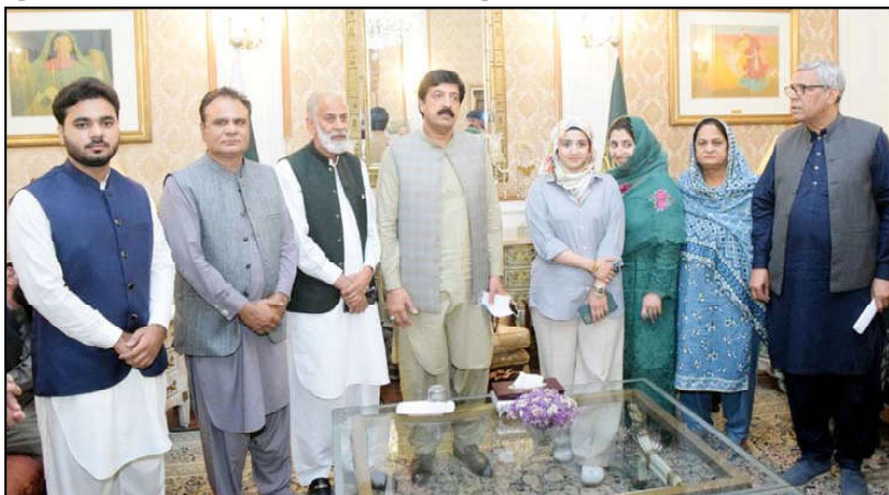
LAHORE: A delegation comprising the participants of the two-day training workshop organized to prevent human trafficking in collaboration with the International Organization for Migration and IFA in a group photo with Punjab Governor, Sardar Saleem Haider Khan at Governor House.

Due to unavoidable circumstances, work could not start on this important highway till now, he regretted.