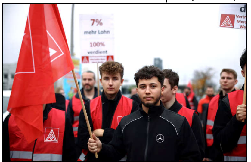
A protester holds a flag with the logo of the union IG Metall during a protest rally by employees of German car maker Mercedes demanding higher wages, at a Mercedes plant in Berlin, Germany.

The woman's body was found in a classroom at the R.G. Kar Medical College and Hospital in the state capital Kolkata on Aug 9, federal police said.