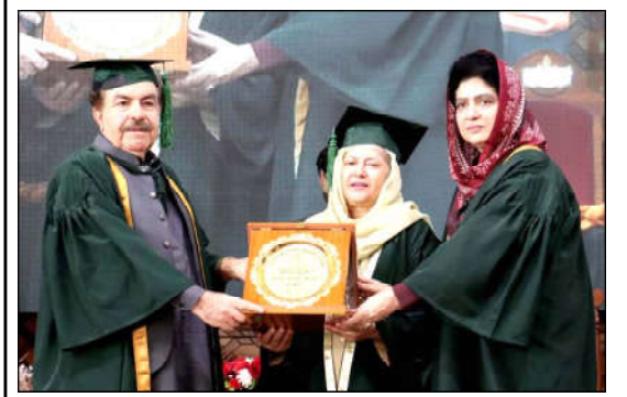
QUETTA: Principal Shireen Gul Kakar presenting memorial shield to Governor Balochistan Sheikh Jaffar Khan Mandokhail during 1 st Convocation of Govt. Girls Degree College Quarry Road Quetta. Provincial Education Minister Raheela Hameed Khan Durrani is also present.

could fill the void left by India's absence, the sources added. Sources also indicated that the PCB will send an official letter to the International Cricket Council (ICC) today, questioning the BCCI's grounds for refusing to play in Pakistan. The sources said Pakistan asserts that India's stance undermines the financial value of the competition, emphasizing that a Pakistan-India clash generates considerable viewership and revenue. Additionally, the government has urged the PCB to collaborate with the ICC and other cricket boards to address the situation, signalling Pakistan's readiness to ensure the Champions Trophy's success regardless of India's participation.