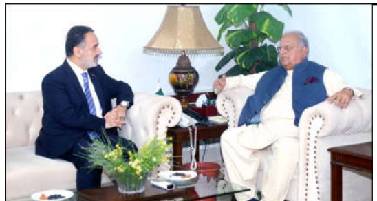
ISLAMABAD: The Ambassador of the Republic of Türkiye to Pakistan H.E. Irfan Neziroglu called on Federal Minister for Housing and Works Mian Riaz Hussain Pirzada.

Johns according to a Foreign Office press release. The two sides conducted a comprehensive review of the full spectrum of bilateral cooperation, encompassing political relations, trade and investment, climate change, renewable energy, infrastructure development and people-to-people contacts. Important regional and global developments were also discussed. Expressing satisfaction at the upward trajectory of bilateral cooperation, the two sides agreed to commemorate the 75th anniversary of the establishment of diplomatic relations between Pakistan and Denmark in a befitting manner this year.