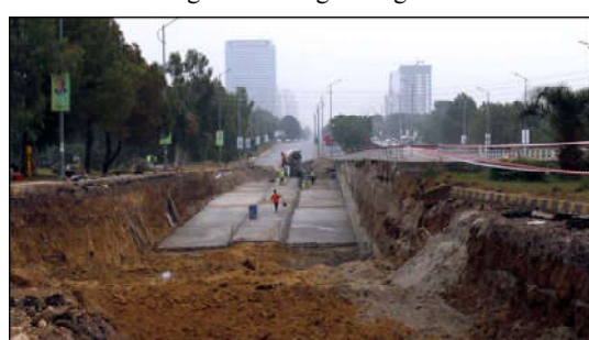
ISLAMABAD: A major road network project is underway at the PTCL Chowk underpass in the heart of the capital, aimed at improving traffic flow and enhancing infrastructure.