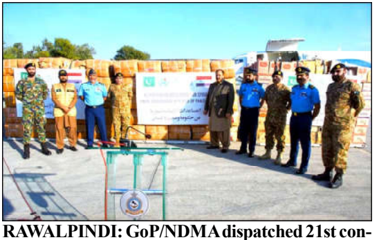
signment in collaboration with Pakistan Air Force, comprised of 17 tons of supplies via chartered aircraft from Chaklala, Rawalpindi to Damascus, Syria.

from D-Chowk. He said the sit-in was poorly planned, with the intention of disrupting government operations. PTI workers continued firing under the instructions of Ali Amin Gandapur and Bushra Bibi. PTI protesters also inister. attacked police personnel, resulting in the deaths of six lent protest has proven to security officers.