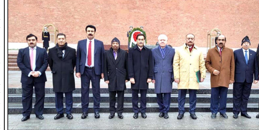
MOSCOW: Speaker National Assembly along with delegation at near Wall of Kremlin Moscow after laving wreath at the tomb of Unknown Soldier.

In addition, the containers from Kati Pahari, Margalla avenue, and GT Road have been removed and old Margalla Road has been completely reopened following the removal of closed due to the protests containers. Barriers at various interchange points and other routes