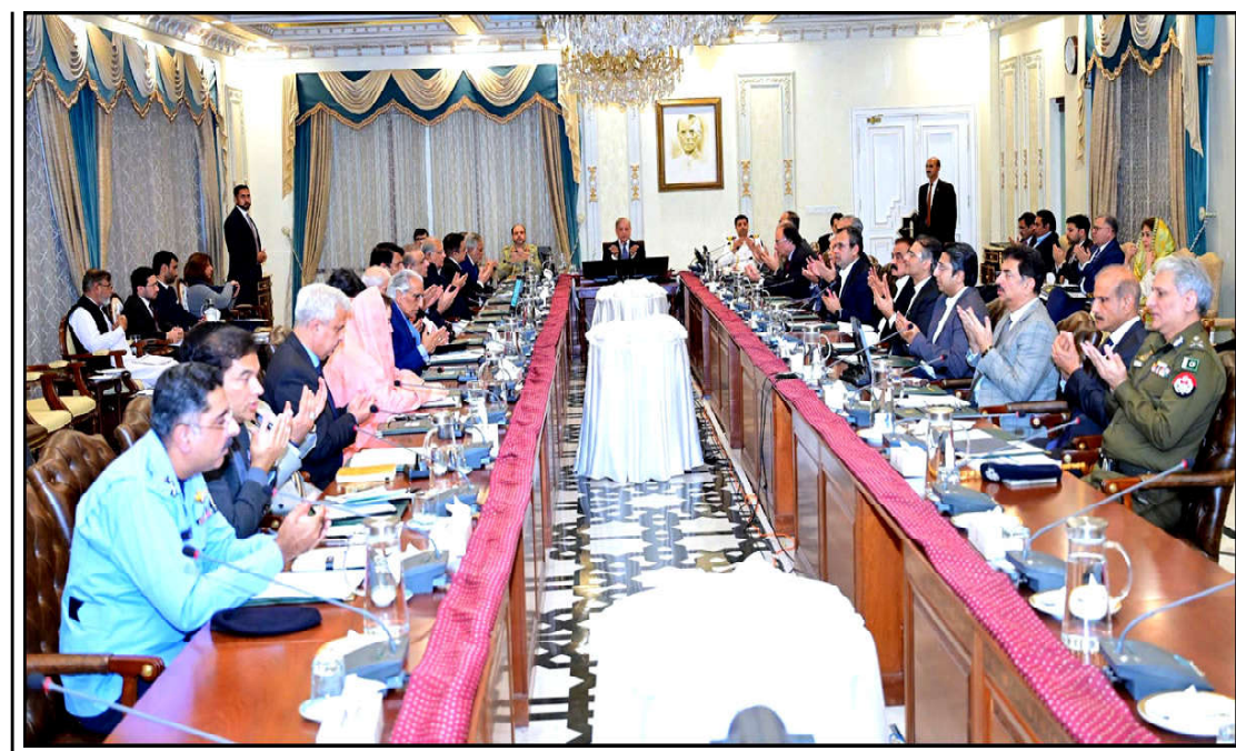
ISLAMABAD: Prime Minister Muhammad Shehbaz Sharif chairs the Federal Cabinet Meeting

In twin cities, the prime minister said the life was paralyzed. In the larger context, the economic losses were manifolds, the country's stock exchange market which had crossed the historic mark of 99,000 points few days back, lost 4,000 points in one day due to chaos.