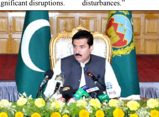
PESHAWAR: Governor Khyber Pakhtunkhwa, Faisal Karim Kundi addressing a press conference