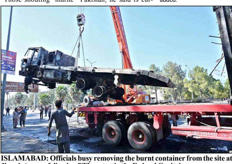
Jinnah Avenue following PTI protest in the Federal Capital.

routine to utilize state resources to launch attacks on the federal government, he