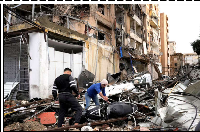
A man moves a scooter amid the rubble, in the aftermath of Israeli strikes on Beirut's southern suburbs, amid the ongoing hostilities between Hezbollah and Israeli forces, in Lebanon.

A statement listed "the casualty toll of Israeli enemy strikes on a number of Lebanese cities and towns" in the east, south and near Beirut, with most people killed in the south and four killed in the east. The NNA also reported "a drone strike that targeted a residential complex" in a Druze-majority town on the outskirts of Beirut, without prior evacuation calls. Lebanon's Druze community follows an offshoot of Shiite Islam, and its heartland around Mount Lebanon has largely been spared in the current hostilities. The education ministry suspended classes on Monday in schools, technical institutes and private higher education institutions in Beirut and a number of surrounding areas, citing "the current dangerous conditions".