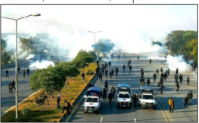
ISLAMABAD: A view of tear gas smoke raise after clash between police and PTI protesters in capital city.

He said that it seemed the PTI leadership wanted to achieve the objectives of May 9 arson again. He asked who should be held responsible for the blood of martyrs of police and rangers. The minister stated that the protesters wanted to sabotage the visit of the President of Belarus who was in Pakistan. He made it clear that no body would be allowed to disrupt the peace of the capital city. "The state will not allow to fulfill the targets of the rioters", said the minister. He pointed out no one came out to participate in the PTI protest from Balochistan and Sindh.