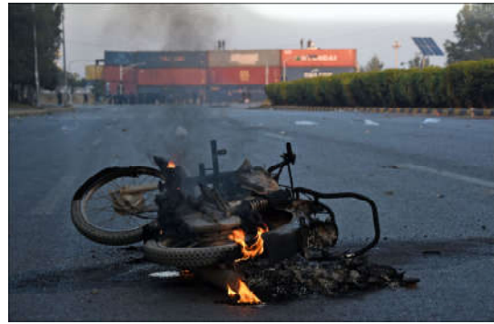
ISLAMABAD: A motorcycle burned from supporters of Pakistan Tehreek-e-Insaf (PTI) party during protest at D-Chowk, in the Federal Capital.

ISLAMABAD (APP): The National University of Sciences and Technology (NUST) made its mark at the 12th edition of the International Defence Exhibition and Seminar (IDEAS 2024), held recently at the Karachi Expo Centre. As a leading institution in technological research and development, NUST's participation was a highlight, with its pavilion featuring three specialized booths: Defence Technologies, NUST Technologies and Emerging Technologies. According to the NUST, the Defence Technologies booth showcased NUST's advanced research in defense solutions, while the NUST Technologies booth highlighted the university's contributions to advancements in various technological fields. The Emerging Technologies booth featured innovative projects that reflect the university's commitment to pushing the boundaries of innovation, from AI-driven solutions to sustainable tech applications. IDEAS 2024 saw a diverse array of local and international delegates from over 70 countries, alongside representatives from national and global organizations. This year's event set the stage for meaningful collaborations in research and innovation. NUST's active participation underlined its role in fostering global partnerships and contributing to the growth of defence.