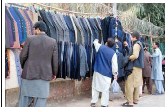
BAHAWALPUR: People buying overcoats from roadside stalls as the temperature rapidly falls in the city

The CM said 40,000 agriculture graduate interns are available to assist farmers in the field across the province, adding that applications have been invited for free grant of 1,000 green tractors and 1,000 land levelers for wheat farmers under Chief Minister Maryam Nawaz Sharif's scheme.