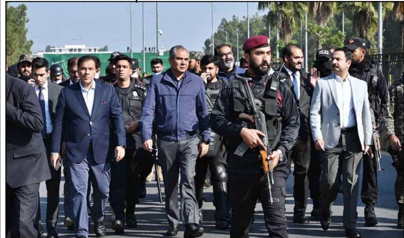
ISLAMABAD: Interior Minister Mohsin Naqvi visits the D-Chowk to boost the morale of the security personnel.