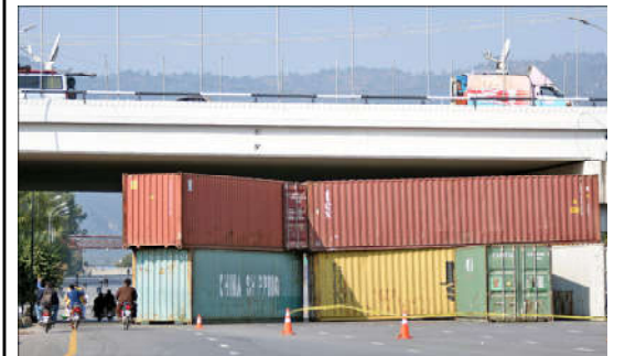
ISLAMABAD: Administration open road at Islamabad Expressway at Zero Point for public in the Federal Capital.

that the state will not be blackmailed by the PTI's protests, which have a history of turning violent. He said that the government will take firm action against any illegal activities and will not allow the party to use innocent people to attack state institutions. The Defence Minister expressed disappointment that the PTI tends to protest whenever a country announces to visit Pakistan, adding that Ali Amin Khan Gandapur, should focus on improving the law and order situation in the province. "Both government and military leadership are jointly moving the country forward. We will not permit any violent mob to attack Islamabad under any circumstances," Defence Minister Khawaja Asif stated. He emphasised the government's firm stance on maintaining law and order.