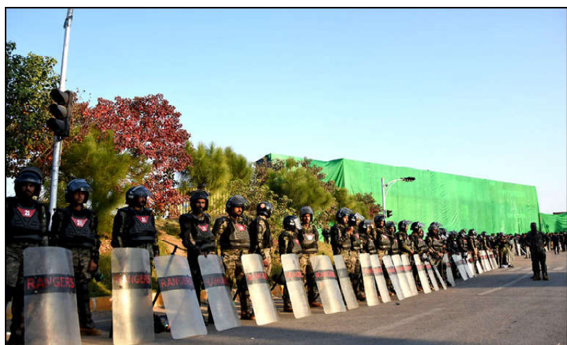
ISLAMABAD: Paramilitary soldiers alert at the D-Chowk in the Federal Capital ahead of PTI protest in the Federal Capital.

Vol. XIV No. 273 Reg. mails-B / ID-445 Monday November 25, 2024, Jamaadi ul Awwal 22, 1446 A.H. Ph: 2158688, 2158997 Pages 4: Rs. 12