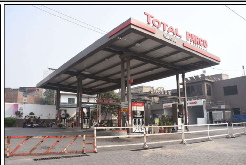
LAHORE: Petrol Pump on Ravi Road closed due to ongoing protest.

In a statement issued here, he said the region holds tremendous potential for trade, energy projects and connectivity initiatives like the China-Pakistan Economic Corridor (CPEC) and the Trans-Afghanistan Pipeline. He said such mega ventures require stability and cooperation, making it imperative for both states to prioritise trust and dialogue bringing an end to perpetual menace of terrorism.