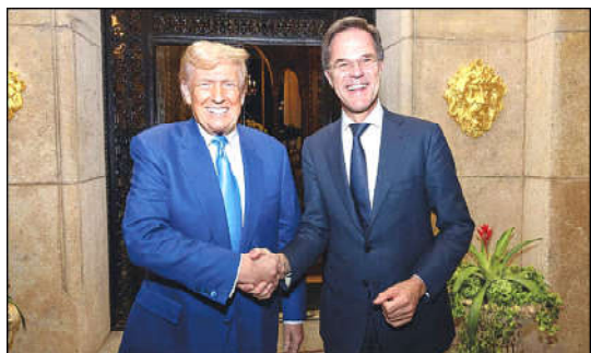
US president-elect Donald Trump shakes hands with Nato Secretary General Mark Rutte in Palm Beach, Florida.

Those same obligations were also binding on countries aspiring to join the EU, he said. "It would be very funny that the newcomers have an obligation that current members don't fulfill," he said.