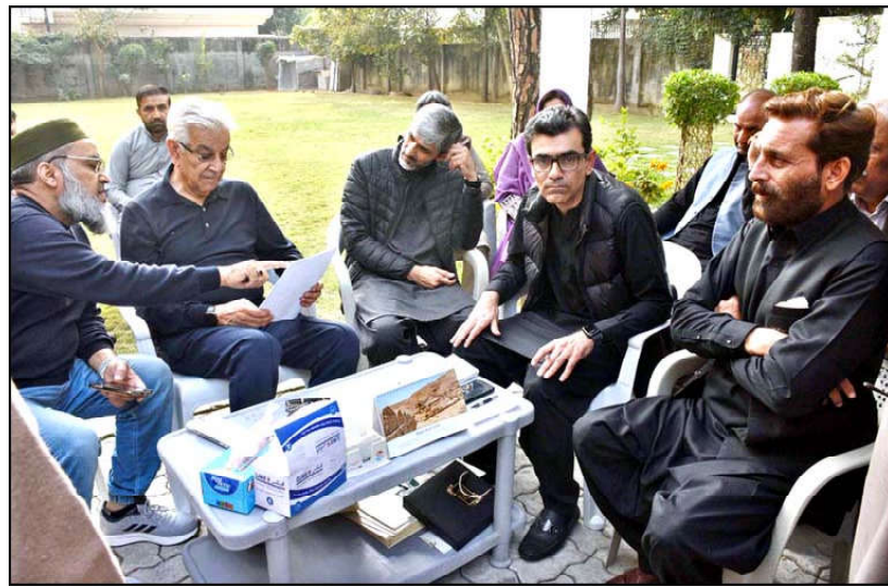
SIALKOT: Defense Minister Khawaja Muhammad Asif is listening the problems of people at his residence.

responsibility of the government. Necessary measures were inevitable to thwart ambitions of the "anarchist" group, he said and offered apology for the inconvenience caused to citizens due to road closures. The PTI acted like a terrorist organisation on May 9, and no good could be expected from it now, the minister said adding that those who invited external powers to intervene in Pakistan could not be well-wishers of the country. Ahsan said those calling for protests and sit-ins again and again had been rejected by people, as their real faces had been exposed now. He said the PTI wanted to spread chaos in the country through sit-ins.