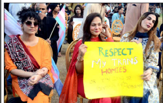
HYDERABAD: Transgender community (gathered from all over Sindh) celebrating their annual function Moorat March, demanding equality, protection and creating the opportunities in public and private sectors for betterment in their lifestyle, in the city.