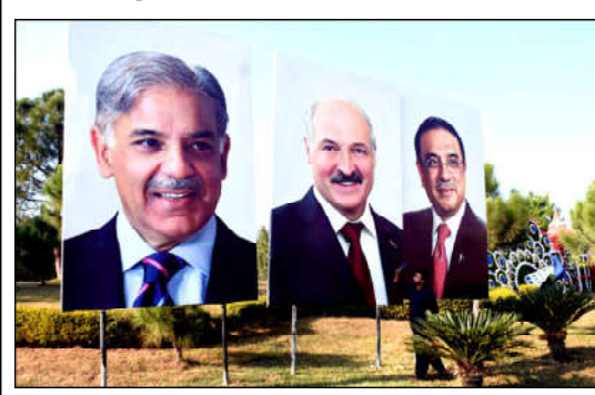
ISLAMABAD: A view of Constitution Avenue decorated with portraits of Pakistani Prime minister, Mian Muhammad Shehbaz Sharif, President Asif Ali Zardari and Belarusian President Aleksandr Lukashenko on a green belt in connection with President of Belarus visiting at Pakistan, in the Federal Capital.

The Interior Minister also met with Foreign Minister of Belarus, Maxim Ryzhenkov, and Energy Minister. He welcomed the delegation to Islamabad and expressed that the government and people of Pakistan are eagerly awaiting the visit of Belarusian President Alexander Lukashenko. Mohsin Naqvi emphasized that the president's visit is crucial in strengthening bilateral relations between the two countries.