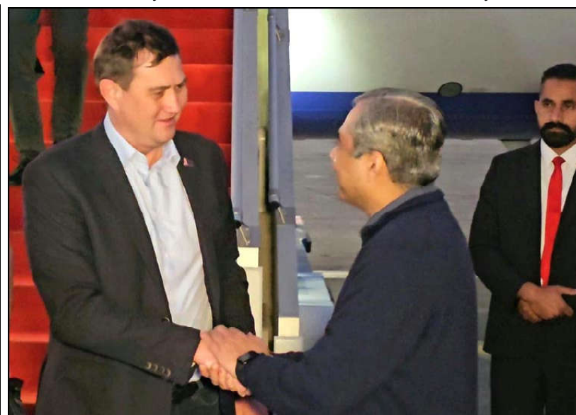
ISLAMABAD: Federal Minister for Interior Mohsin Naqvi receiving High Level Belarusian delegation on their arrival.

Bilawal Bhutto emphasized that maintaining law and order is the primary responsibility of the provincial government, but the PTI-led provincial government has failed to protect the lives and property of the citizens. "We condemn the criminal negligence of the PTI government in Kurram." He concluded by saying, "My heart is bleeding for the victims, and we cannot stand to see Khyber Pakhtunkhwa burn in the flames of lawlessness."