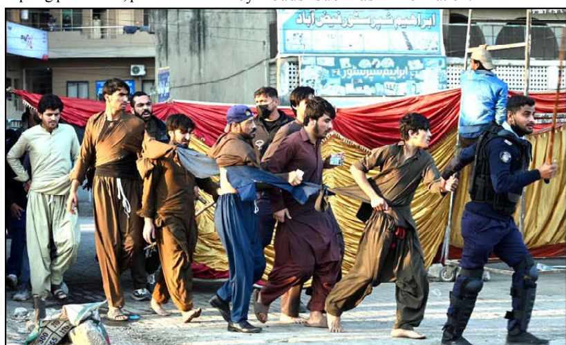
ISLAMABAD: Police taken to arrested Pakistan Tehreek-e-Insaf (PTI) workers towards prison van.

Police conducted raids throughout the night to detain PTI workers, resulting in the arrest of over 170 activists from various areas. Prisoner transport buses have been brought into the city to manage detainees. Emergency measures have been implemented in hospitals, and rescue agencies have been put on high alert. Additionally, mobile internet services have been suspended in Rawalpindi, Islamabad, and Attock to prevent the spread of protest-related information.