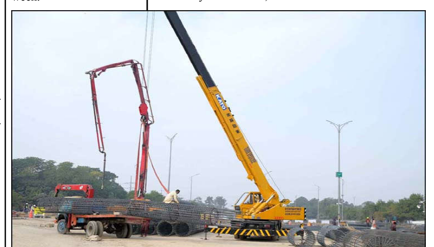
ISLAMABAD: Heavy machinery being used at the site of under-construction PTCL Chowk underpass project during development work in Federal Capital.

DIG Raza reiterated that ensuring the safety of citizens' lives and property remains the top priority of the Islamabad Police. "No one will be allowed to take the law into their own hands, and violators will face strict legal action," DIG warned. He further expressed hope that the peace-loving citizens of Islamabad would continue to cooperate with the police in maintaining law and order in the city.