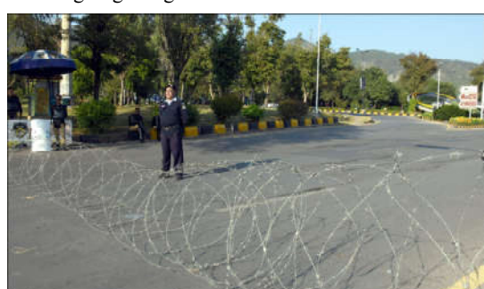
ISLAMABAD: A view of closed Margalla road with barbed wires ahead of PTI protest in the Federal Capital.