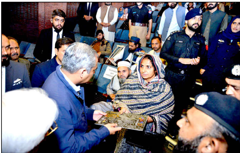
ISLAMABAD: Federal Minister for Interior Mohsin Naqvi presenting plot allotment letter to the widow of the police martyr.

ing national security. Highlighting the collective determination of the nation and its security forces to combat terrorism, the COAS stressed that thwarting the nefarious designs of inimical elements remained a top priority. "Through synchronized and robust operations, Pakistan Army in collaboration with Law Enforcement Agencies (LEAs) will relentlessly hunt down the enemies of peace to ensure lasting stability and security," he assured. Earlier, upon his arrival, the COAS was received by the Corps Commander Peshawar.