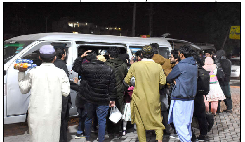
ISLAMABAD: A large number of passengers stands at a bus station at Faizabad in the Federal Capital. Islamabad authorities have announced strict security plans for November 24 due to a planned PTI protest at D-Chowk. All entry and exit points to the city will be sealed, and transport services will remain shut.

ing with Architect DB Studio based in Islamabad, is the result of meticulous planning and collaboration amongst all stakeholders. The plan envisions a green space that not only restores the natural beauty of the Margalla Hills but also provides a unique recreational space for residents and tourists. Key Features of the Master Plan includes promenades and walking Trails, reflecting pool and Eco-display area, open air amphitheatre, play area for children, sitting areas for elders, prayer area, visitor information centre, office spaces and parking areas.