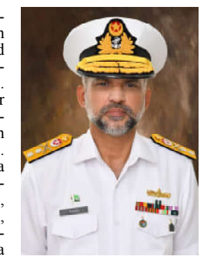
from USA, Pakistan Navy Staff Course from PN War College Lahore and National Security and War Course from National Defence University, Islamabad. The Admiral has an illustrious career covering vast experience of various Command and Staff appointments.