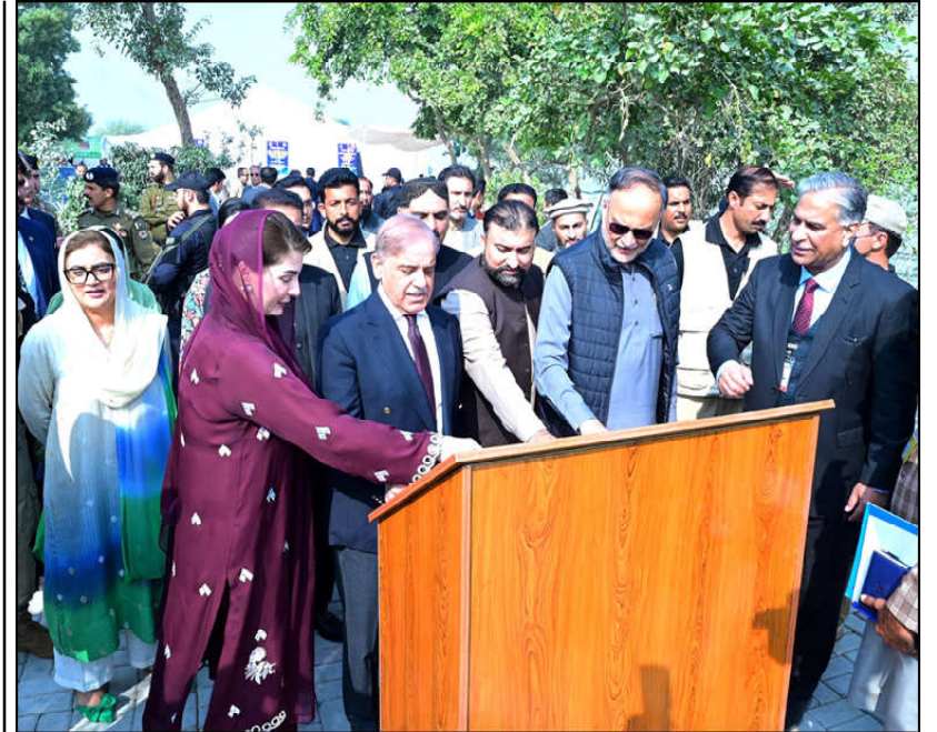
TAUNSA BARRAGE: Prime Minister Muhammad Shehbaz Sharif presses the button to open gates for flow of water from Indus River into Kachhi Canal.

wells. Similarly, he also spoke highly for the Punjab Chief Minister for launching the project of a cancer hospital, free tractor scheme for farmers to bring about the agricultural revolution and other initiatives in the education and health sectors. Earlier, in her address, Punjab Chief Minister Maryam Nawaz said the canal project would bring about prosperity in Balochistan besides enhancing coordination and closeness among the provinces. She said the credit for all mega public welfare projects like motorways, youth scholarships, modern transport facilities including Orange Line, Metro or Speedo buses and student bikes went to the PML-N governments.