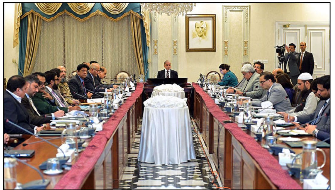
ISLAMABAD: Prime Minister Muhammad Shehbaz Sharif chairs a review meeting regarding reforms in Information Technology sector.

ing the last four months. It was informed that Pakistan's IT ranking improved from 79 to 40, e-governance ranking by 14 points, and 2500 new IT companies were registered. The participants were informed that for the next five years, a $15 billion target has been set for IT sector exports, $10 billion for digitization, and $1 billion for telecom exports. The meeting was briefed on the Labor Management System aimed at capacity building of the workforce in collaboration with the educational institutions, using the demand data of the industries.