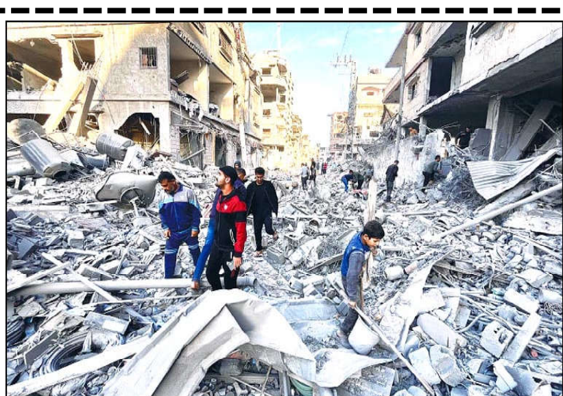
People search for survivors in the rubble of a building hit by an overnight Israeli strike in the Beit Lahiya area of Gaza.

to go. In northern Gaza, people remain under a tight siege. They run for their lives in vicious circles and have been deprived of humanitarian aid for more than 40 days now," he said in a post on X. "Across Gaza, the delivery of the little aid allowed in has become overly complex including because of insecure routes," he added. The administration of US President Joe Biden last month told Israel it had 30 days to improve the flow of aid to Gaza or risk consequences to US military assistance. On Nov 12, Washington said it had concluded that Israel had made progress and was not impeding aid to Gaza. Many aid groups disagreed. Adding to the challenges, armed gangs have stepped up looting of aid trucks, contributing to spiralling prices of essential food items such as flour. The price of a 25kg sack of flour, if available, has risen to 700 shekels ($186) from 50 shekels ($13) over the past week.