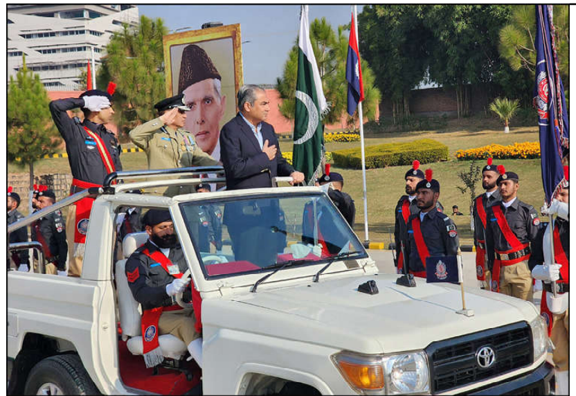
ISLAMABAD: Federal Minister for Interior Mohsin Naqvi reviewing parade during the passing out ceremony of ASPs of 50th STP at National Police Academy