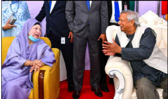
Chief adviser of Bangladesh's interim government Muhammad Yunus with former premier and Bangladesh Nationalist Party chairperson Khaleda Zia at a reception in Dhaka, Bangladesh.

rest warrants for Netanyahu and Gallant over alleged war crimes and crimes against humanity in Gaza. Netanyahu sacked Gallant as defence minister on November 5. Khan also sought warrants against top Hamas leaders, including Deif, on suspicion of war crimes and crimes against humanity. The prosecutor dropped the application for former Hamas chief Ismail Haniyeh on August 2 "because of the changed circumstances caused by Mr Haniyeh's death" in Tehran on July 31, the ICC earlier said in a statement. According to Israel, Deif was killed by a strike on July 13 in southern Gaza, though Hamas denies he is dead.