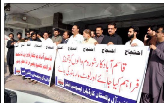
HYDERABAD: Members of All Pakistan Car Dealers Association are holding protest demonstration for demanding protection, in Hyderabad.

Furthermore, the chief minister has instructed the reactivation of a previously held tribal jirga to help stabilize the situation in the area. Ali Amin Gandapur emphasized that the provincial government, police and all relevant institutions are making concerted efforts to improve law and order in the region. As part of these measures, he directed the concerned authorities to expedite the establishment of a Provincial Highways Police to ensure the safety of all major routes across the province.