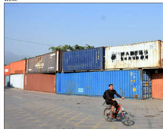
ISLAMABAD: Workers busy in placed heavy shipping containers near Faizabad flyover along Islamabad Highway for road block ahead of upcoming PTI protest, in the Federal Capital.

According to statement issued by CM House spokesman, CM Sindh called on the federal Government to convene CCI meeting under Article 154 (3) of the Constitution.