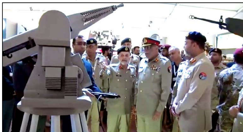
KARACHI: Chairman Joint Chiefs of Staff Committee General Sahir Shamsad Mirza visiting 12th International Defence Exhibition and Seminar-24 at Expo Center

"We are left with no choice but to protest like a living nation," Imran remarked, adding that the November 24 rally will see participation from Pakistanis abroad who enjoy freedom in other countries. He asserted that negotiations would continue, though he expressed doubts about the government's seriousness.