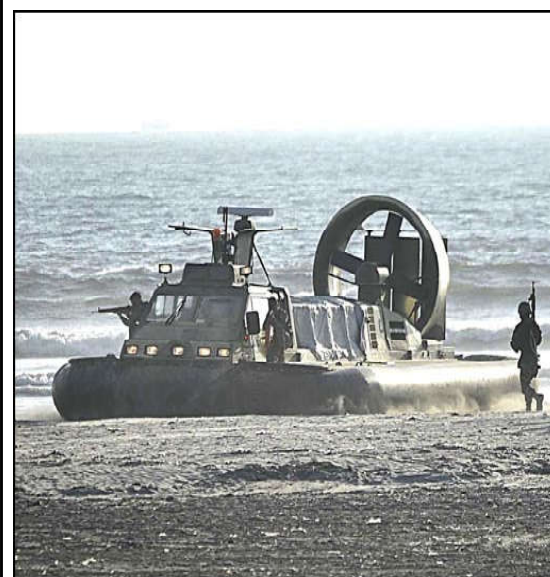
KARACHI: A view of Counter-terrorism exercise during ongoing International Defence Exhibition and Seminar (IDEAS) 2024.

Punjab Minister also emphasized the importance of taking polio drops seriously and urged parents not to compromise on their children's health. Bakht Muhammad Kakar, the Provincial Minister of Health in Balochistan has emphasized the importance of improving sanitation and hygiene systems, addressing parental refusal and boosting routine immunization.