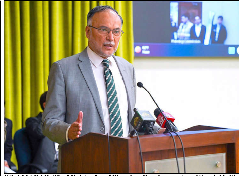
ISLAMABAD: The Minister for Planning, Development, and Special Initiatives Ahsan Iqbal inaugurated the National Productivity, Quality, and Innovation (PQI) Summit 2024. This two-day event revolves around the theme "Driving Growth Through Excellence in Productivity, Quality, and Innovation."

He said Pakistan was turning around due to the difficult decisions taken by the current government of Pakistan Muslim League-Nawaz (PML-N), at the cost of its 'political capital.'