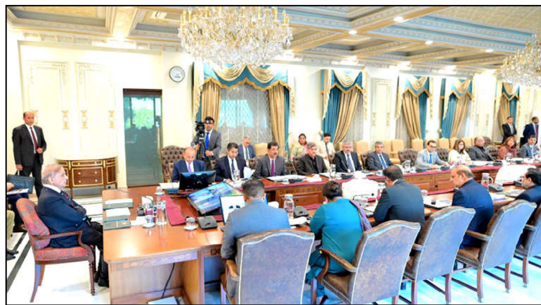
ISLAMABAD: Prime Minister Muhammad Shehbaz Sharif chairing a review meeting of the Public Procurement and Good Governance.

Several agreements and Memorandum of Understandings (MoUs) will also be signed during the visit, according to a curtain raiser issued by the Foreign Office.