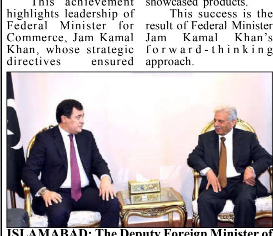
ISLAMABAD: The Deputy Foreign Minister of Kazakhstan, Alibek Bakayev, meets with Federal Minister for Industries and Production Rana Tanveer Hussain.

Pakistan's outstanding representation on the international stage. The Global Sourcing Expo, the largest exhibition for textiles, leather, and home textile products in the Oceania region, featured exhibitors from major exporting nations, including China, India, Vietnam, Cambodia, and South Africa.