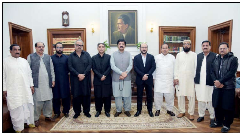
LAHORE: Governor Punjab, Sardar Saleem Haider Khan in a group photo with a delegation of Parliamentary Leader of PPP Punjab Assembly, Syed Ali Haider Gillani, and MNA, Syed Ali Qasim Gillani in Governor House.

of government's measures are coming to light. People lose their lives due to lack of health and treatment facilities. "We are all Pakistanis irrespective of our political affiliations. Our aim is to promote patriotism. Inflation is low and foreign exchange reserves are increasing in Pakistan. The stock market has broken all records; IT exports are increasing. With increasing exports, dependence on foreign aid decreases, we will be able to live our lives with pride and dignity." Maryam Nawaz said, "Controlling inflation is an uphill task, bringing it down from 38 per cent to 7 per cent is a mega achievement.