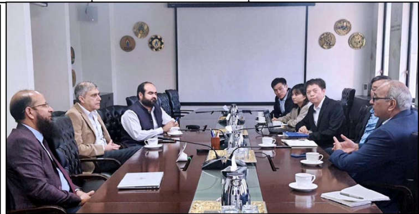
ISLAMABAD: A Delegation from China Geological Survey (CGS) Calls on Secretary Petroleum to Bolster Geoscientific Collaboration.