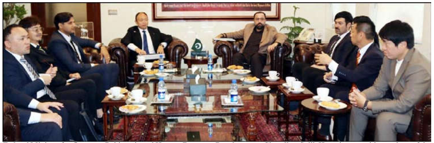
Federal Minister for Overseas Pakistanis and Human Resource Development, Chaudhry Salik Hussain, met with members of the Japan-Pakistan Innovation Institute (JPII) in Islamabad