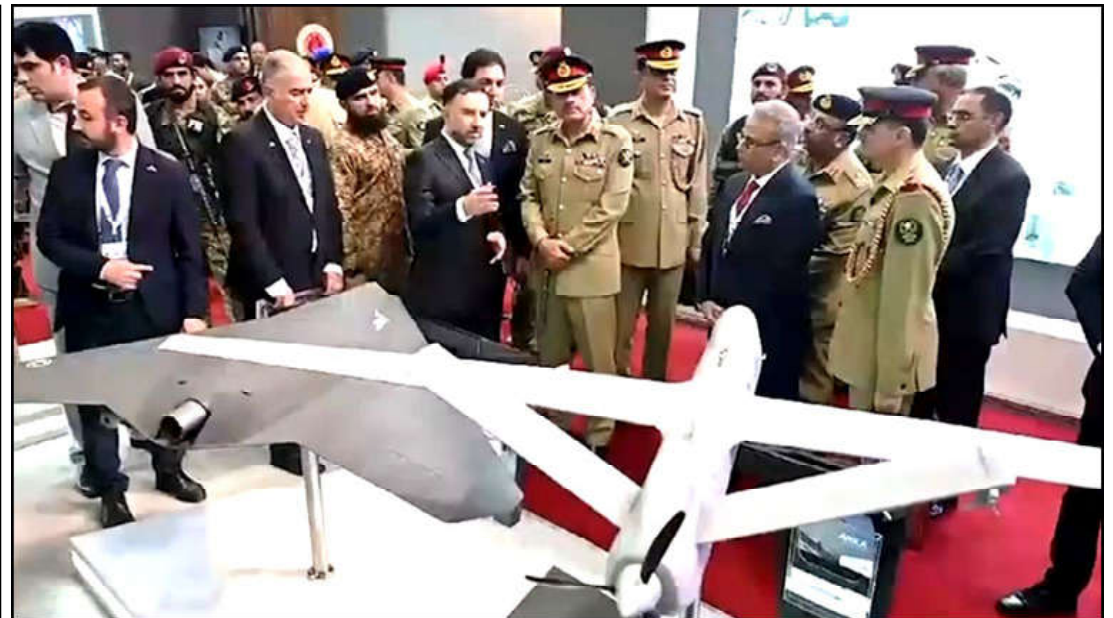
KARACHI: General Syed Asim Munir, NI (M) Chief of Army Staff (COAS), visiting the International Defence Exhibition and Seminar (IDEAS-2024) at the Karachi Expo Centre.

During the visit, the COAS commended the active participation of defense manufacturers from friendly nations and observed an impressive display of arms and equipment by both domestic and international exhibitors, said an Inter Services Public Relations (ISPR) news release.