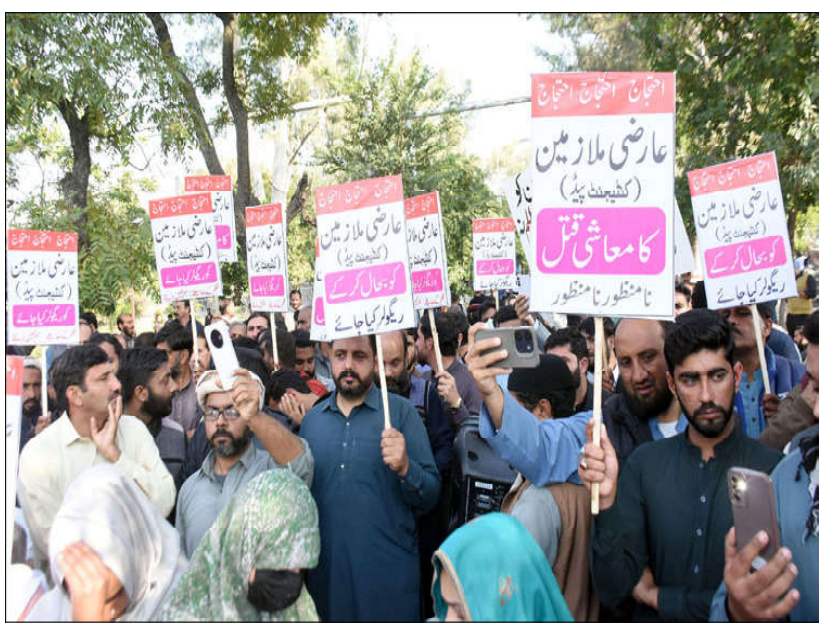
ISLAMABAD: Government employees hold placards during protest in favor of their demands at Pak-Secretariat in the Federal Capital.