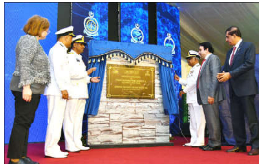
Chief of the Naval Staff Admiral Naveed Ashraf laid foundation of Pakistan Maritime Science and Technology Park (PMSTP) during IDEAS 2024.

He said that the PTI founder misused his position and threatened the person responsible for assessing the value of the set.