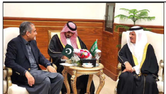
ISLAMABAD: Federal Minister for Interior Mohsin Naqvi in a meeting with Saudi Deputy Interior Minister Nasser bin Abdul Aziz Al Dawood.