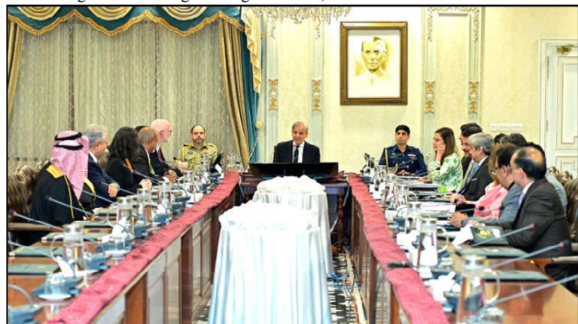
ISLAMABAD: A delegation of Polio Oversight Board meeting with Prime Minister Muhammad Shahbaz Sharif.