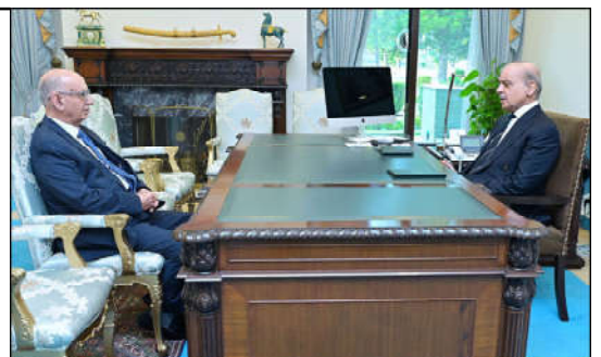
ISLAMABAD: Leader of the Parliamentary Party of Pakistan Muslim League (N) in Senate and Chairman of the Senate Standing Committee in Foreign Affairs, Senator Irfan Siddiqui calls on Prime Minister Muhammad Shehbaz Sharif.

ISLAMABAD (APP): The Ministry of Planning, Development and Special Initiatives would hold a two-day National Productivity, Quality and Innovation (PQI) Summit-2024, starting here from Thursday. The summit titled "Driving Growth Through Excellence in Productivity, Quality, and Innovation" would be inaugurated by Minister Ahsan Iqbal, highlighting importance of productivity, quality.