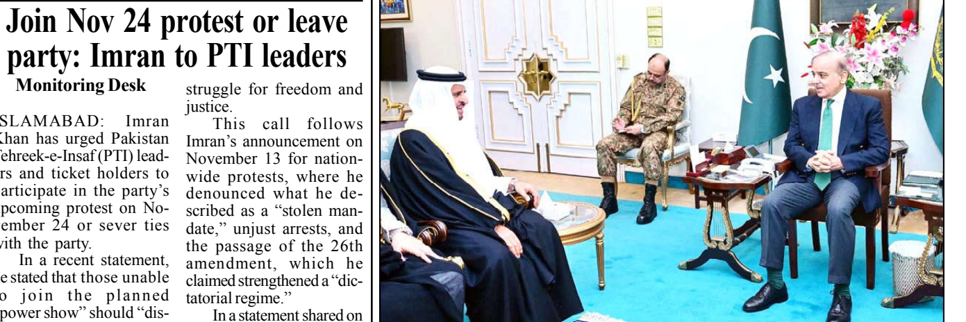
ISLAMABAD: Deputy Interior Minister of Saudi Arabia H.E. Dr. Nasser bin Abdul Aziz Al Dawood calls on Prime Minister Muhammad Shehbaz Sharif.

The COAS reiterated vering resolve to eliminate all threats to national secusupport government's initiatives aimed at ensuring peace and