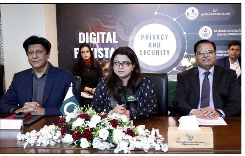
ISLAMABAD: Minister of State for IT and Telecommunication Ms. Shaza Fatima Khawaja addressing launching ceremony of 'Digital Dialogue Pakistan'.

Under its terms, the 193 member Assembly would declare its firm opposition to acts of foreign military intervention and occupation suppressing the right to self-determination f peoples and nations, calling upon those States responsible to cease them.