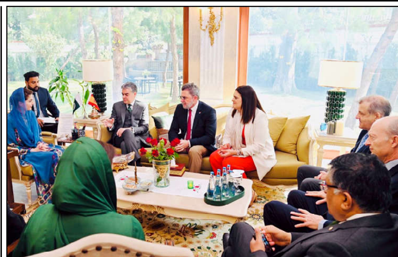
LAHORE: The Spanish Parliamentary delegation meeting with Punjab Chief Minister Maryam Nawaz Sharif.