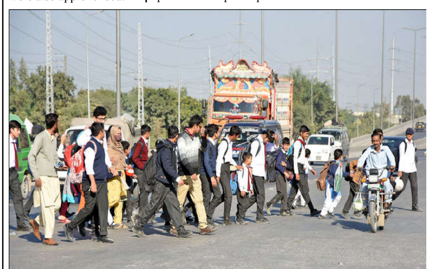
ISLAMABAD: Students cross very busy Karnal Sher Khan Shaheed Road, during heavy traffic, which may cause any incident any time as needs to attention for concern authority, in the Federal Capital.