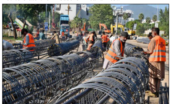
ISLAMABAD: Laborers are busy binding steel at the construction site of an underpass along Khyaban-e-Suharwardi in the Federal Capital as part of ongoing development work.