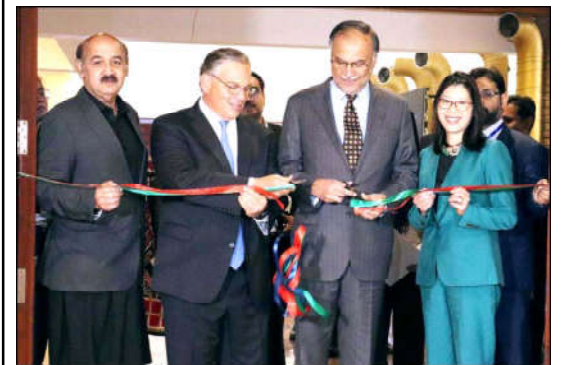
ISLAMABAD: Federal Minister Ahsan Iqbal inaugurates the USAID Development Journey Exhibition in Islamabad, celebrating decades of US Pakistan collaboration in infrastructure and development.

It was said in the letter that meeting of CCI is must for bolstering cooperation between federal units, resolution of key issues, peace in the country, harmony and socio-economic development of the country.