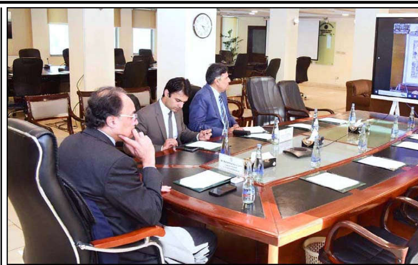
ISLAMABAD: Federal Minister for Finance and Revenue Senator Muhammad Aurangzeb held a virtual meeting with the Governor of the State Bank of Pakistan (SBP), Mr. Jameel Ahmed, and the Chairman of the Pakistan Banks' Association (PBA), Mr. Zafar Masud, along with their teams, to discuss progress on financing for the priority sectors.

He argued that some of the proposals suggested by PBA were concrete in scope and the central bank had already issued necessary notifications on regulatory side to facilitate their implementation. He also proposed a more proactive consultation between stakeholders, particularly with telecos and power companies, on initiatives requiring data collection and building scorecard for agriculture and SME sectors for sustainable financing.