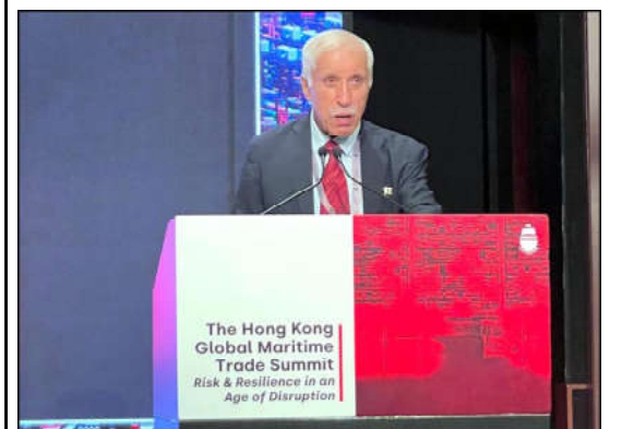
HONG KONG: Federal Minister for Maritime Affairs, Qaiser Ahmed Shaikh while addressing Global Maritime Trade Summit.

Rana Tanveer Hussain said that the federal and Punjab governments will work together for the promotion of technical education and industry. Coordination between the two governments is essential for the promotion of technical education and industry, he said and added that the federal government will cooperate with Punjab in all possible ways. He said, "It is our commitment to equip the youth with quality technical education. The future of Pakistan is linked to the promotion of quality technical education."