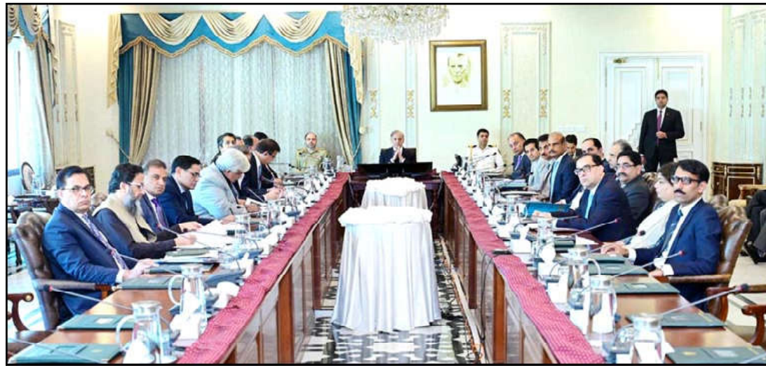
ISLAMABAD: Prime Minister Muhammad Shehbaz Sharif receiving a briefing from the Ministry of Finance regarding the country's economy and the meeting with the IMF delegation.

In a surprising turn, the petitioner admitted not casting his vote in the previous general elections when questioned by Justice Jamal Mandokhail.