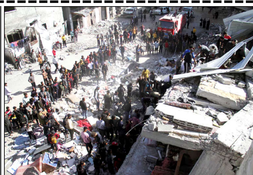
Palestinians, including rescuers, search for casualties at the site of an Israeli strike on a house, in Gaza City.

Monitoring Desk ROME: Pope Francis has suggested the global community should study whether Israel's military campaign in Gaza constitutes a genocide of the Palestinian people, in some of his most explicit criticism yet of Israel's conduct in its year-long war. In excerpts published on Sunday from a forthcoming book, the pontiff said some international experts say that "what is happening in Gaza has the characteristics of a genocide." "We should investigate carefully to assess whether this fits into the technical definition (of genocide) formulated by international jurists and organisations."