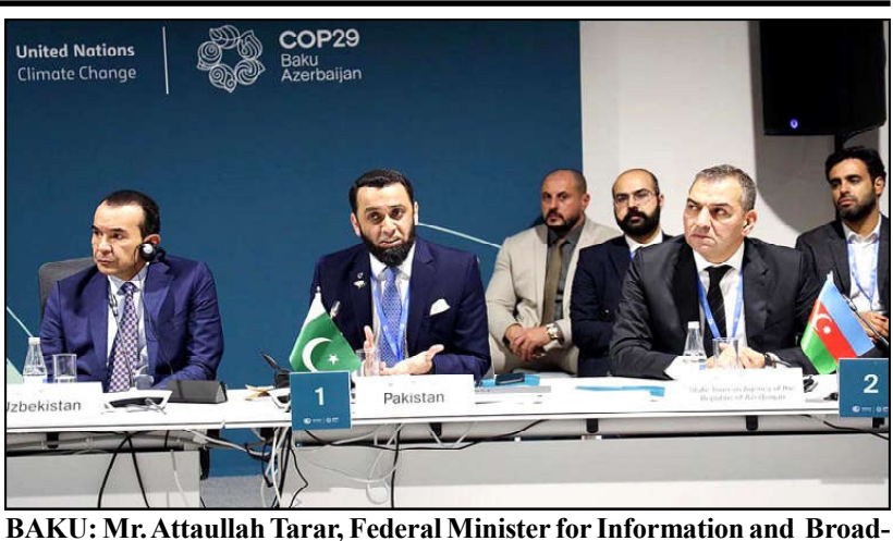
casting, National Heritage and Culture delivering a speech at high-level Ministerial Dialogue.