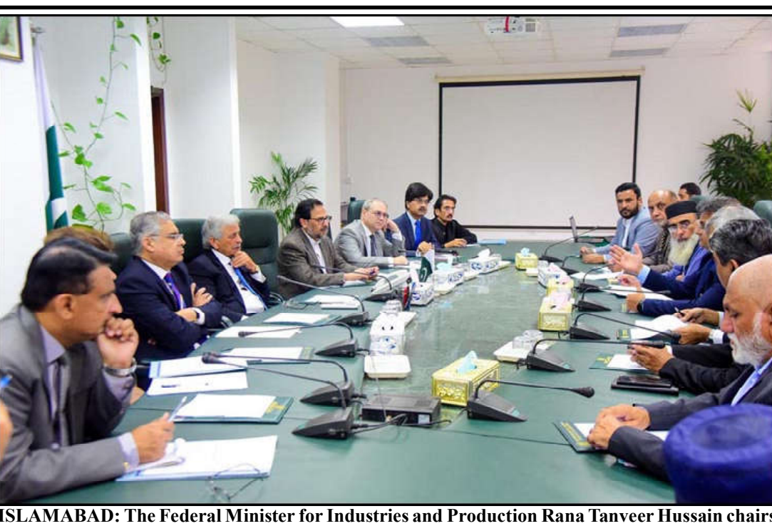
ISLAMABAD: The Federal Minister for Industries and Production Rana Tanveer Hussain chairs meeting of the Fertilizer Review Committee (FRC).