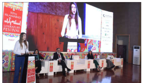
ISLAMABAD: British High Commissioner to Pakistan, Jane Marriott addressing the 10th Islamabad Literature Festival at Federal Capital.

According to official sources, a total of 49,888 youth in Sindh and 21,730 youth in Balochistan benefited from skill scholarships, enabling them to gain valuable technical expertise and improve their employment prospects. The program aimed at uplifting youth in these regions and fostering inclusive growth.