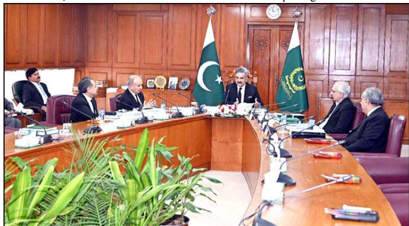
ISLAMABAD: The Hon'ble Chief Justice of Pakistan/Chairman Supreme Judicial Council Justice Yahya Afridi presiding over the meeting of Supreme Judicial Council at Supreme court of Pakistan.