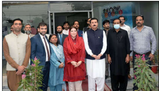
LAHORE: Governor Khyber Pakhtunkhwa, Faisal Karim Kundi, poses for a group photo with officials of the Punjab Social Protection Authority during his visit to the Punjab Social Protection Authority (PSPS).

If there is pressure of government on DC and others then they will work.