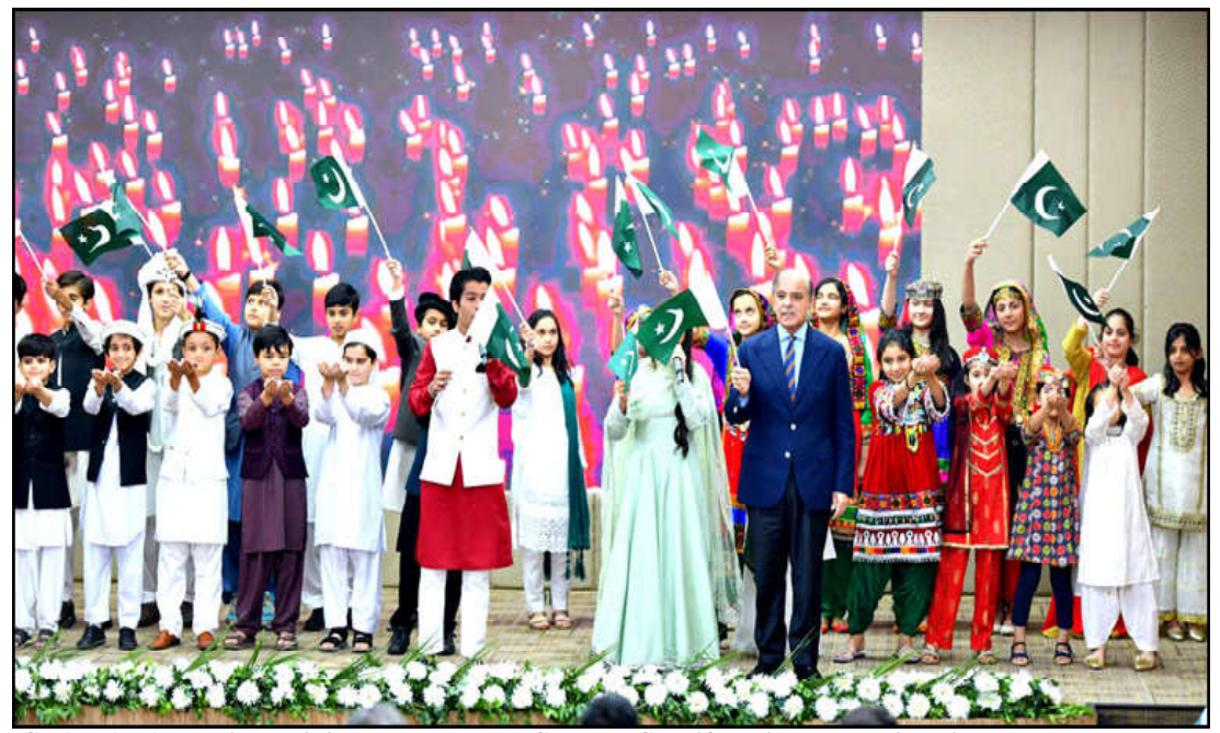
ISLAMABAD: Prime Minister Muhammad Shehbaz Sharif waving the Pakistani flag at a ceremony to celebrate Allama Muhammad Iqbal's Birthday.

The resolution on conventional arms control at regional and sub-regional levels acknowledges that the preservation of a balance in States' defence capabilities strengthens peace and stability.