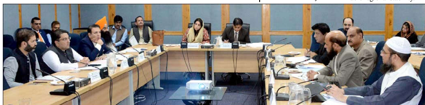
Senator Palwasha Mohammad Zai Khan, Chairperson Senate Standing Committee on Information Technology and Telecommunication presiding over a meeting of the committee at Parliament Lodges Islamabad

They encouraged citizens to be vigilant in their neighborhoods and report any suspicious activities to law enforcement. The participants expressed gratitude to the IGP Islamabad for organizing these Khuli Kachehris.