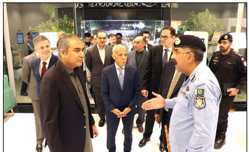
ISLAMABAD: Federal Minister for Interior, Mohsin Naqvi visiting Cascade Facilitation Center, at Diplomatic Enclave in Islamabad.

ment, logistics and digitization of customs.