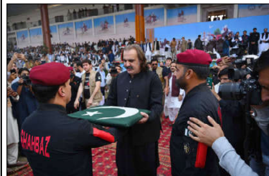
PESHAWAR: A paratrooper commander presents the national flag to Chief Minister KP, Ali Amin Gandapur, at a horse and cattle show organized by the Directorate General of Sports Khyber Pakhtunkhwa at Col. Sher Khan Stadium.

The show commenced with a free-fall jump and an air gliding display which captivated the audience. The event also featured traditional music and dance performances presented by bands of Frontier Corps North parties while dog and camel races and a horse dance display were also part of the first day events.