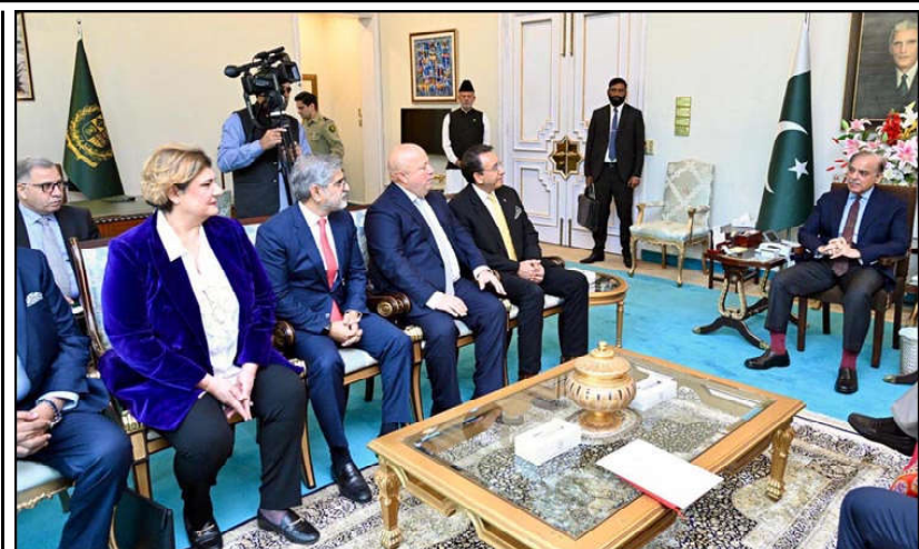
ISLAMABAD: A delegation of VEON Group calls on Prime Minister Muhammad Shehbaz Sharif.