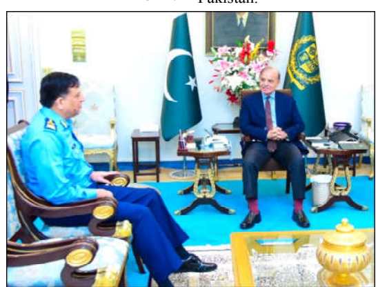
ISLAMABAD: Chief of Air Staff Air Chief Marshal Zaheer Ahmad Babar Sidhu called on Prime Minister Muhammad Shehbaz Sharif.

He said due to the efforts of the Prime Minister, Saudi Arabia, UAE and Qatar were investing in Pakistan whereas Azerbaijan had also announced 2 billion dollars investment in Pakistan.