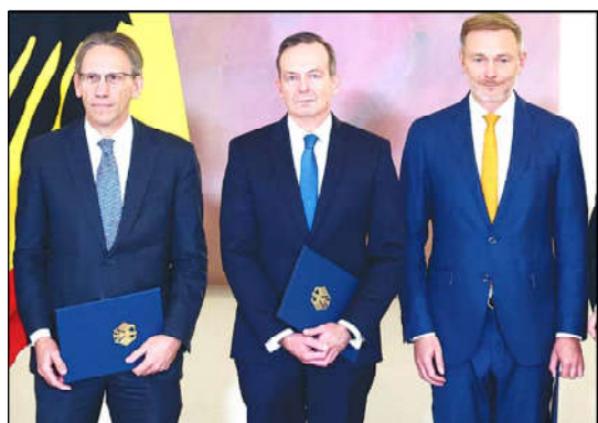
Newly appointed German Finance Minister Joerg Kukies stands next to Transport and Justice Minister Volker Wissing, and his predecessor, Christian Lindner.

Israel's military, which began its offensive in response to the Oct. 7, 2023 attack in which Hamas fighters killed about 1,200 people in southern Israel and seized more than 250 hostages, says it takes care to avoid harming civilians in Gaza. It has said approximately one civilian has been killed for every fighter, a ratio it blames on Hamas, saying the Palestinian militant group uses civilian facilities. Hamas has denied using civilians and civilian infrastructure, including hospitals, as human shields.