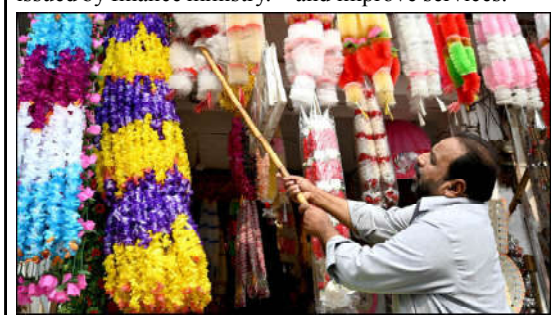
RAWALPINDI: A shopkeeper arranges garlands and festive decorations, ready to welcome customers seeking to celebrate in style as the wedding season kicking off in the twin cities.

During the meeting, the minister reiterated the government's resolve for tax reforms with a focus on people-processed technology and end-to-end digitalisation to enhance transparency, plug leakages and improve services.