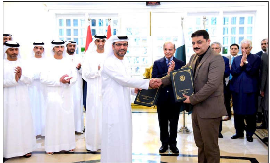
ISLAMABAD: Prime Minister Muhammad Shehbaz Sharif witnessing exchange of MoUs between Pakistan and Abu Dhabi Ports.

Besides thanking the IMF for permitting the government to announce the package, he also commended the cabinet members and relevant senior officers for their efforts and teamwork in working out the relief package.