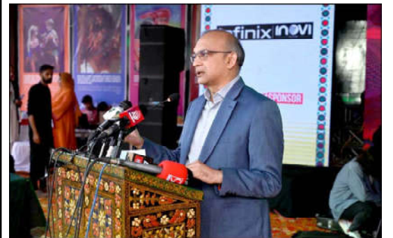
ISLAMABAD: Secretary of the National Heritage and Culture Division, Hassan Nasir Jami, addresses during the opening ceremony of the 'Annual Ten-Day Folk Festival Lok Mela' at Lok Virsa in the federal capital.

Our children should focus on skill-based education, as the world is advancing with modern learning techniques," he said. The minister highlighted the importance of skilled education, encouraging young people to pursue modern educational paths that are globally competitive.