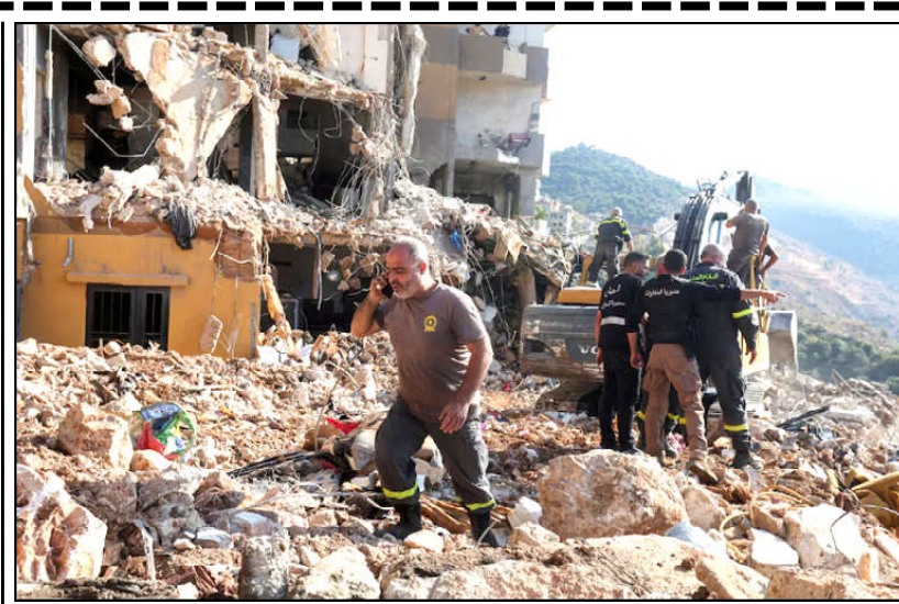
Civil defense members work at a site damaged in the aftermath of an Israeli strike, amid the ongoing hostilities between Hezbollah and Israeli forces, in Barja, Lebanon.