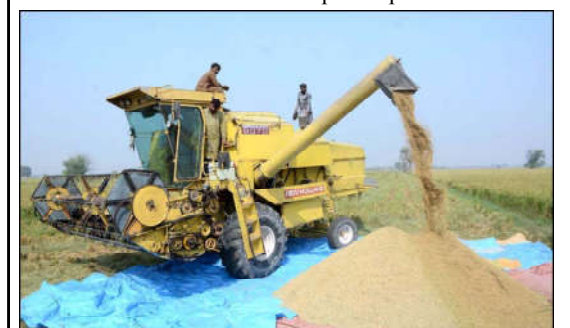
FAISALABAD: Farmers use a thresher to harvest rice crops in the field, efficiently separating grain from the stalk in the field.

empowers policymakers to make informed decisions that are responsive to real-time challenges. By leveraging IT, policymakers can create data-driven, inclusive policies that promote sustainable water and food security, she added. Shaza Fatima said that water security and its proper usage is being ensured through technology, adding that technology is also being used in agriculture sector today. She said the Ministry of IT & Telecom launched initiatives to enhance IT adoption, making data more open and accessible for improved public services.