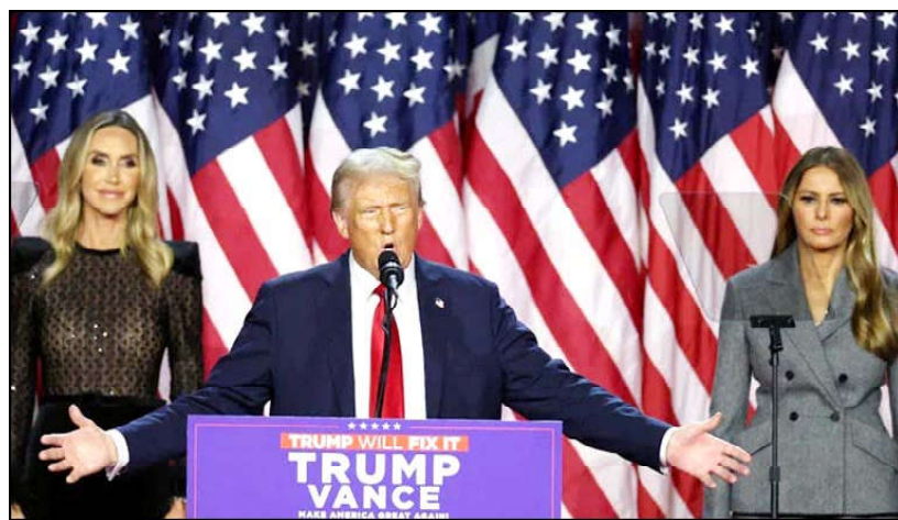
Donald Trump is accompanied by family members as he addresses supporters

But he swept away challengers inside his Republican Party and then