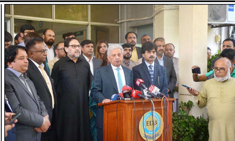
ISLAMABAD: Federal Minister for Industries and Production Rana Tanveer Hussain is addressing an unveiling exhibition ceremony of models of electric bikes at Engineering Development Board.

A total of 889,166,479 shares were traded during the day as compared to 752,664,527 shares the previous trading day, whereas the price of shares stood at Rs 30.474 billion against Rs. 32.27 billion on the last trading day. As many as 452 companies transacted their shares in the stock market, 201 of them recorded gains and 200 sustained losses, whereas the share price of 51 companies remained unchanged. The three top trading companies were Bank of Punjab with 88,684,180 shares at Rs 6.21 per share, Energycio PK with 71,639,690 shares at Rs 4.11 per share and Power Cement with 39,151,188 shares at Rs.7.20 per share.