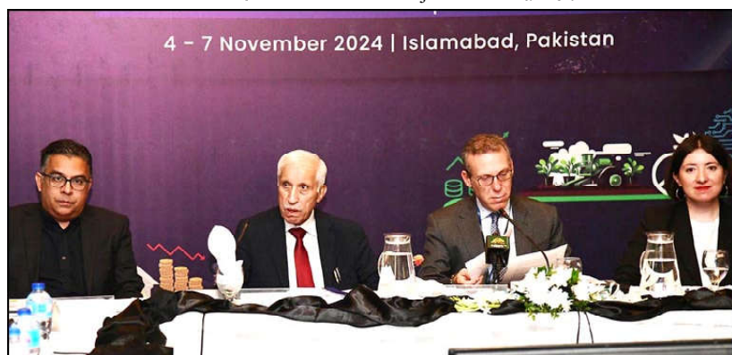
ISLAMABAD: Federal Minister for Maritime Affairs Qaiser Ahmed Shaikh chairing a session of Sustainable Development Conference.

Noting that fake news and misinformation undermine trust in the United Nations, especially in the context of rising geopolitical tensions, ongoing genocidal war in Gaza and climate threats, he called for a "sustained communications campaign" by the Department of Global Communications (GDC), in collaboration with Member States, to highlight the UN's achievements and contributions.