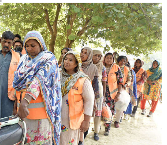
ISLAMABAD: A women sanitary worker provide biometric verification for attendance at sector G-7, in the Federal Capital. Capital Development Authority (CDA) has decided to extend biometric attendance system outside for sanitary workers.