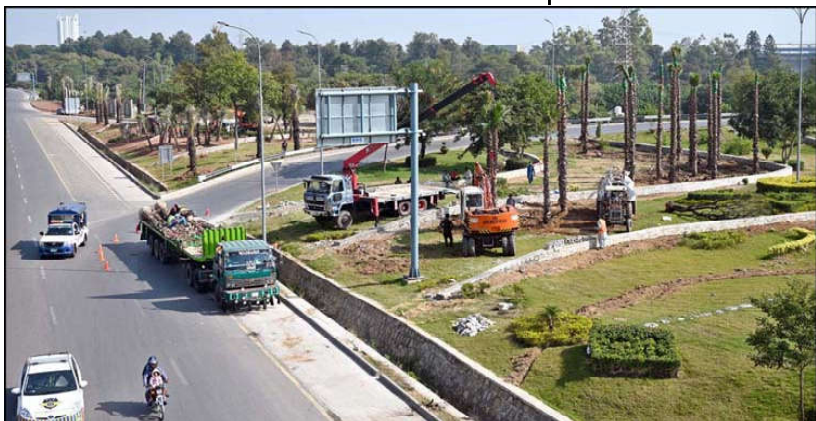
ISLAMABAD: CDA workers busy planting large trees at greenbelt along the 6th Avenue Underpass, Srinagar Highway in the Federal Capital.