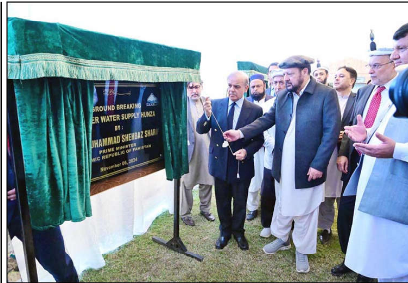
GILGIT: Prime Minister Muhammad Shehbaz Sharif unveils the plaques of groundbreakings and inaugurations of various development projects in Gilgit Baltistan.

participants raised various questions concerning the province, including the situation in the newly merged districts, issues related to higher education, natural resources, and other important matters. In his remarks, Governor Faisal Karim Kundi highlighted the unique position of Khyber Pakhtunkhwa due to its geographical location, especially its proximity to the Afghanistan border. "The province of Khyber Pakhtunkhwa is distinct from other provinces due to its location along the Afghan border," said Kundi.