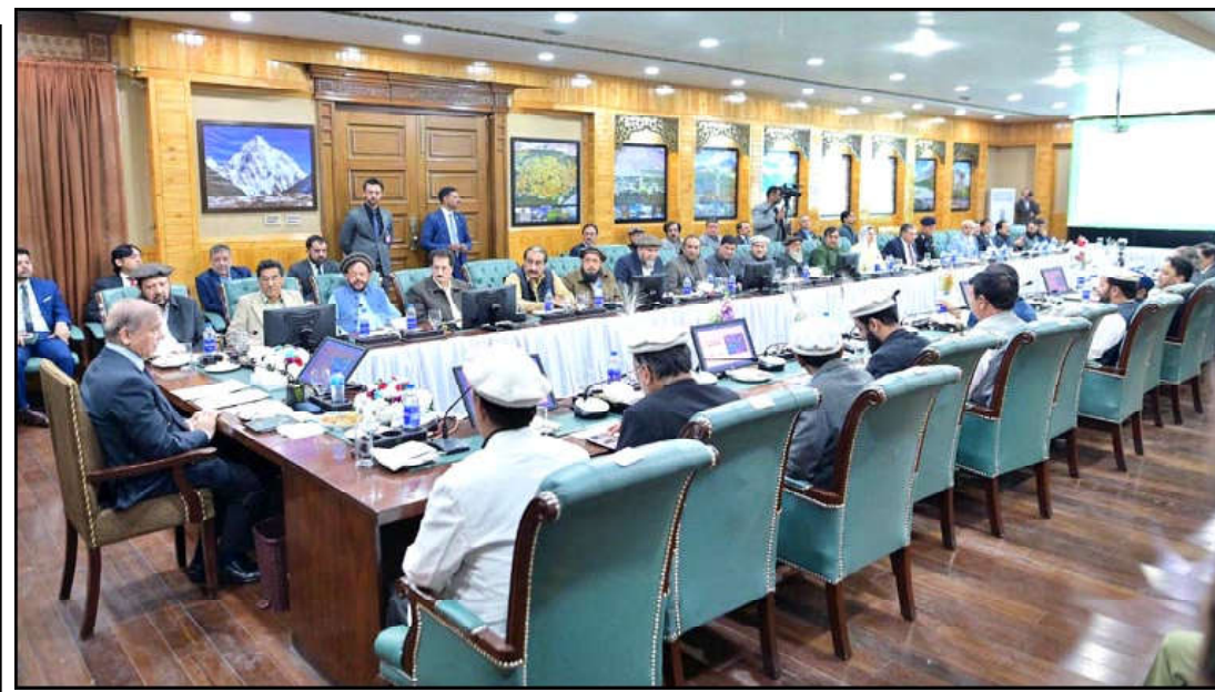
GILGIT: Prime Minister Muhammad Shehbaz Sharif chairs a special meeting of the Gilgit Baltistan Cabinet.