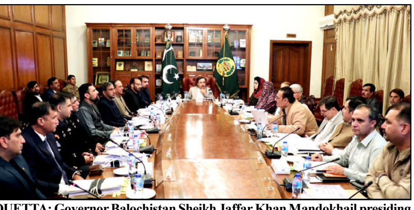
QUETTA: Governor Balochistan Sheikh Jaffar Khan Mandokhail presiding over meeting of Board of Governor of Cadet Colleges.

cation and health sectors. Earlier, in her address, Punjab Chief Minister Maryam Nawaz said the canal project would bring about prosperity in Balochistan besides enhancing coordination and closeness among the provinces. She said the credit for all mega public welfare projects like motorways, youth scholarships, modern transport facilities including Orange Line, Metro or Speedo buses and student bikes went to the PML-N governments.