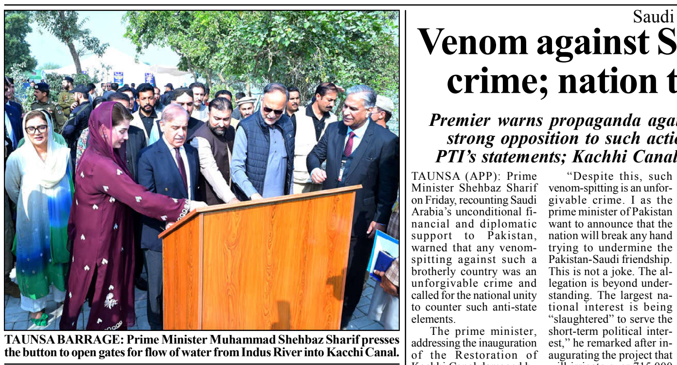
TAUNSA BARRAGE: Prime Minister Muhammad Shehbaz Sharif presses the button to open gates for flow of water from Indus River into Kacchi Canal.

Ph: 2841470/2841473 Vol: XIX No. 259, Jamaadi ul Awwal 20, 1446 AH Saturday November 23, Pages 04, Price Rs. 15