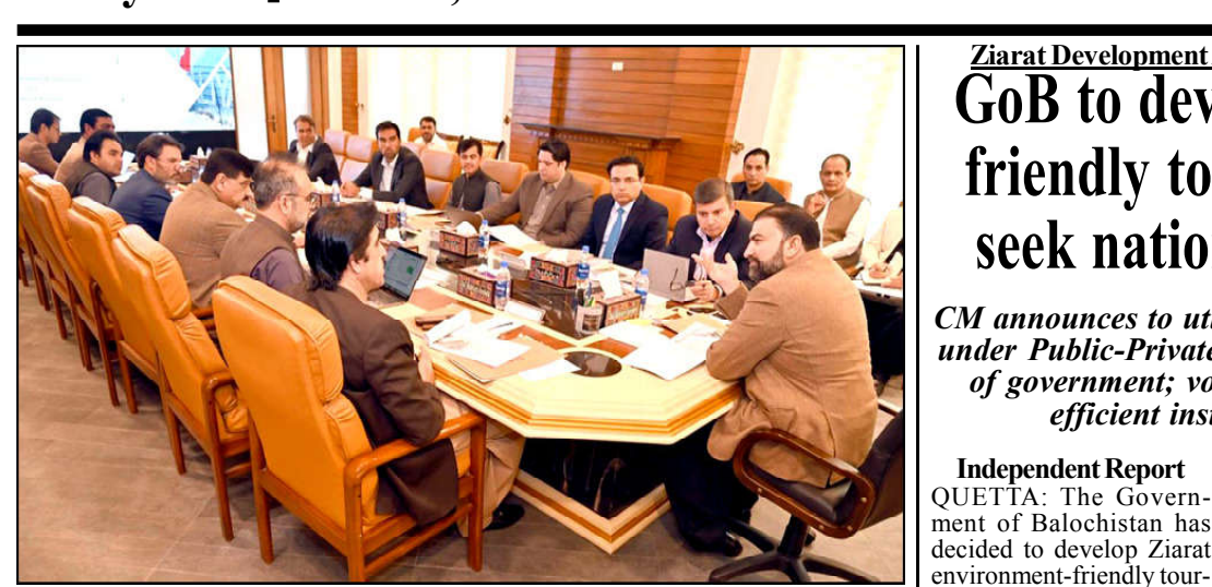
OUETTA: Chief Minister Balochistan Mir Sarfaraz Ahmed Bugti presiding over meeting of Ziarat Development Authority.