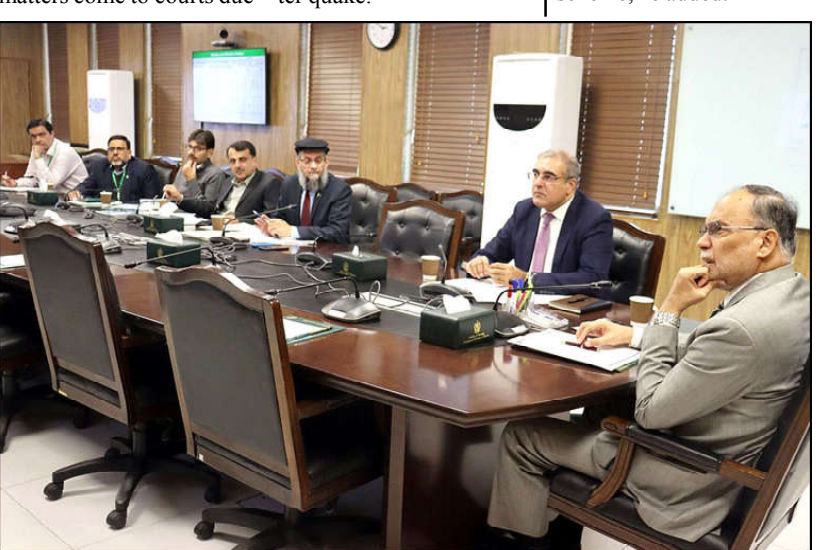
ISLAMABAD: Federal Minister for Planning, Development, and Special Initiatives Ahsan Iqbal chairing a review meeting to assess the progress of Public Sector Development Program (PSDP) projects for 2024-25.

This reduction will provide a relief of Rs. 14,000 for each of the 89,605 pilgrims traveling under the government's