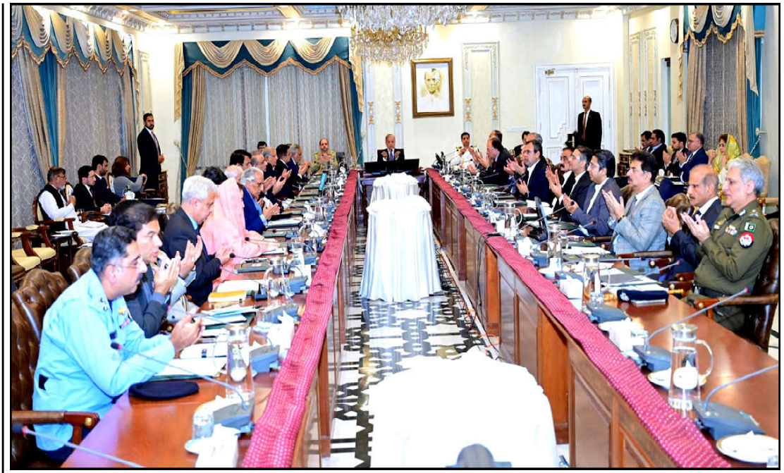
ISLAMABAD: Prime Minister Muhammad Shehbaz Sharif chairs the Federal Cabinet Meeting

In twin cities, the prime minister said the life was paralyzed. In the larger context, the economic losses were manifolds, the country's stock exchange market which had crossed the historic mark of 99,000 points few days back, lost 4,000 points in one day due to chaos.