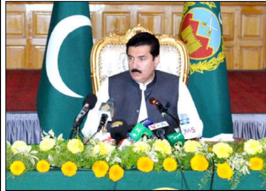
PESHAWAR: Governor Khyber Pakhtunkhwa, Faisal Karim Kundi addressing a press conference at Governor House.

province, ensuring smooth ordinary citizens. She conveyed her transportation and public sincere apologies for the mobility.She emphasized importance of inconvenience, stating,"I am facilitating the daily routines of the citizens, truly saddened by the suffering the people have who had been facing had to endure due to these disturbances