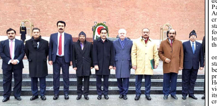
MOSCOW: Speaker National Assembly along with delegation at near Wall of Kremlin Moscow after laying wreath at the tomb of Unknown Soldier.

common men must benefit from the resources allocated for health sector. He on the occasion warned that stern action would be taken against those creating hurdles in way of reforms in the province.