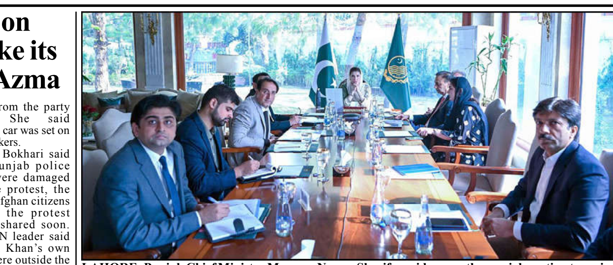
LAHORE: Punjab Chief Minister Maryam Nawaz Sharif presides over the special meeting to review progress on IT City.

Gandapur's car was set on fire by workers. Ázma Bokhari said that 22 Punjab police vehicles were damaged during the protest, the record of Afghan citizens caught in the protest would be shared soon. The PML-N leader said that Imran Khan's own minister said that Bushra children were outside the Bibi escaped from the country, while there was protest on Tuesday night, no food available for children of people during