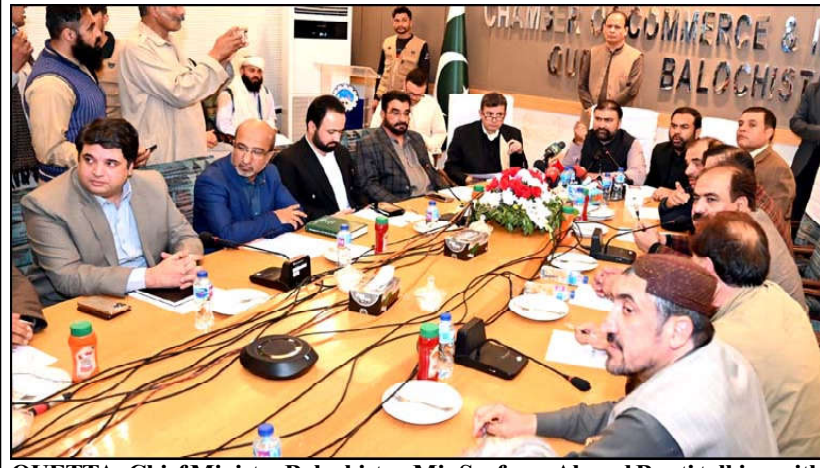
QUETTA: Chief Minister Balochistan Mir Sarfaraz Ahmed Bugti talking with office bearers of Ouetta Chamber of Commerce and Trade during his visit.