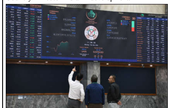
KARACHI: A stockbroker monitors share prices during a trading session at Pakistan Stock Exchange (PSX) in Karachi. The Pakistan Stock Exchange's KSE-100 index gained 1,519.24 points, or 1.55pc, to reach 99,317.47 points.

She added, "The Punjab government is moving forward under a comprehensive plan to attain socio-economic development."