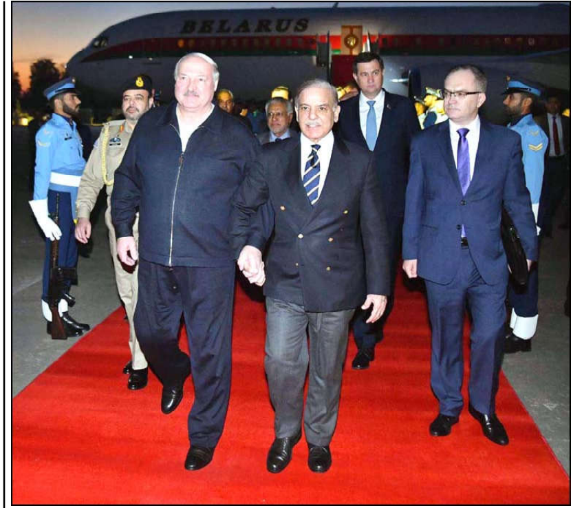
RAWALPINDI: Prime Minister Muhammad Shehbaz Sharif receives President of Belarus Aleksandr Lukashenko at PAF Nur Khan Air Base.