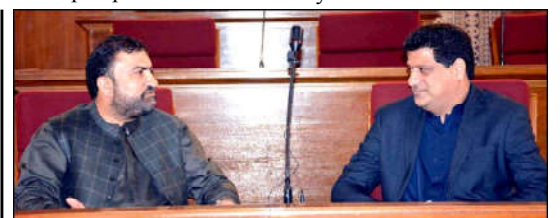
QUETTA: Provincial Minister Mir Zahoor Ahmed Buledi talking with Chief Minister Mir Sarfraz Ahmed Bugti during Balochistan Assembly session

He also extended an offer to export these iconic rickshaws to Belarus, emphasizing their cultural and economic value.