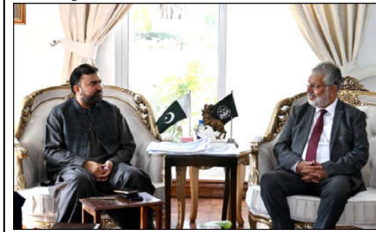
QUETTA: Chairman Higher Education Commission Dr. Mukhtar Ahmed meeting with Chief Minister Balochistan Mir Sarfraz Ahmed Bugti.

The Chief Minister also said that he hail the positive recommendations of the HEC and vowed to put the universities of province on path of improvement together with it (HEC).