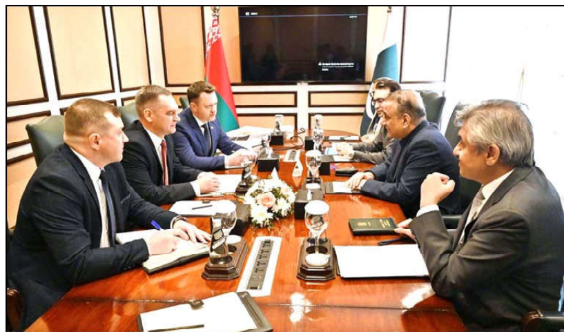
ISLAMABAD: Federal Minister for Communications Abdul Aleem Khan meeting with Minister of Transport and Communications Belarus H.E. Alexey Lyakhnovich.

The minister said that the two countries' exports and trade have a major focus on surgical instruments comprising about 62% of the total exports to Belarus and imports of Belarus tractors and machinery.