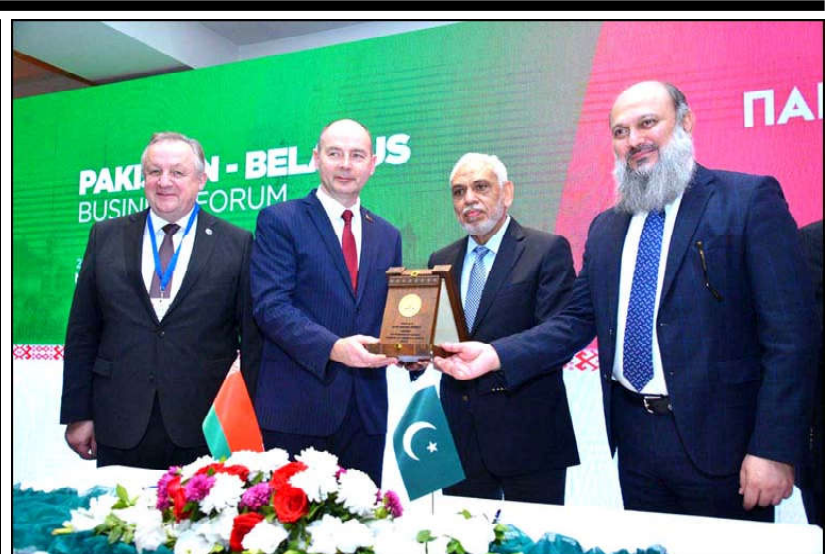
ISLAMABAD: Federal Minister for Commerce Jam Kamal Khan presents a souvenir to Belarusian Minister Alexey Kushnarenko during the Pakistan-Belarus Business Forum 2024, where both witnessed the signing of 8 MoUs/Agreements.

Misguided and the occurrence of illogical and violent incidents every day has become the manifesto of PTI, he said.