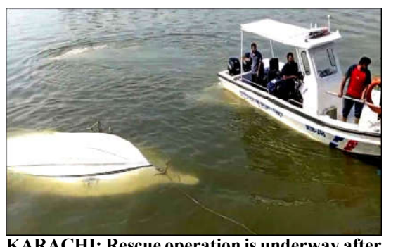
KARACHI: Rescue operation is underway after boat overturned into deep waters, near Ibrahim Hyderi in Karachi.

Azma Bokhari condemned continued violence by "Tehreek-e-Fasad" on the second day of unrest, which included torching police vehicles and attacking officers.