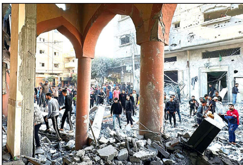
Palestinians inspect the site of an Israeli strike on a mosque at Nuseirat refugee camp, in central Gaza Strip.

In response Iran submitted "a protest note" to the Russian Foreign Ministry condemning the "violent treatment of the Iranian students by the police", IRNA said. Iran, a close ally of Russia, has requested "explanations" for the incident. The two students were released late on Friday following interventions by the consulate.