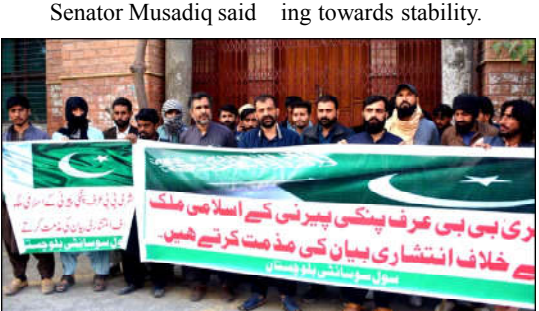
QUETTA: Activists of Civil Society hold a protest against former prime minister Imran Khan's wife, Bushra Bibi, comments allegedly implicating Saudi Arabia in his government's ouster.

in the past our security forces had initiated successful operations like Zarab-e-Azab and eliminated terrorist networks from our soil and terrorists had fled away but when PTI took over the reins of power in KP they brought all terrorist elements back to our soil. He said terrorists were involved in killing of miners, innocent people in tribal areas of the Khyber Pakhtunkhwa and PTI is responsible of all these terrorist incidents. Senator Musadiq Malik said PTI wanted to storm the capital and at that time when foreign leaders are coming to Pakistan. The aim of this agitative step is to bring bad name for Pakistan, Musadiq Malik said and warned no one would be allowed to harm Pakistan's stability. Petroleum minister said Pakistan had overcome economic crisis and heading towards stability.