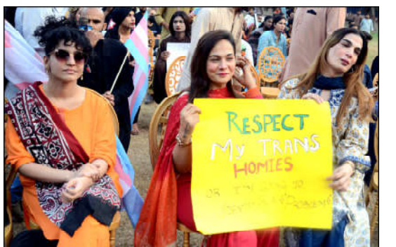
HYDERABAD: Transgender community (gathered from all over Sindh) celebrating their annual function Moorat March, demanding equality, protection and creating the opportunities in public and private sectors for betterment in their lifestyle, in the city.