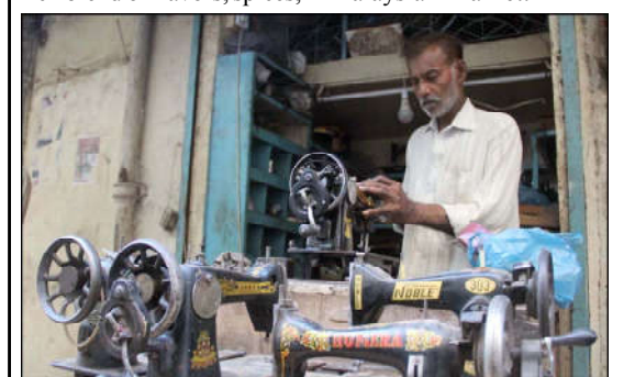
KARACHI: A mechanic busy in repairing sewing machine at his workplace in the Provincial Capital.