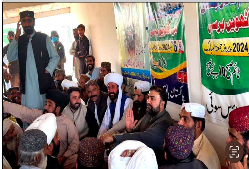
SUI: Chief Minister Balochistan Mir Sarfaraz Ahmed Bugti talking with tribal elites and different delegations.

Police conducted raids throughout the night to detain PTI workers, resulting in the arrest of over 170 activists from various areas. Prisoner transport buses have been brought into the city to manage detainees. Emergency measures have been implemented in hospitals, and rescue agencies have been put on high alert. Additionally, mobile internet services have been suspended in Rawalpindi, Islamabad, and Attock to prevent the spread of protest-related information.