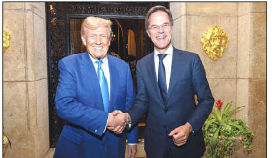
US president-elect Donald Trump shakes hands with Nato Secretary General Mark Rutte in Palm Beach, Florida.

statute if needed, but Hungarian Prime Minister Viktor Orban has invited Netanyahu to visit his country, assuring him he would face no risks if he did so. "The states that signed the Rome convention are obliged to implement the decision of the court. It's not optional," Josep Borrell, the EU's top diplomat, said during a visit to Cyprus for a workshop of Israeli and Palestinian peace activists. Those same obligations were also binding on countries aspiring to join the EU, he said. "It would be very funny that the newcomers have an obligation that current members don't fulfill," he said.