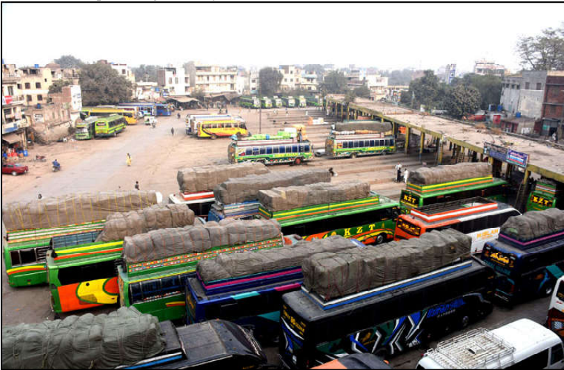
LAHORE: Buses loaded with goods stationed at the lorry stand due to the closure of the Motorway, Ring Road, due to the PTI's Islamabad rally in the provincial capital.