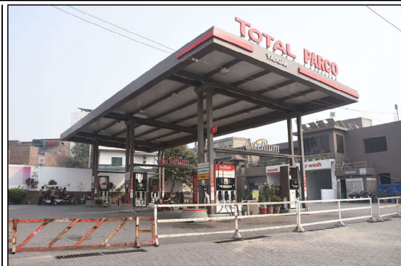
LAHORE: Petrol Pump on Ravi Road closed due to ongoing protest.

In a statement issued here, he said the region holds tremendous potential for trade, energy projects and connectivity initiatives like the China-Pakistan Economic Corridor (CPEC) and the Trans-Afghanistan Pipeline. He said such mega ventures require stability and cooperation, making it imperative for both states to prioritise trust and dialogue bringing an end to perpetual menace of terrorism.