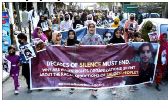
QUETTA: Relatives of missing persons hold a rally of the release of their love ones at Adalat road.

Independent Report QUETTA: The Governor Balochistan, Sheikh Jaffar Khan Mandokhail has directed to the Chief Executive Officer of Quetta Electric Supply Company (QESCO) to ensure electricity supply with full voltage to the consumers of Zhob Division. He also directed to stop the unannounced load shedding of electricity in the Division just because the good consumers paying bills on regular basis have also become fed up of the situation. He also directed to the high ups of WAPDA to improve their official timing and behave well with all the consumers.