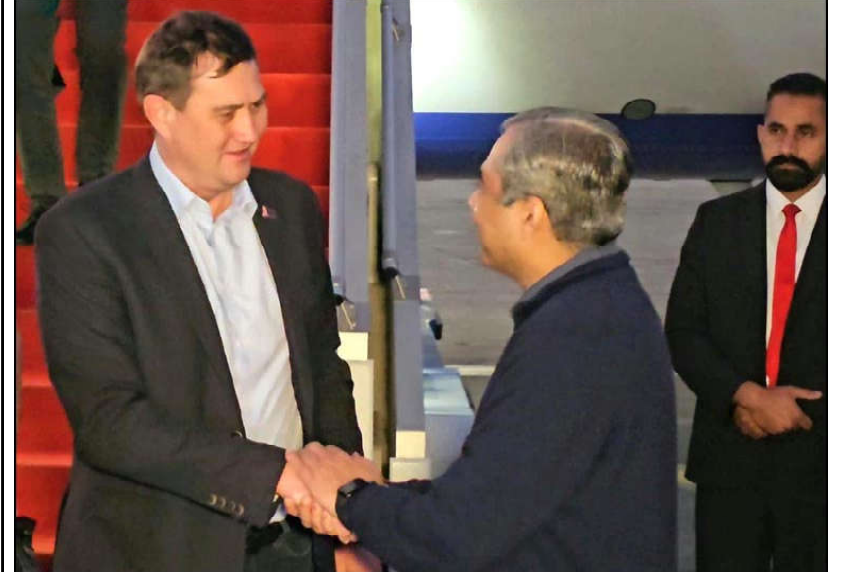
ISLAMABAD: Federal Minister for Interior Mohsin Naqvi receiving High Level Belarusian delegation on their arrival.