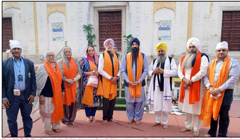
LAHORE: Punjab Minister for Minority Affairs Ramesh Singh Arora in a group photo with Sikh community at Dera Sahib Gurdwara.

He emphasized that societies and nations move forward when women are empowered and allowed to thrive in all areas of life. Governor Kundi said that the elimination of violence against women is not merely an aspiration but a fundamental necessity for the development of any society. He acknowledged that true progress is achieved when women are treated as equal participants in economic, political, and social spheres. In his message, the Governor highlighted that the silence around violence must be broken and that the systemic norms which perpetuate such abuse need to be challenged.