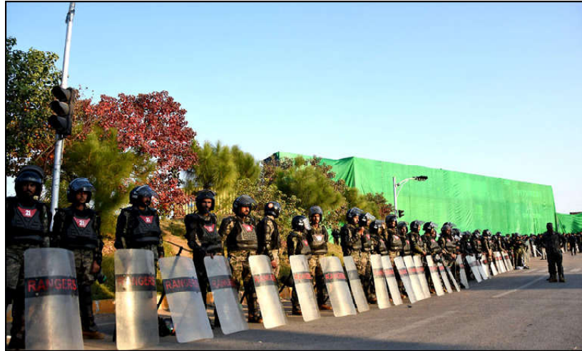
ISLAMABAD: Paramilitary soldiers alert at the D-Chowk in the Federal Capital ahead of PTI protest in the Federal Capital.

Ph: 2841470/2841473 Vol: XIX No. 260, Jamaadi ul Awwal 22, 1446 AH Monday November 25, Pages 04, Price Rs.15