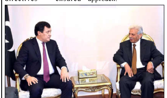
ISLAMABAD: The Deputy Foreign Minister of Kazakhstan, Alibek Bakayev, meets with Federal Minister for Industries and Production Rana Tanveer Hussain.

This success is the result of Federal Minister Jam Kamal Khan's forward-thinking approach.