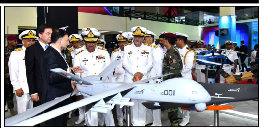
Chief of the Naval Staff Admiral Naveed Ashraf being briefed at a stall during IDEAS 2024.

Addressing the conference, Advisor to Chief Minister for Climate Change stressed the need to formulate world climate financial framework for meeting the requirements of weak countries as we are standing at an important