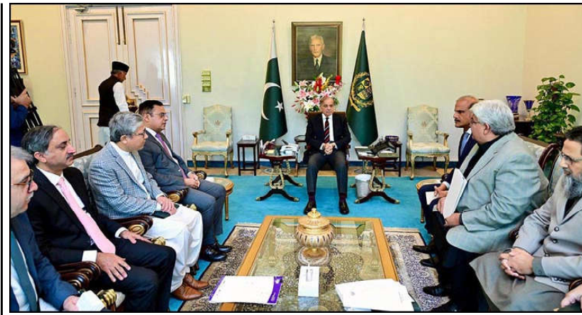
ISLAMABAD: Prime Minister Muhammad Shehbaz Sharif in a meeting with FBR officials to appreciate their performance for Sales Tax fraud detection.

He said Ethiopia offered a comparative advantage to the Pakistani investors in terms of strategic location, cheap, clean and green energy, skilled labour, and on top of that full-fledged support from the Government.