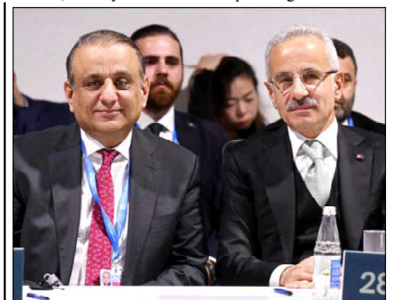
BAKU: Turkish Minister of Transport and Infrastructure, Abdulkadir Uraloğlu with Federal Minister Communications, Abdul Aleem Khan on the eve of COP29.

A letter was written to NA speaker on November 01 regarding this violation by Bilawal Bhutto Zardari.