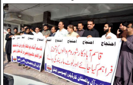
HYDERABAD: Members of All Pakistan Car Dealers Association are holding protest demonstration for demanding protection, in Hyderabad.