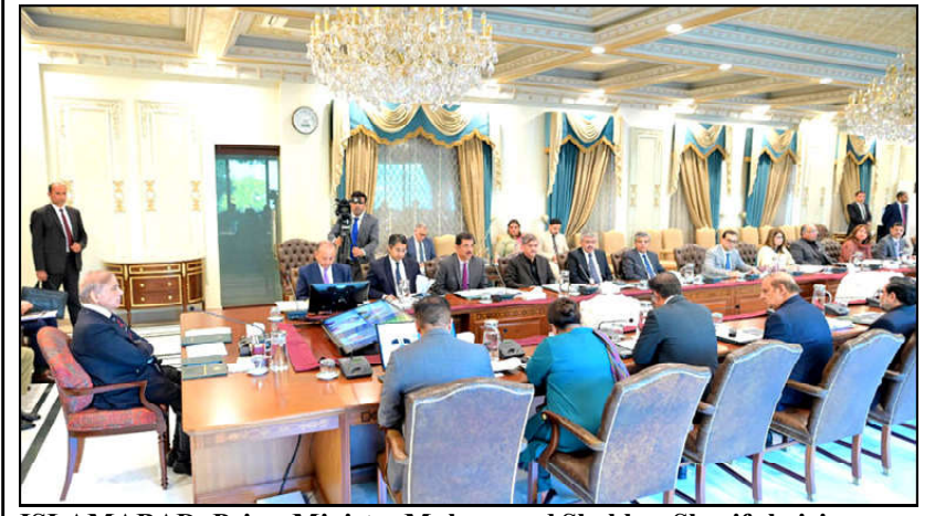
ISLAMABAD: Prime Minister Muhammad Shahbaz Sharif chairing a review meeting of the Public Procurement and Good Governance.

The president, in a statement, expressed grief over the loss of precious lives in the incident and called it a coward and inhumane act.