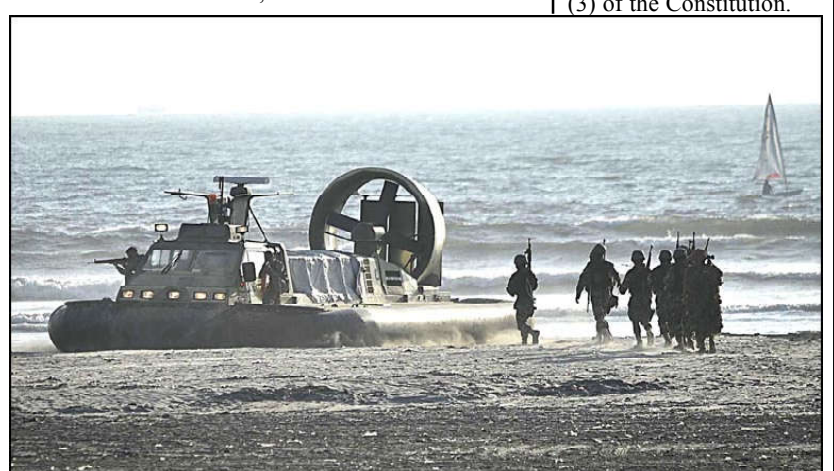
KARACHI: A view of Counter-terrorism exercise during ongoing International Defence Exhibition and Seminar (IDEAS) 2024.