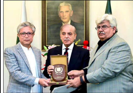
curbing the tax evasion, according to a PM Office press release.

It was told that under the sales tax fraud, Rs370 million were also transferred