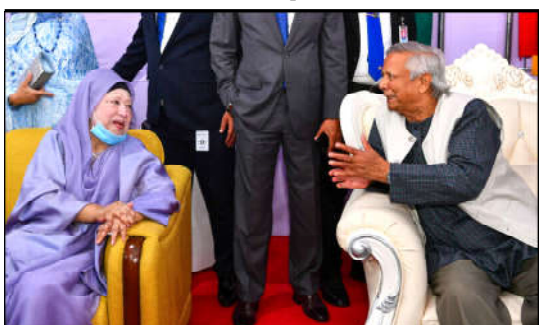
Chief adviser of Bangladesh's interim government Muhammad Yunus with former premier and Bangladesh Nationalist Party chairperson Khaleda Zia at a reception in Dhaka, Bangladesh.