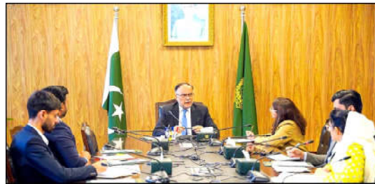
ISLAMABAD: Federal Minister for Planning, Development, and Special Initiatives, Ahsan Iqbal, chaired a high-level meeting to review the identification of locations for Model Special Economic Zones (SEZs) and the policy framework for relocating Chinese industries to Pakistan.

Stressing the need to enhance G2G (government-to-government) joint cooperation with China, he said