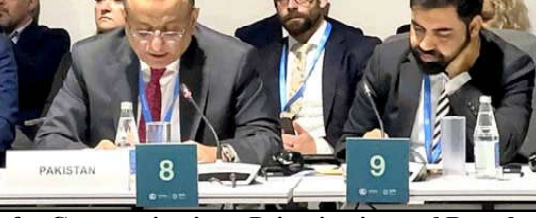
BAKU: Federal Minister for Communications, Privatization and Board of Investment, Abdul Aleem Khan during the COP29 in Baku.

He said that several projects of improvement in manpower as well as the Benazir Bhutto Scholarship Programme and Youth Skills Development Programme have been implemented, which would help end the sense of deprivation in the province.