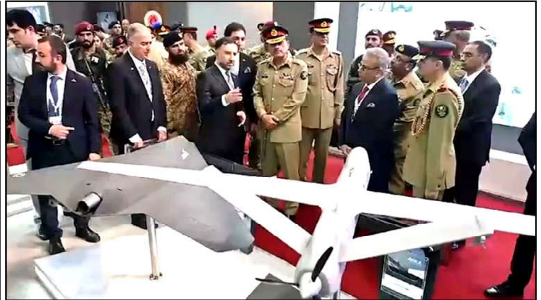
KARACHI: General Syed Asim Munir, NI (M) Chief of Army Staff (COAS), visiting the International Defence Exhibition and Seminar (IDEAS-2024) at the Karachi Expo Centre.

During the visit, the COAS commended the active participation of defense manufacturers from friendly nations and observed an impressive display of arms and equipment by both domestic and international exhibitors, said an Inter Services Public Relations (ISPR) news release.