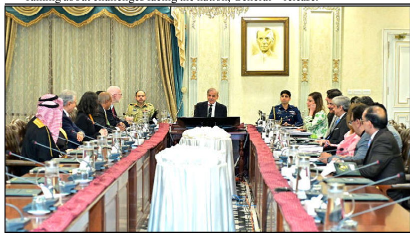
ISLAMABAD: A delegation of Polio Oversight Board meeting with Prime Minister Muhammad Shahbaz Sharif.