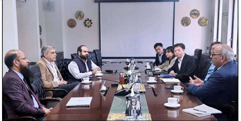
ISLAMABAD: A Delegation from China Geological Survey (CGS) Calls on Secretary Petroleum to Bolster Geoscientific Collaboration.