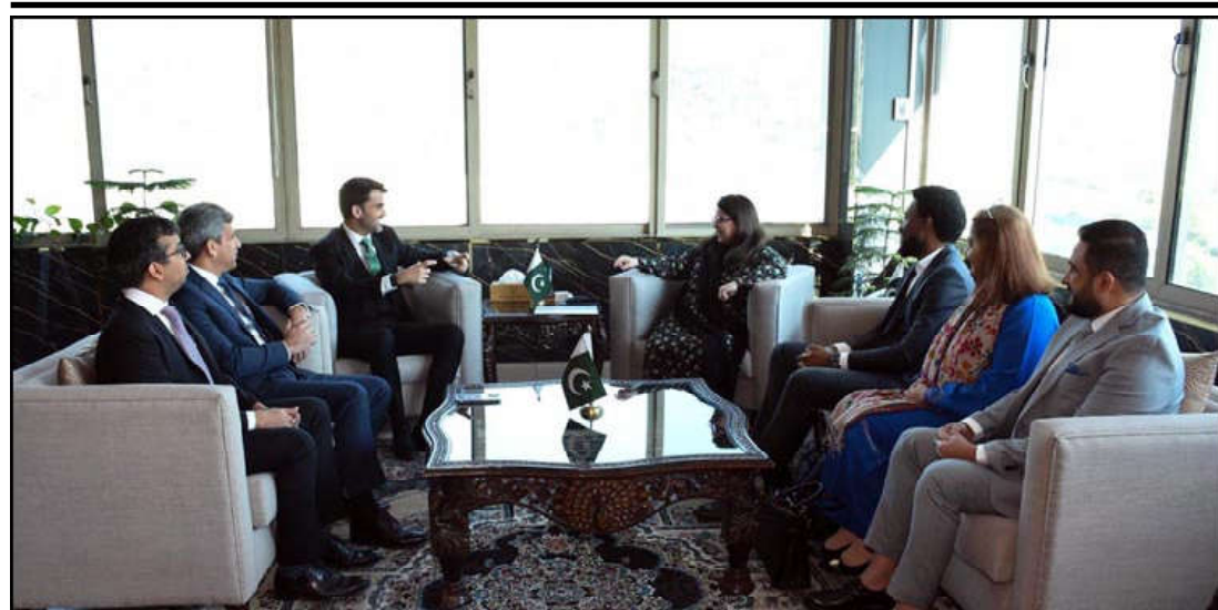
ISLAMABAD: Minister of State for IT and Telecommunication Ms. Shaza Fatima Khawaja in a meeting with TikTok delegation.