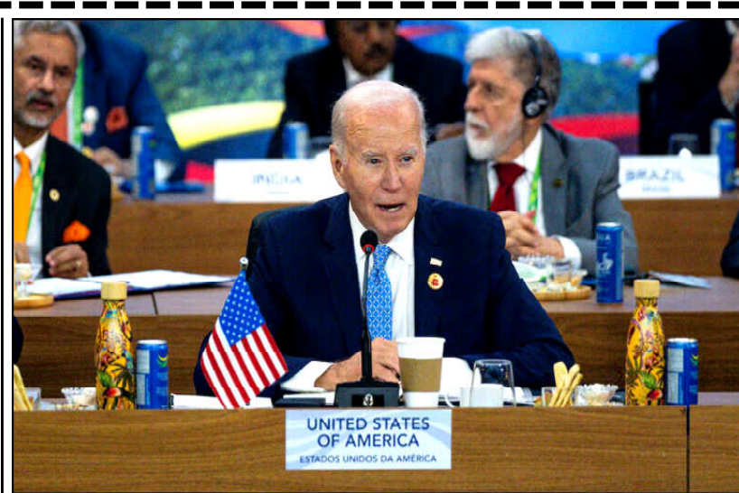
US President Joe Biden delivers remarks during an event launching the Global Alliance Against Hunger and Poverty at the G20 Summit at the Museum of Modern Art in Rio de Janeiro, Brazil.

"prepared to declare a national emergency and will use military assets to reverse the Biden invasion through a mass deportation programme."