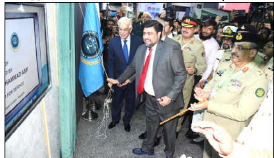
KARACHI: Federal Minister for Defense Khawaja Asif along with Governor Sindh Kamran Khan Tessori inaugurating IDEAS 2024 Exhibition at NRTC Pavilion.

The participants posed different questions about the law and order situation, development projects, political stability as well as the measures taken by the government against the terrorism and narcotics in the province.