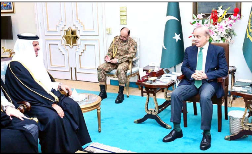
ISLAMABAD: Deputy Interior Minister of Saudi Arabia H.E. Dr. Nasser bin Abdul Aziz Al Dawood calls on Prime Minister Muhammad Shehbaz Sharif.