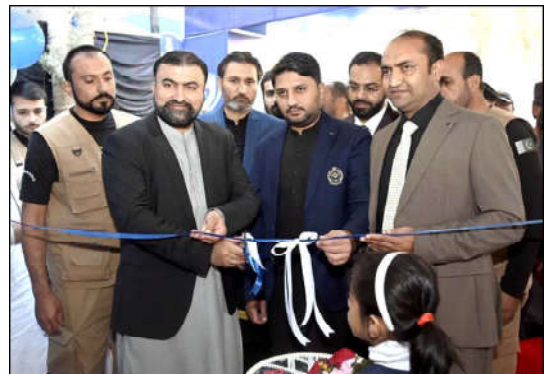
QUETTA: Chief Minister Balochistan Mir Sarfraz Ahmed Bugti inaugurating Sciences and Art Exhibition at Jinnah Elite School.

He said that someone among the students would become Chief Minister and Education Minister in future and added that we have lot of expectations from the future builders. He said that there's no denying the fact that our future is in safe and capable hands because of the talented and diligent youth like you, as he spoke to the students participated in the science and art exhibition.