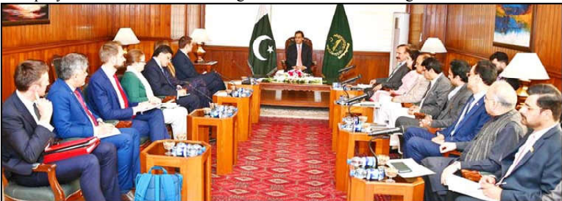
ISLAMABAD: Speaker National Assembly Sardar Ayaz Sadiq in a meeting with Minister/Parliamentary Under-Secretary of State at Foreign, Commonwealth & Development, United Kingdom Mr. Hamish Falconer along with delegation at Parliament House.

and it has always strived for regional peace. He also highlighted initiatives of the Parliament, namely the Sustainable Development Goals (SDGs) Secretariat established in 2014, which actively works toward achieving sustainable development goals in Pakistan. Additionally, he mentioned the establishment of a parliamentary caucus to protect the rights of women and children, playing a vital role in addressing discrimination against women and promoting gender equality. Furthermore, the Speaker underscored Pakistan's minimal contribution to global greenhouse gas emissions while being one of the most affected countries by climate change. He called for greater international collaboration to address this pressing challenge.