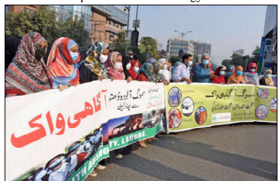
LAHORE: Participants hold a banner during smog awareness campaign walk at Liberty chowk, in the Provincial Capital.