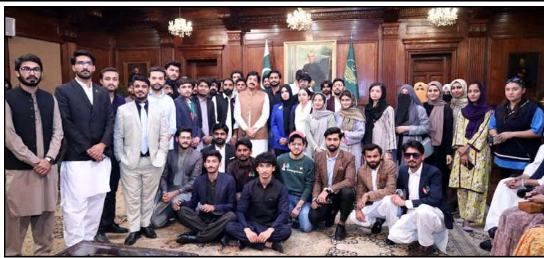
LAHORE: A delegation of Punjab University students in a group photo with Governor Punjab/Chancellor, Sardar Saleem Haider Khan at Governor House.