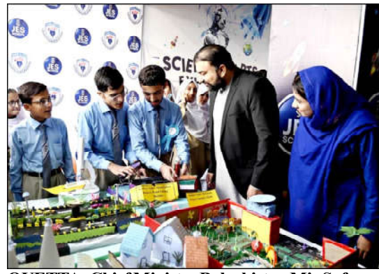
QUETTA: Chief Minister Balochistan Mir Safaraz Ahmed Bugti visiting stalls at Sciences and Art Exhibition in Jinnah Elite School.