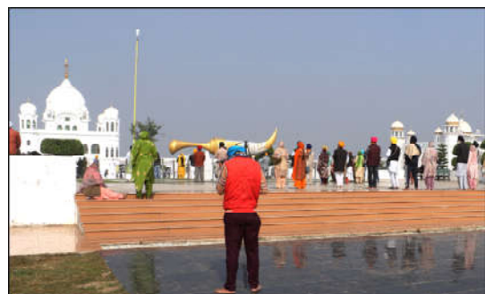
KARTARPUR: Sikh pilgrims pay their respect during celebrations marking the birth anniversary of Guru Nanak, founder of Sikhism, at the Gurdwara Darbar Sahib in Kartarpur near the India-Pakistan border.