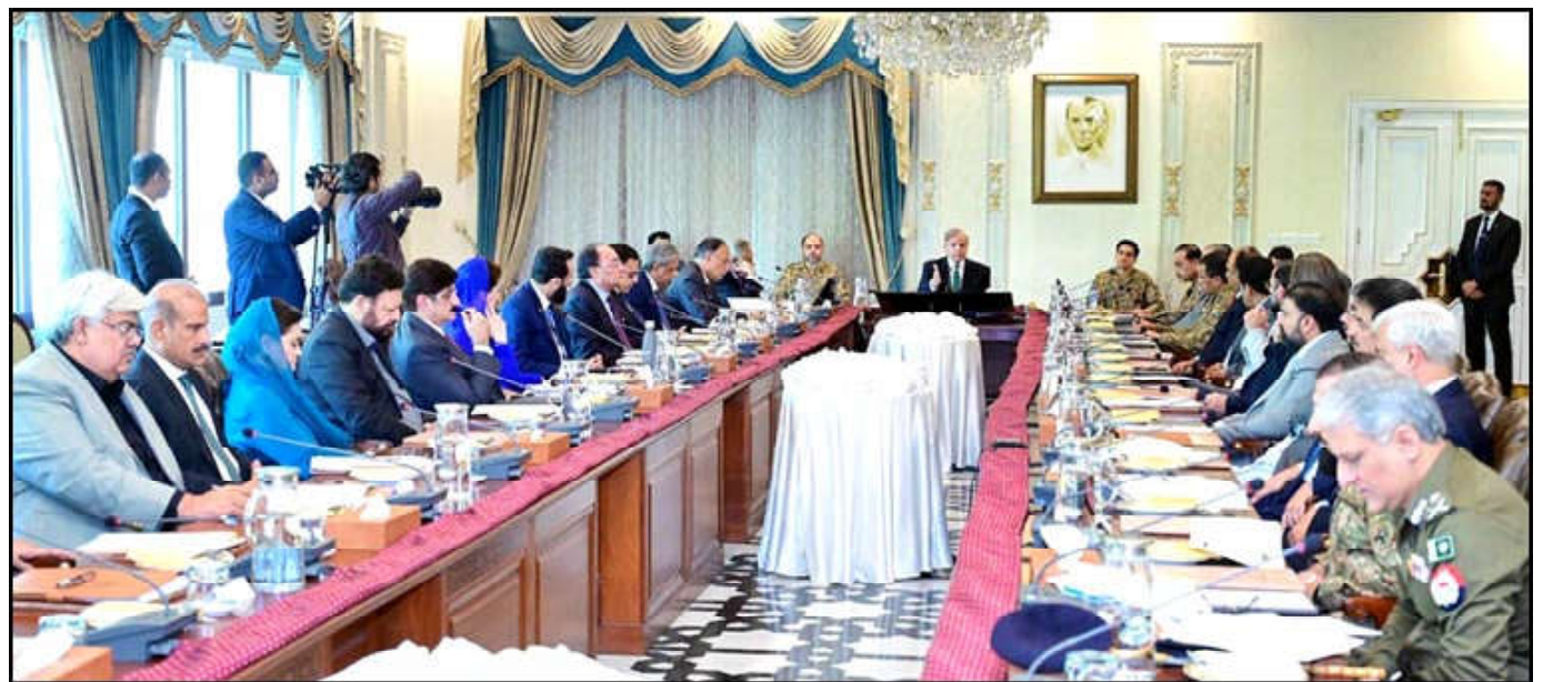
ISLAMABAD: Prime Minister Muhammad Shehbaz Sharif chairs a meeting of Federal Apex Committee of National Action Plan.

The member of provincial assembly belonging to National Party, Mir Rehmat Saleh Baloch pointed out that a worker of his party (NP) was murdered in Bhag, and maintained that the government has failed to maintain law and order situation in the province.