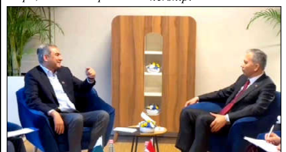
ISLAMABAD: Federal Minister for Interior Mohsin Naqvi in a meeting with the Interior Minister of Turkiye Ali Yerlikaya.

ISLAMABAD (APP): In a significant diplomatic meeting, Interior Minister Mohsin Naqvi on Friday met with Turkish Interior Minister Ali Yerlikaya and discussed matters of mutual interests, focusing on enhancing the historic relationship between the two nations. The meeting, held during Minister Naqvi's visit to Turkey, covered a wide range of topics, including regional security, economic partnerships, and the repatriation of Pakistani prisoners currently held in Turkey. The discussion revolved around strengthening Pakistan-Turkey relations, which both leaders described as deeply rooted in shared history, culture, and religion. Minister Naqvi praised the enduring brotherhood between the two countries, noting that their collaboration is steadily evolving into a sustainable strategic partnership.