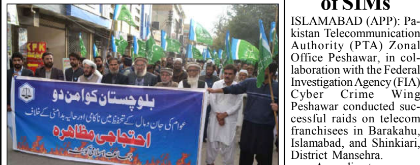
QUETTA: Activists of Jamat-e-Islami (JI) are holding protest demonstration for demanding peace in Balochistan, at Quetta press club.