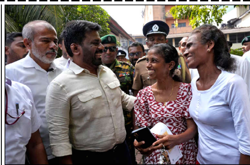
Sri Lanka's President and National People's Power (NPP) party leader Anura Kumara Dissanayake meets his party supporters after casting his vote on the day of the parliamentary election in Colombo, Sri Lanka.