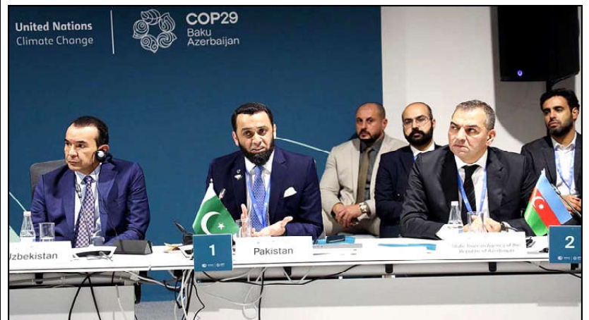
BAKU: Mr. Attallah Tarar, Federal Minister for Information and Broadcasting, National Heritage and Culture delivering a speech at high-level Ministerial Dialogue.