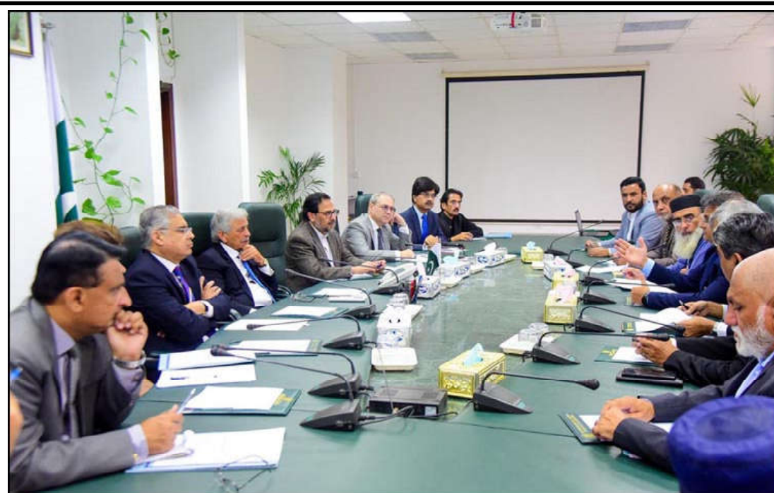
ISLAMABAD: The Federal Minister for Industries and Production Rana Tanveer Hussain chairs meeting of the Fertilizer Review Committee (FRC).