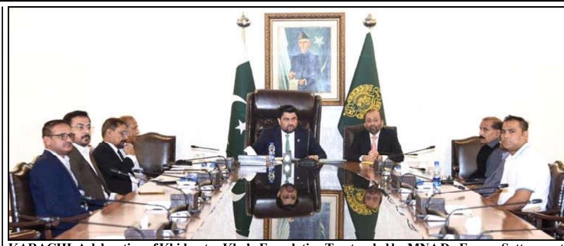
KARACHI: A delegation of Khidmat-e-Khalq Foundation Trustees led by MNA Dr. Feroq Sattar meeting with Governor Sindh Kamran Khan Tessori.