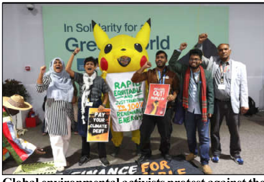
Global environmental activists protest against the gas industry during the United Nations Climate Change Conference (COP29), in Baku, Azerbaijan.

BEIJING: Chinese President Xi Jinping on Thursday inaugurated Latin America's first Beijing-funded port in Chancay, Peru — a symbol of the Asian superpower's growing influence on the continent as it prepares to face off with a new Donald Trump administration. The $3.5 billion complex, about 50 miles (80 kilometres) north of Lima, is meant to serve as a hub for Chinese trade as the country is under threat of major tariff hikes once Trump reenters the White House for a second term. The port was officially opened in a ceremony overseen virtually by Xi and Peruvian counterpart Dina Boluarte from Lima, where they will attend an Asia-Pacific Economic Cooperation (APEC) summit on Friday and Saturday. "China plays a major role in the growth of our economy," Boluarte said at the event, even as a US official warned Latin American nations should be vigilant on Chinese investment.