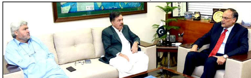
ISLAMABAD: Governor Balochistan Sheikh Jaffar Khan Mandokhail meeting with Federal Minister for Planning and Development Ahsan Iqbal. MNA Jamal Shah Kakar is also present.