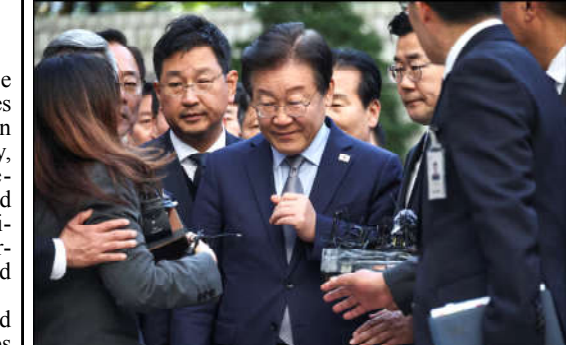
South Korea's main opposition Democratic Party leader Lee Jae-myung arrives at a court in Seoul, South Korea.

WASHINGTON: US President-elect Donald Trump said on Thursday that his administration will work hard to end the Russia-Ukraine war, adding that the conflict needs to come to an end. "We're going to work on the Middle East, and we're going to work very hard on Russia and Ukraine. It's gotta stop." Russia and Ukraine's "gotta stop," Trump said at a gala for the America First Policy Institute at the Mar-a-Lago Club in Florida. "I saw a report today. Thousands of people over the last three days were killed. Thousands and thousands were killed. They happened to be soldiers, but whether they're soldiers or they're people sitting in towns, we're going to work it," he added. Turning to his election victory last week, Trump said the American people delivered "something very, very amazing." "The biggest political victory in 129 years... We swept all swing states. We won the popular vote," he said. He stressed that the country is "doing good" since he was elected on November 5. "Now the only thing is, Mr. Speaker, I think it's important, maybe you should pass a bill—you have to start my term from November 5, OK? Or November 6 if you want. November 5, because the market's gone through the roof, enthusiasm's doubled in the last short while," he said.