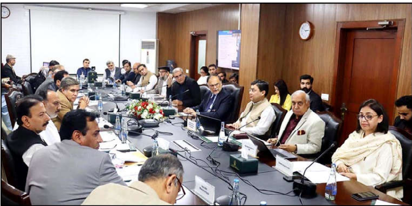
ISLAMABAD: Minister for Planning, Development, and Special Initiatives (PDSI) and Deputy Chairman of the Planning Commission Ahsan Iqbal chaired the Central Development Working Party (CDWP) meeting and approved three major development projects worth Rs. 58.857 billion.