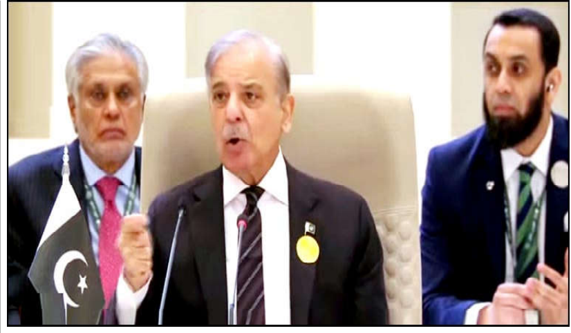
RIYADH: Prime Minister Muhammad Shehbaz Sharif addressing an Arab-Islamic Extraordinary Summit. Deputy Prime Minister and Foreign Minister Ishaq Dar and Information Minister Attaullah Tarar are also present

Prime Minister Sharif further said after decades of sufferings and oppression, the spirit of resistance of the Palestinians remained unbridled and flames of defiance burnt brighter even under the re-