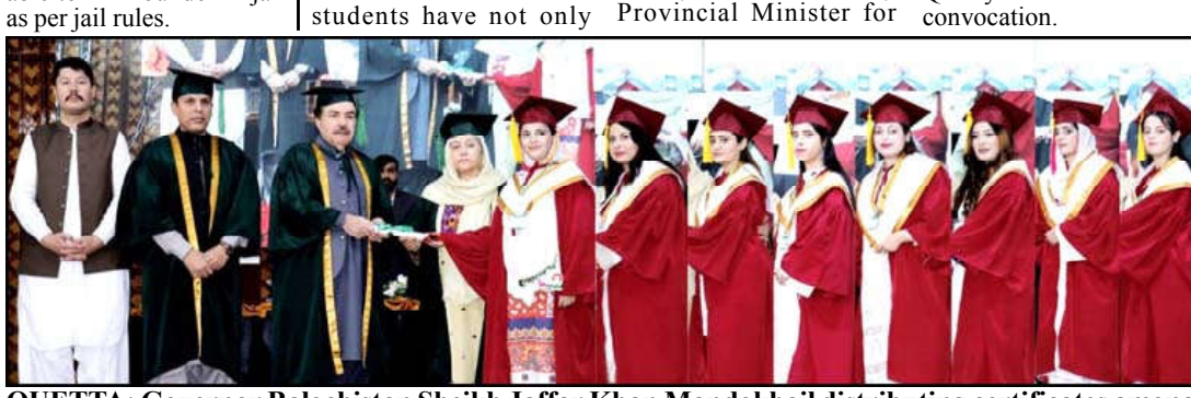
QUETTA; Governor Balochistan Sheikh Jaffar Khan Mandokhail distributing certificates among students during 1st Convocation of Govt. Girls Degree College Querry Road Quetta.

The Governor congratulated the young female graduates on their successful graduation from the Girls College Quarry road in its first ever