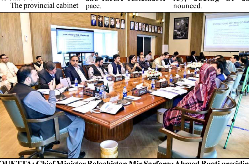
OUETTA: Chief Minister Balochistan Mir Sarfaraz Ahmed Bugti presiding over meeting of Provincial Cabinet.

Regarding pilgrim accommodations, the minister stated that applicants selecting double-bed and triplebed options in Makkah will be required to make additional deposits of Rs 220,000 and Rs 75,000, respectively. He said the pilgrims would get an opportunity to pay for Hajj in installments under the Hajj Scheme 2025.