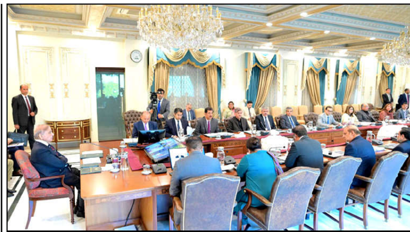
ISLAMABAD: Prime Minister Muhammad Shahbaz Sharif chairing a review meeting of the Public Procurement and Good Governance.