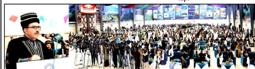
QUETTA: Governor Balochistan Sheikh Jaffar Khan Mandokhail addressing 21st Convocation of University of Balochistan.

The Governor gave away degrees to some 501 students graduated from the University in different disciplines. They were included 25 Ph.D and 27 M.Phil scholars, besides 415 graduates. In all 34 students were also conferred the gold medals in the convocation. Worth mentioning was that a female graduate received her degree from the Governor while carrying her infant child in lap.