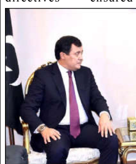
ISLAMABAD: The Deputy Foreign Minister of Kazakhstan, Alibek Bakayev, meets with Federal Minister for Industries and Production Rana Tanveer Hussain.

This achievement highlights leadership of Federal Minister for Commerce, Jam Kamal Khan, whose strategic directives ensured