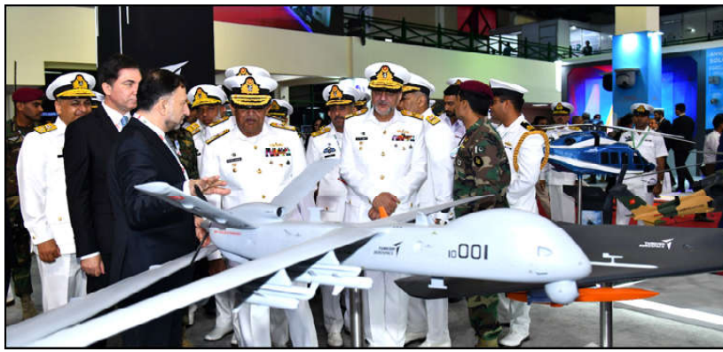
Chief of the Naval Staff Admiral Naveed Ashraf being briefed at a stall during IDEAS 2024.

He said that not only the legislation is being made for coping with the challenge but the climate control programme is also being introduced at the local level, he added.