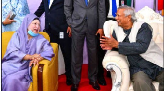
Chief adviser of Bangladesh's interim government Muhammad Yunus with former premier and Bangladesh Nationalist Party chairperson Khaleda Zia at a reception in Dhaka, Bangladesh.

the proposed resolution would have sent a "dangerous message" to Hamas that "there's no need to come back to the negotiating table". Israel has killed nearly 44,000 people in Gaza. Members roundly criticised Washington for blocking the resolution put forward by the Security Council's 10 elected members: Algeria, Ecuador, Guyana, Japan, Malta, Mozambique, South Korea, Sierra Leone, Slovenia and Switzerland. "It is deeply regretted that due to the use of the veto, this council has once again failed to uphold its responsibility to maintain international peace and security," Malta's UN Ambassador Vanessa Frazier said after the vote failed, adding that the text of the resolution "was by no means a maximalist one". "It represented the bare minimum of what is needed to begin to address the desperate situation on the ground," she said.