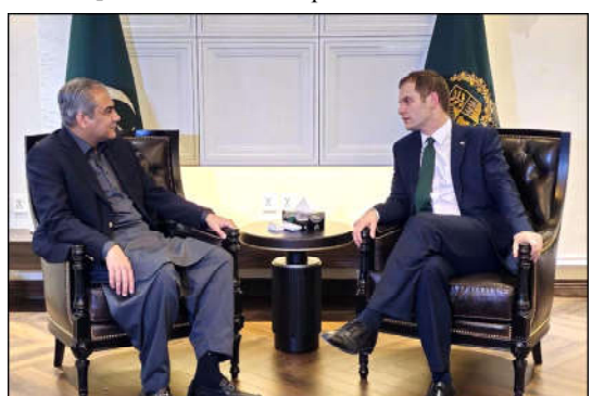
ISLAMABAD: Federal Minister for Interior Mohsin Naqvi in a meeting with British Parliamentary Under-Secretary of State Hamish Falconer.

During the meeting, the prime minister was informed that the review of the PPRA Ordinance and related rules and regulations had been completed, and the amendments would soon be presented to the federal cabinet for approval.