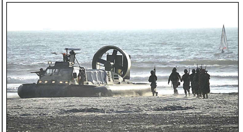
KARACHI: A view of Counter-terrorism exercise during ongoing International Defence Exhibition and Seminar (IDEAS)2024.

He asserted that negotiations would continue, though he expressed doubts about the government's seriousness.