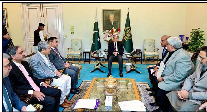
ISLAMABAD: Prime Minister Muhammad Shehbaz Sharif in a meeting with FBR officials to appreciate their performance for Sales Tax fraud detection.

He said Ethiopia offered a comparative advantage to the Pakistani investors in terms of strategic location, cheap, clean and green energy, skilled labour, and on top of that full-fledged support from the Government.