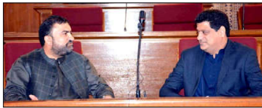
QUETTA: Provincial Minister Mir Zahoar Ahmed Buledi talking with Chief Minister Mir Sarfaraz Ahmed Bugti during Balochistan Assembly session

He also extended an offer to export these iconic rickshaws to Belarus, emphasizing their cultural and economic value.