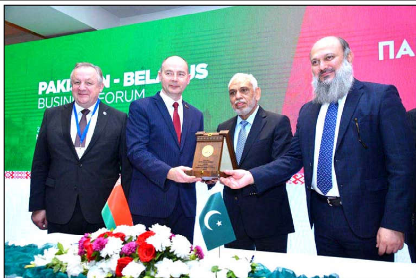
ISLAMABAD: Federal Minister for Commerce Jam Kamal Khan presents a souvenir to Belarusian Minister Alexey Kushnarenko during the Pakistan-Belarus Business Forum 2024, where both witnessed the signing of 8 MoUs/Agreements.

The Senator said that PTI led KP government value their leadership more than human lives. Every protest of Tehreek-e-Insaf takes place under a well-thought-out plan precisely when it happens on the arrival of a friendly head of state, she said.