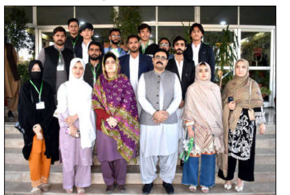
QUETTA: Provincial Education Minister Raheela Hameed Khan Durrani and Health Minister Bakht Muhammad Kakar in a group photo with students of Khuda Bakhsh College during their visit to Assembly.

The prime minister said that whenever the country moved on path of progress, these miscreants resorted to acts of burning and laying siege throughout the country.