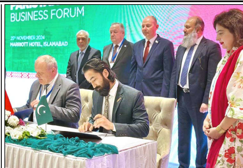
ISLAMABAD: Federal Minister Jam Kamal Khan and Belarusian Minister Alexey Kushnarenko witness the signing of 8 MoUs/Agreements at the Pakistan-Belarus Business Forum 2024.

Rana Tanveer said that around thirty-one companies have issued manufacturing licenses by the Engineering Development Board (EDB) enabling them to produce two/three-wheeler EVs in Pakistan.