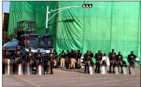
ISLAMABAD: A view of Rangers personnel stand on closed road to PTI protest in twin cities.

Among the injured officers were DSPs Chaudhry Zulfiqar and Shahid Gilani, as well as ASI Tabassum. DSP Zulfiqar suffered significant injuries to his back and legs during the confrontation.