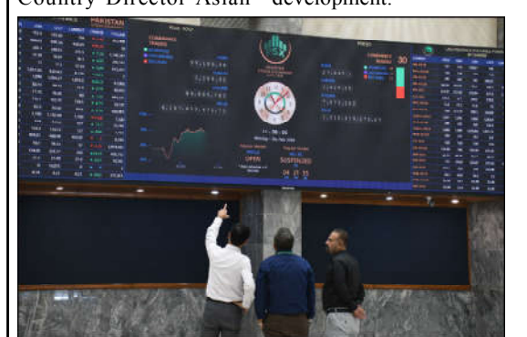
KARACHI: A stockbroker monitors share prices during a trading session at Pakistan Stock Exchange (PSX) in Karachi. The Pakistan Stock Exchange's KSE-100 index gained 1,519.24 points, or 1.55pc, to reach 99,317.47 points.

She added, "The Punjab government is moving forward under a comprehensive plan to attain socio-economic development."