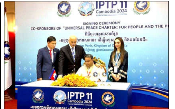
CAMBODIA: Senator Danesh Kumar signing Universal Peace Charter: For People and the Planet at the International Parliament for Tolerance and Peace (IPTP).

He expressed pride in the enduring friendship between the two nations, adding, "The bond between Pakistan and Saudi Arabia will continue to grow stronger with time."