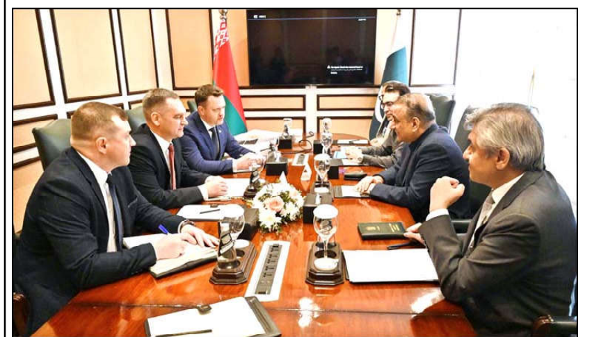
ISLAMABAD: Federal Minister for Communications Abdul Aleem Khan meeting with Minister of Transport and Communications Belarus H.E. Alexey Lyakhnovich.

The minister said that the two countries' exports and trade have a major focus on surgical instruments comprising about 62% of the total exports to Belarus and imports of Belarus tractors and machinery.