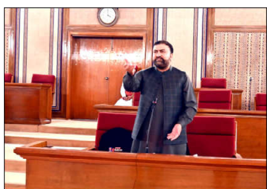
QUETTA: Chief Minister Balochistan Mir Sarfraz Ahmed Bugti expressing his views during Balochistan Assembly session.

When asked about the rumours about change in the Chief Minister-ship, Mir Sarfraz Bugti said that he doesn't believe in such rumours. He also said that he would continue to serve as Chief Minister as long as there is trust of House on him.