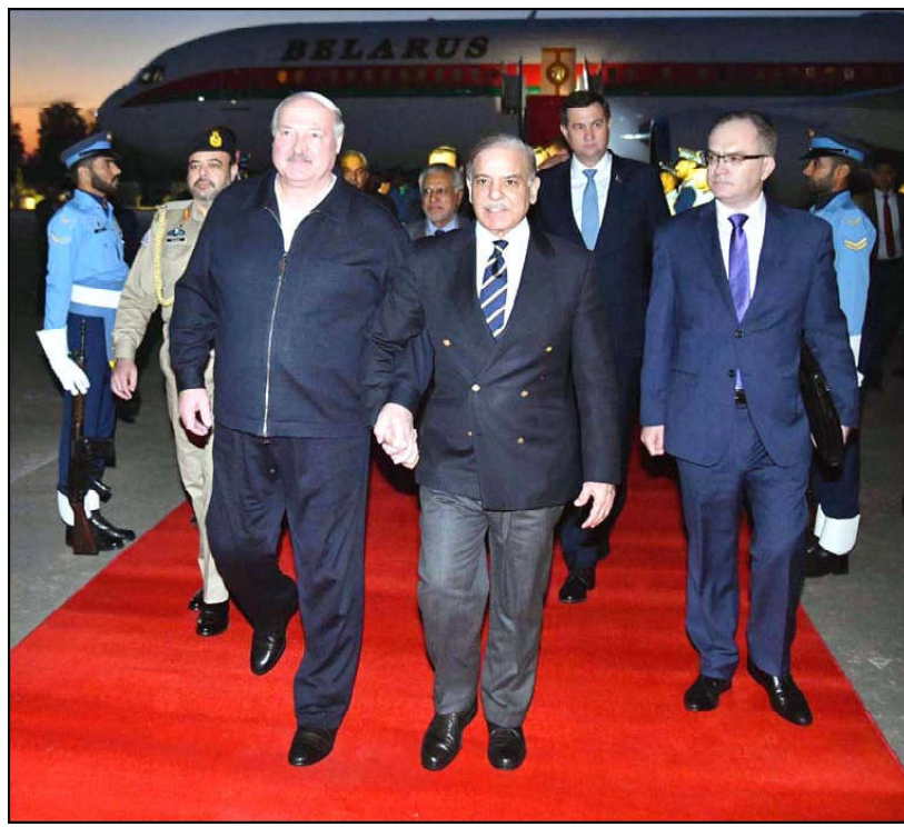
RAWALPINDI: Prime Minister Muhammad Shehbaz Sharif receives President of Belarus Aleksandr Lukashenko at PAF Nur Khan Air Base.