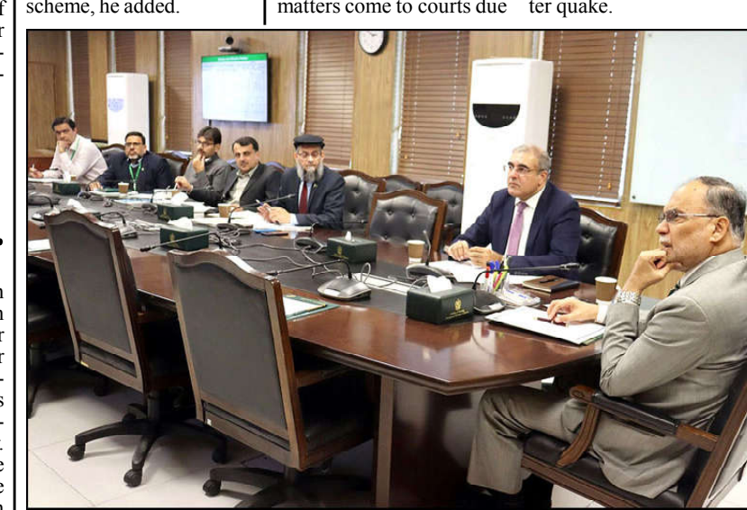
ISLAMABAD: Federal Minister for Planning, Development, and Special Initiatives Ahsan Iqbal chairing a review meeting to assess the progress of Public Sector Development Program (PSDP) projects for 2024-25.

The Constitutional Former Minister for Bench of the Supreme Court, however rejected the petition. Justice Muhammad Ali Mazhar, during the proceedings, remarked that fundamental rights are for all the citizens equally and separate voting for minorities may pave way to discrimination. Only the parliament has the The counsel for the authority to legislate if any