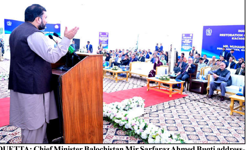
QUETTA: Chief Minister Balochistan Mir Sarfaraz Ahmed Bugti addressing inaugural ceremony of restoration project of Kachhi Canal.

Commenting on a statement by the spouse of PTI founder regarding Saudi Arabia, he said: 'There can be no animosity to Pakistan bigger than this" and explained that such people were naive to the magnitude of the damsupport to Pakistan and age through their "venom-the current leadership had ous" words.