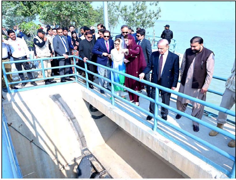
TAUNSA BARRAGE/KOT ADDU: Prime Minister Muhammad Shehbaz Sharif, Balochistan Chief Minister Mir Safaraz Ahmed Bugti and Punjab Chief Minister Maryam Nawaz having a glimpse of flow of water from Indus River to Kachhi Canal.

Ph: 2841470/2841473 Vol: XX No. 125, Jamaadi ul Awwal 20, 1446 AH Saturday November 23, 2024, Pages 04, Price Rs.15